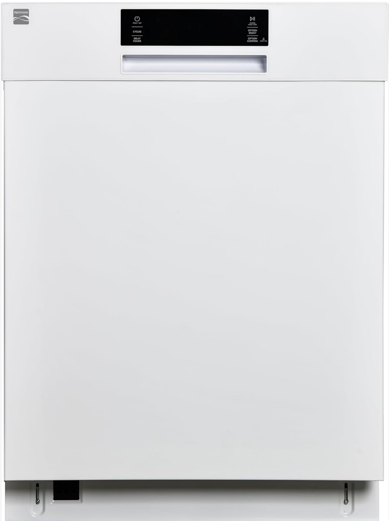
Front view of the Kenmore 24-inch white built-in dishwasher, showcasing its sleek design.