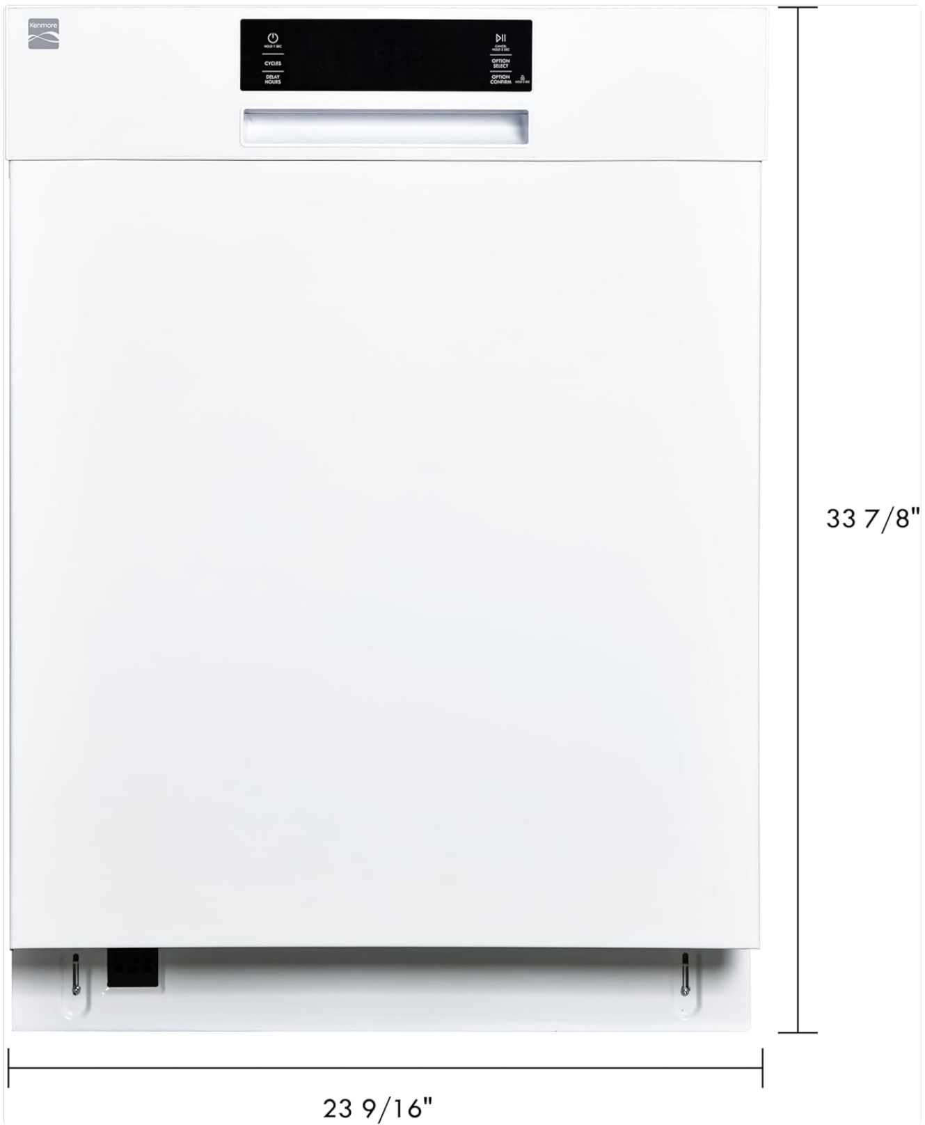
Front view with key dimensions for installation planning.