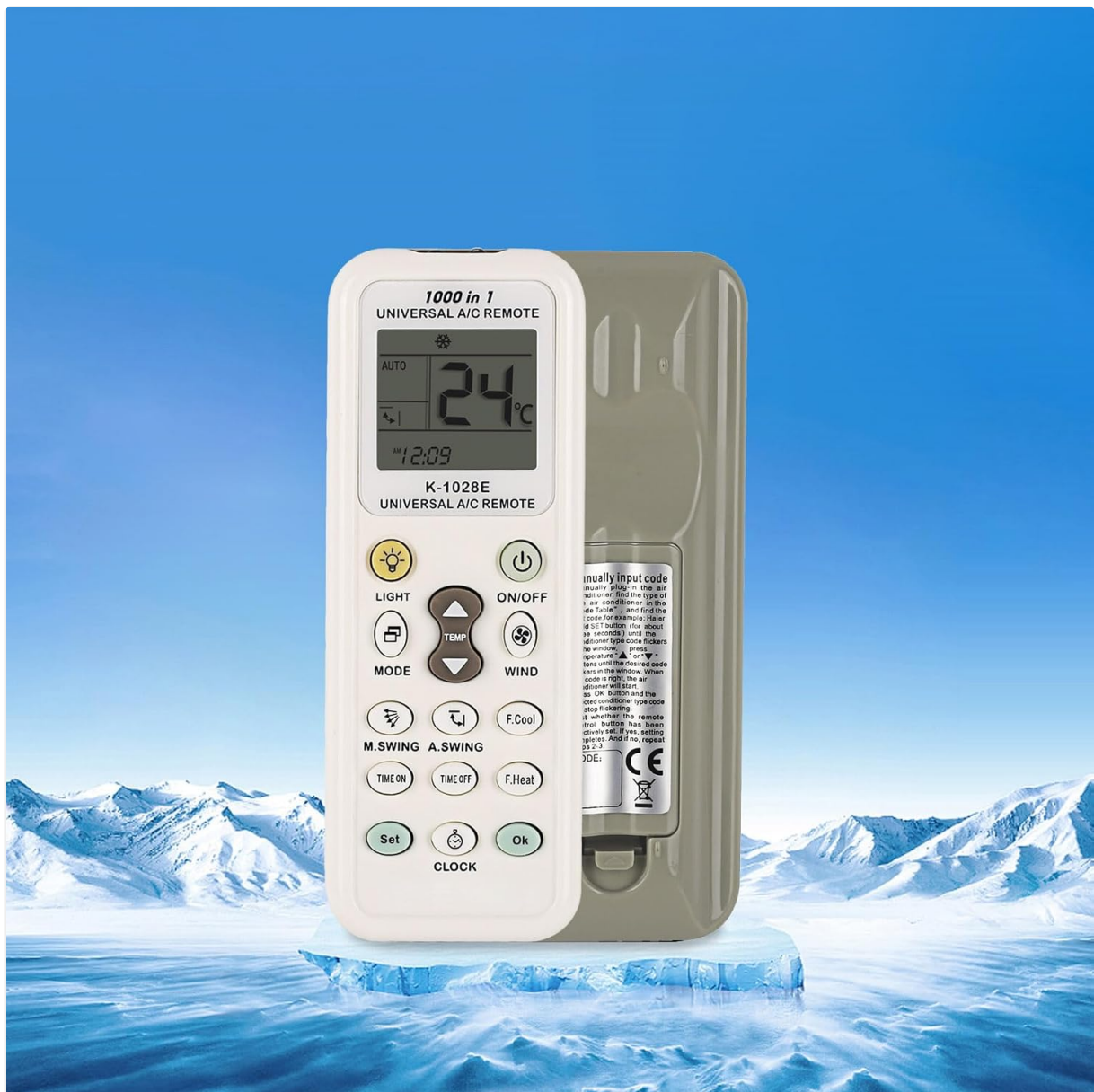
Rear view of the K-1028E remote control, indicating the battery compartment location.