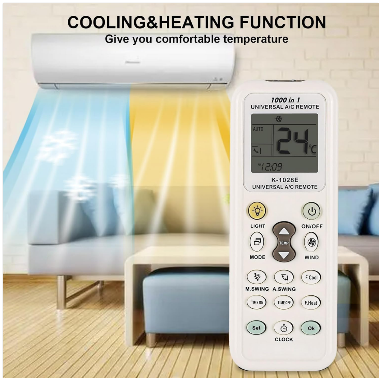
The K-1028E remote control operating an air conditioner, illustrating its cooling and heating functionalities.