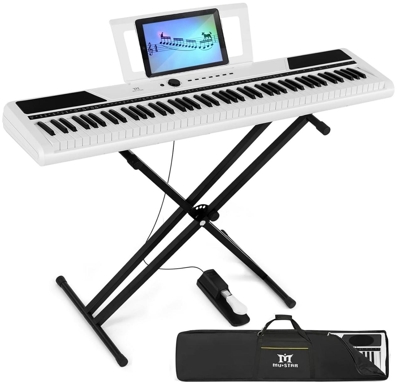
Figure 1: MUSTAR Digital Piano MEP-1400