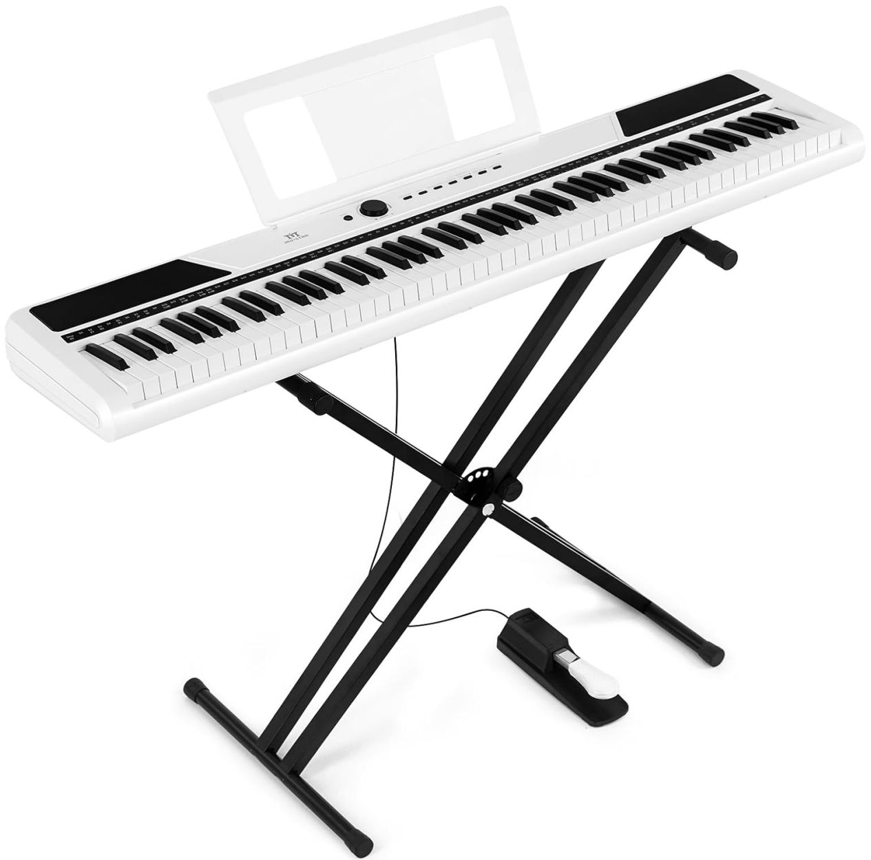
Figure 5: Semi-Weighted Key Touch Response