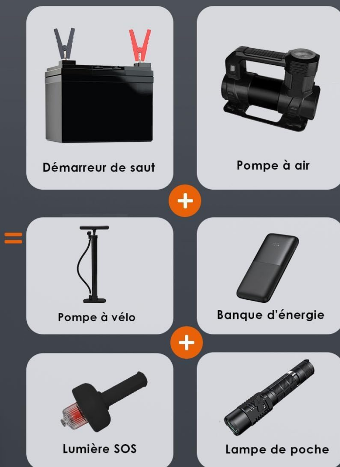
Image: BUVAYE YS03 Portable Car Battery Booster and Inflator, showcasing its compact design and integrated display.