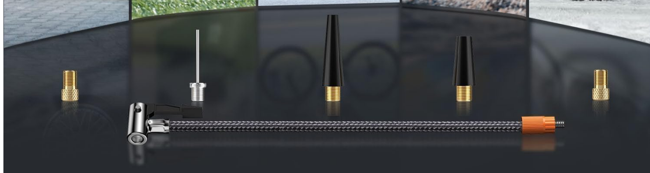
Image: Various inflation nozzles and adapters included with the BUVA YE YS03 for different inflation needs.

Your browser does not support the video tag.