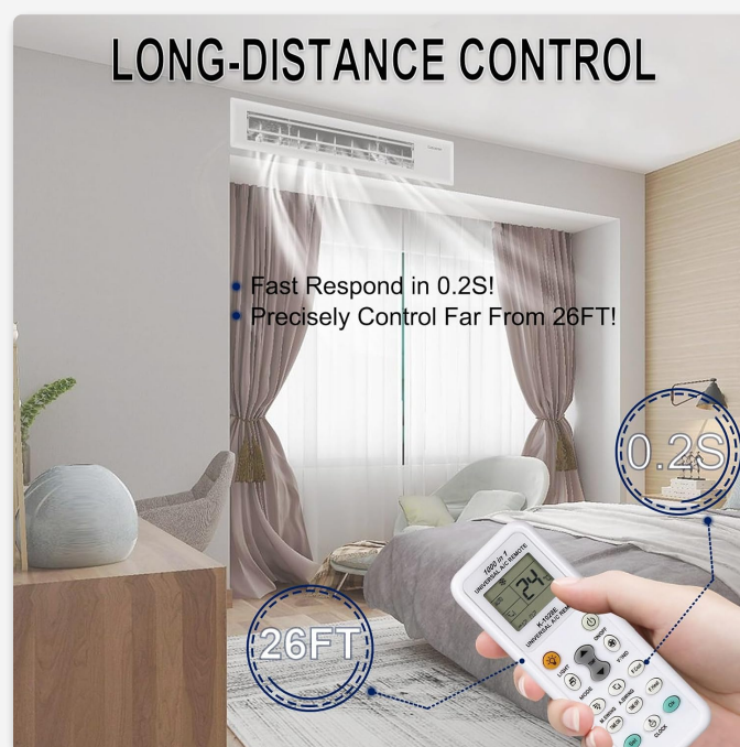
Image: The K-1028E remote control being used in a bedroom, demonstrating its long-distance control capability (up to 26 feet) and fast response time (0.2 seconds).