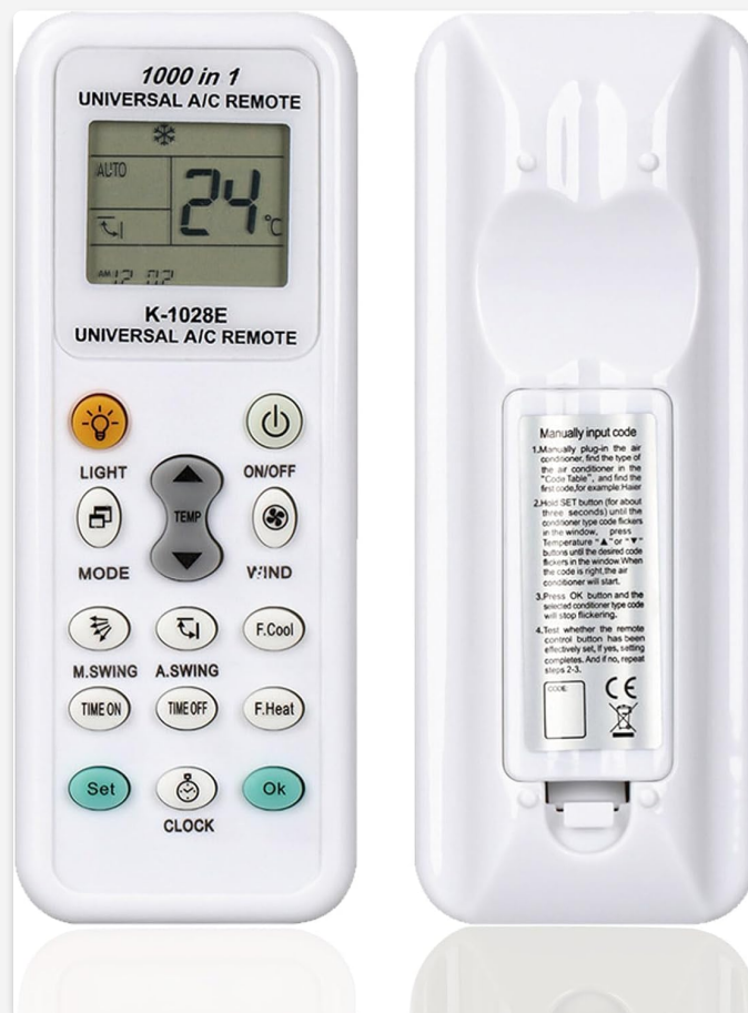
Image: Front and back view of the K-1028E universal A/C remote control, showing the LCD screen, buttons, and battery compartment with manual code input instructions.