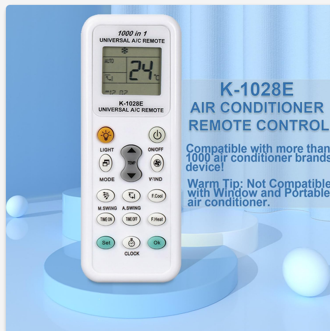
Image: The K-1028E universal A/C remote control with text highlighting its compatibility with over 1000 air conditioner brands and a

The K-1028E is designed to be compatible with over 99% of air conditioner brands, offering a convenient 1000-in-1 solution. Please note: This universal remote control is not compatible with WINDOW and PORTABLE air conditioner units.