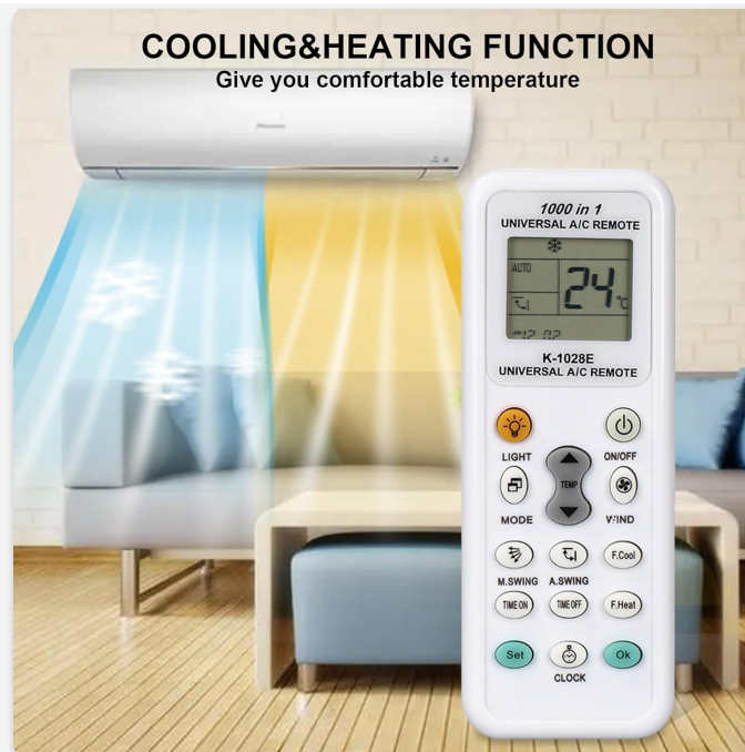
Image: The K-1028E remote control in a living room setting, illustrating its cooling and heating functions with blue and orange airflows from an air conditioner unit.