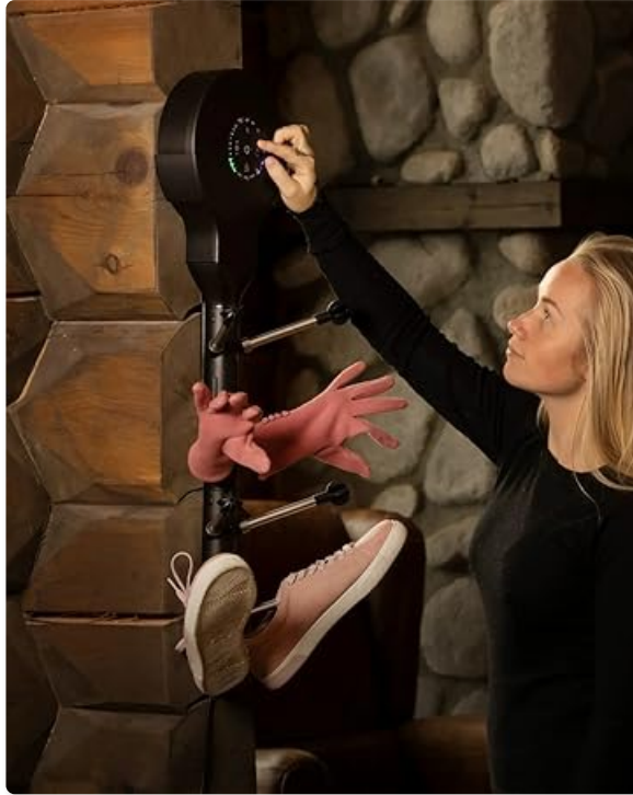
Image 6.2: User interacting with the control panel to adjust settings.