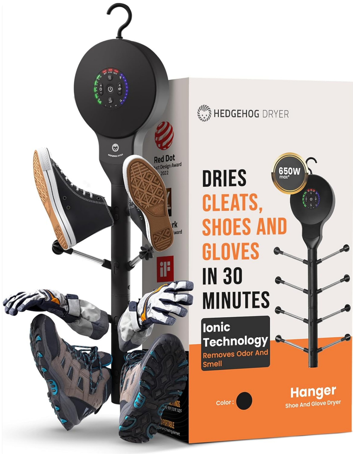
Image 1.1: The Hedgehog Hanger Shoe Dryer, showcasing its design with shoes and gloves placed on the drying arms.