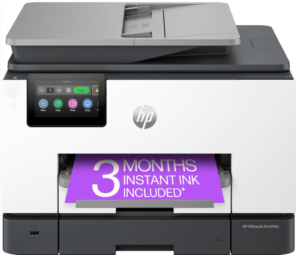
Figure 1.1: Front view of the HP OfficeJet Pro 9135e All-in-One Printer, highlighting its compact design and touchscreen display.