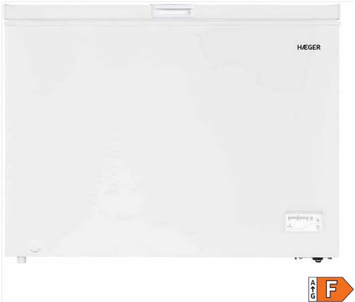
Figure 2: HAEGER CF-300.017A Chest Freezer displaying its energy efficiency label. This image shows the freezer with the energy label attached, indicating its energy class F rating.