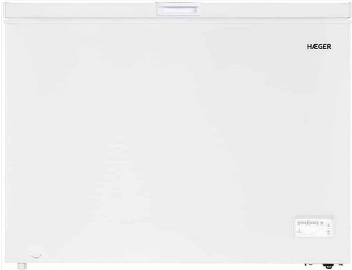
Figure 1: Front view of the HAEGER CF-300.017A Chest Freezer. This image shows the overall design of the freezer, highlighting its white exterior and the HAEGER logo.

Choose a suitable location for your freezer. It should be placed on a firm, level surface away from direct sunlight, heat sources (e.g., stoves, radiators), and extreme cold. Ensure adequate ventilation around the appliance. Allow at least 10 cm of space around the sides and back for proper air circulation.