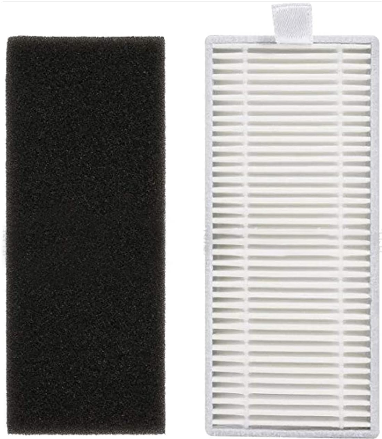
Image: A white pleated HEPA filter and a black foam pre-filter, typically used together in the dust bin.