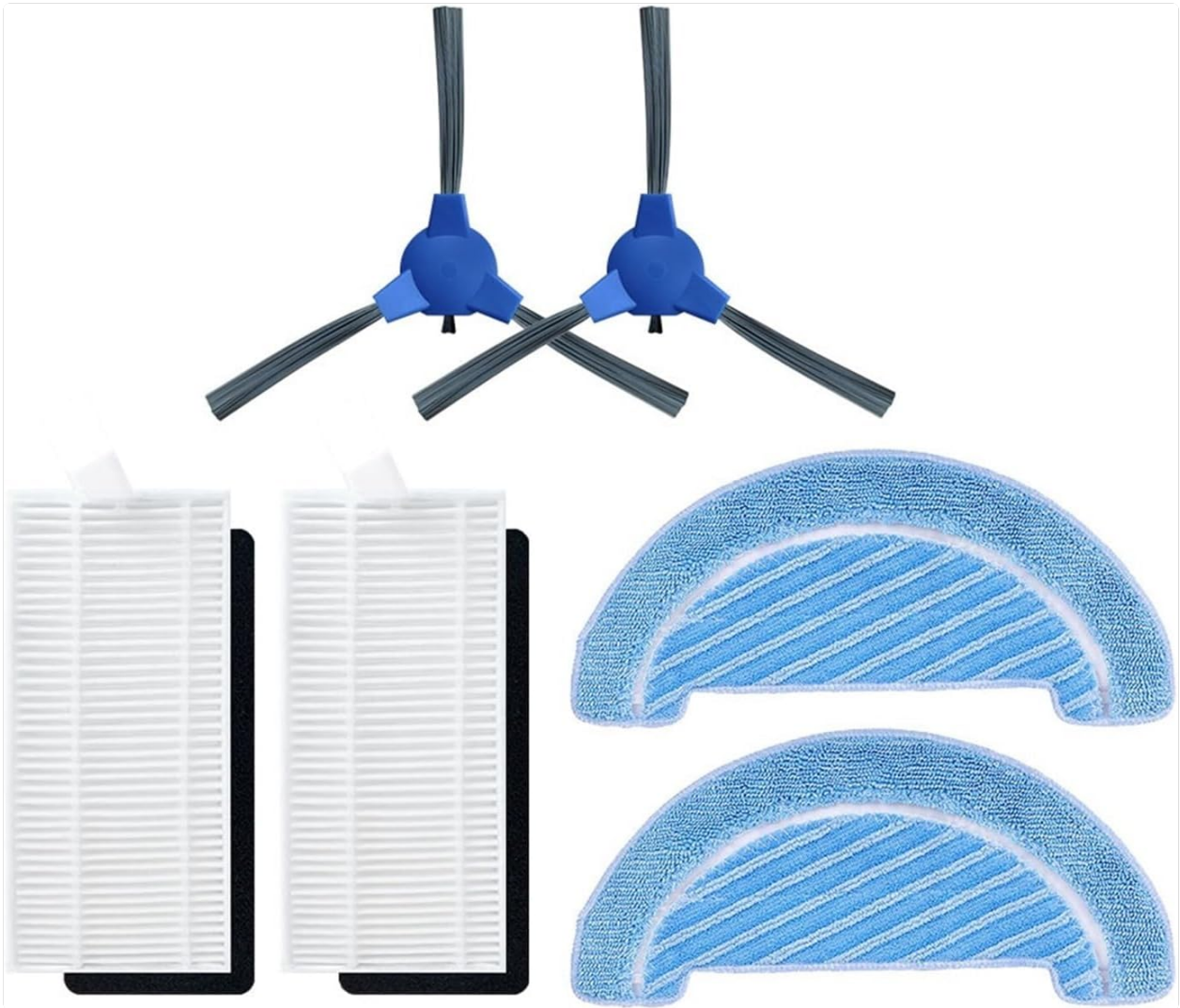
Image: Overview of the EtlIN Replacement Parts Set N, showing two side brushes, two HEPA filters, and two mop rags.