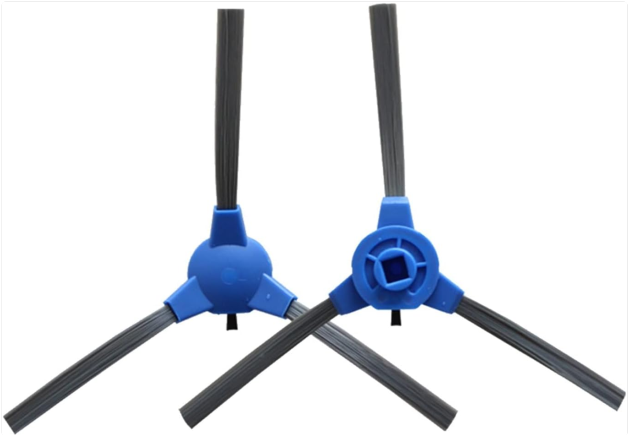
Image: Close-up of two replacement side brushes, showing their three-arm design and central attachment point.