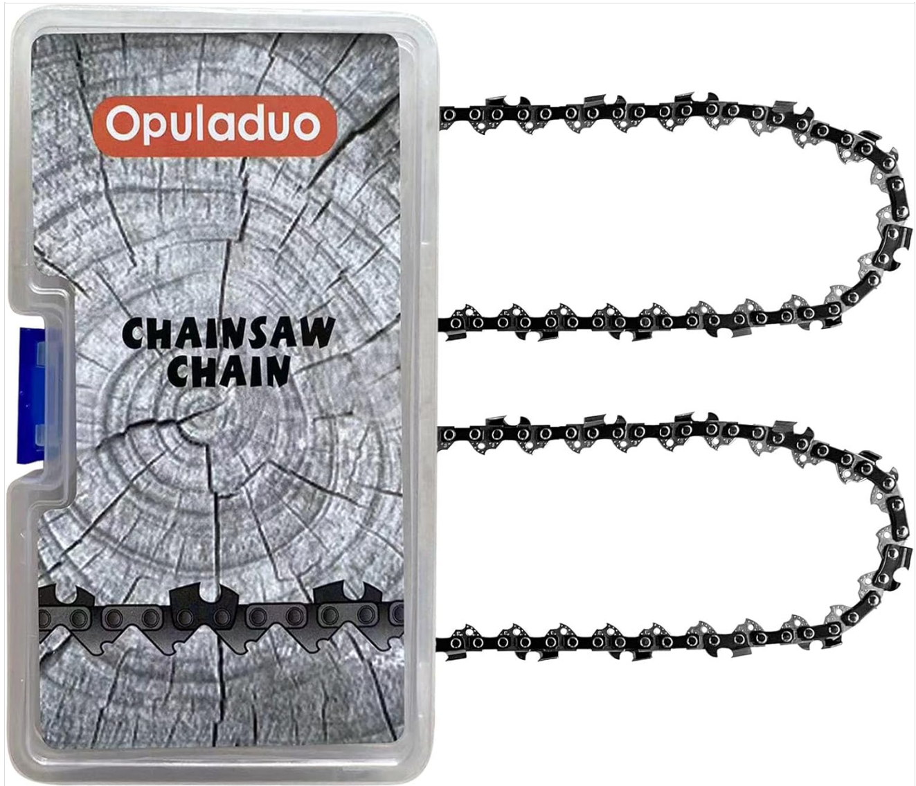
Image: Two Opuladuo 18-inch chainsaw chains stored in a clear plastic case, ready for use or storage.