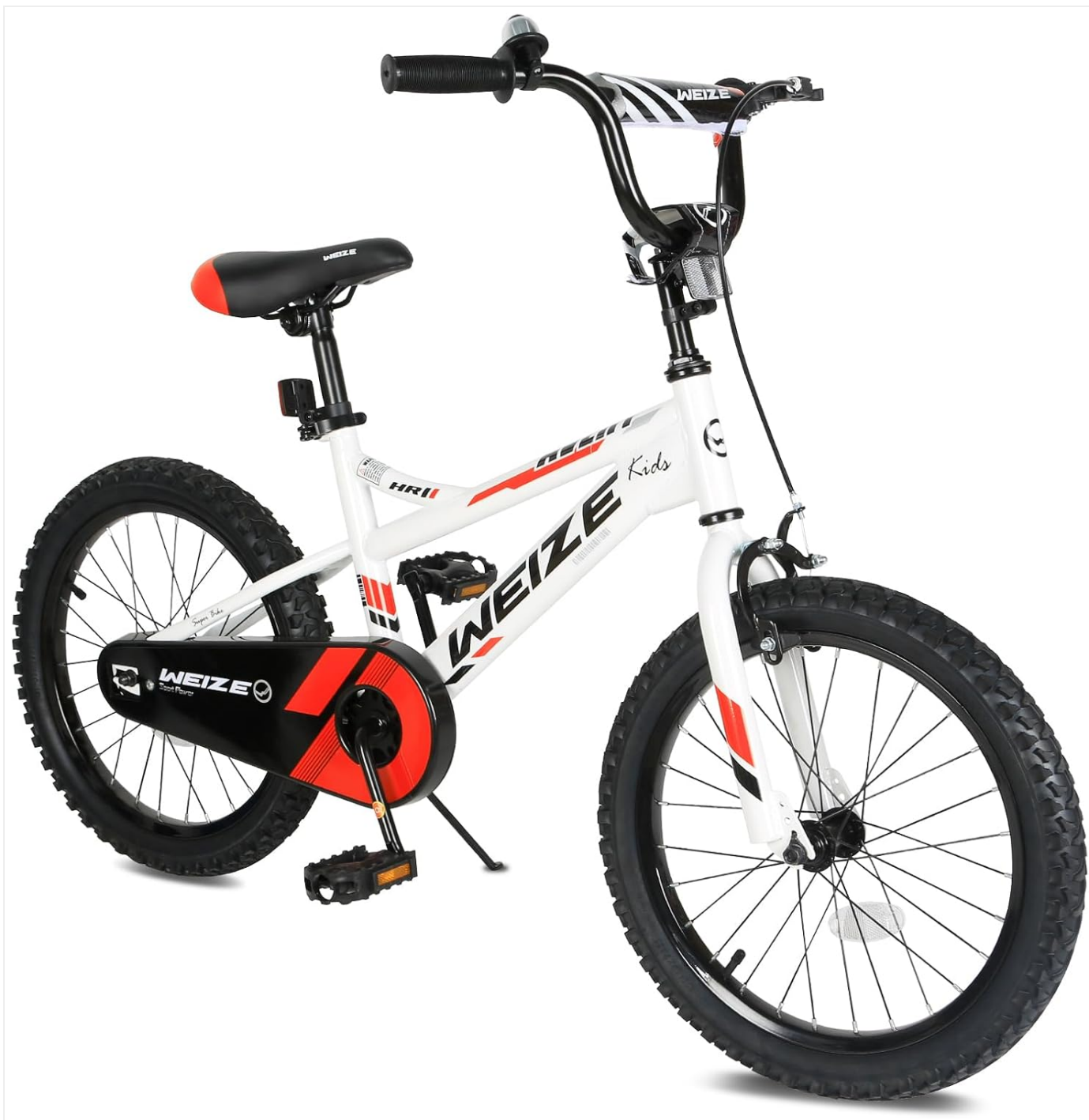
Image Description: A full view of the WEIZE Kids Bike in white, featuring red and black accents on the frame and chain guard. The bike has black tires, a red seat, and a bell on the handlebar.