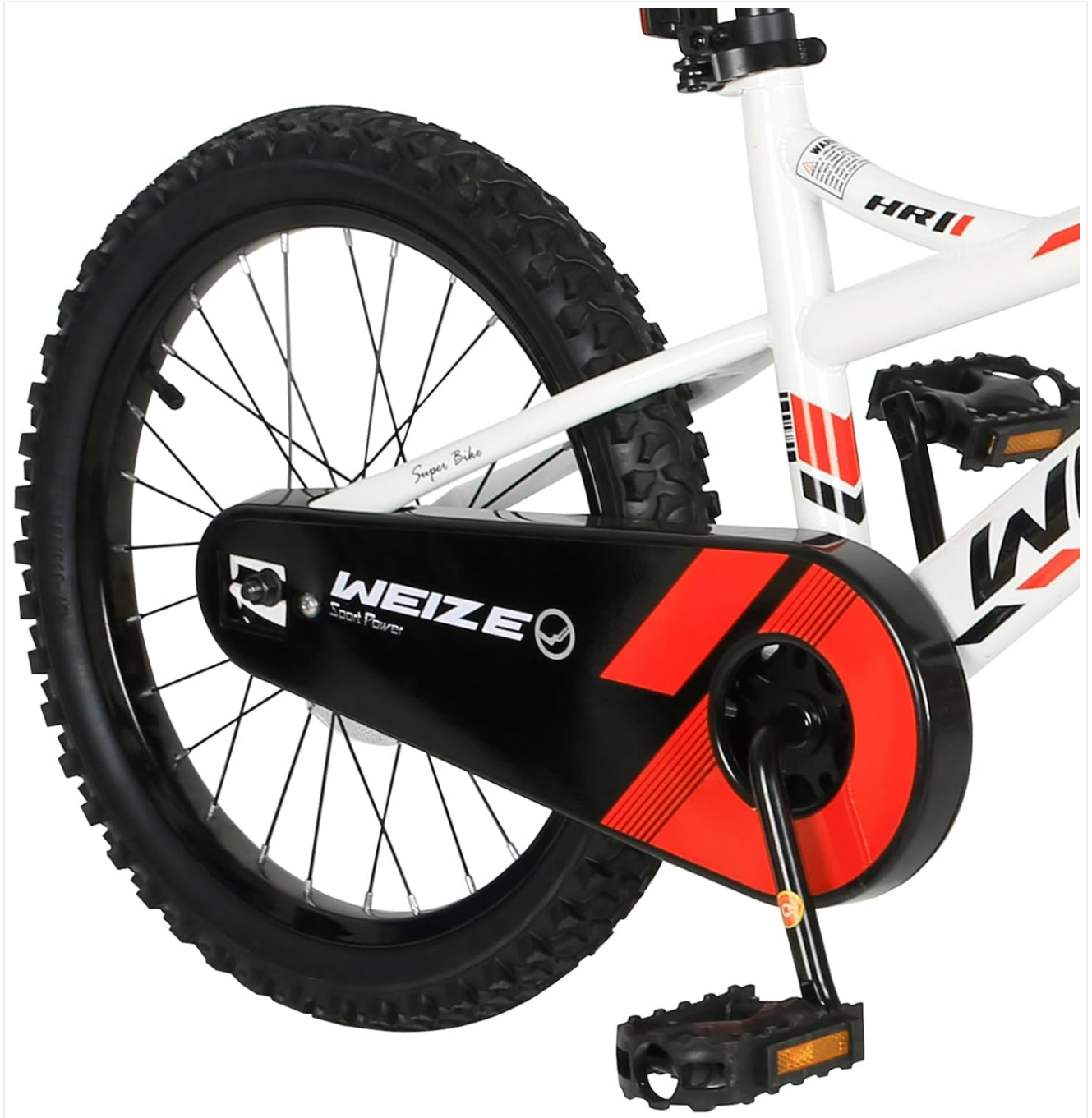
Image Description: A close-up view of the rear wheel and pedal area of the WEIZE Kids Bike, highlighting the fully enclosed chain guard. This guard helps protect the chain from dirt and debris and prevents clothing from getting caught.