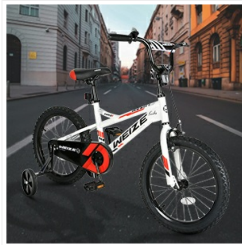
Image Description: A white WEIZE Kids Bike, equipped with training wheels, is parked on a city street. This image illustrates the bike's appearance with training wheels attached, suitable for beginner riders.