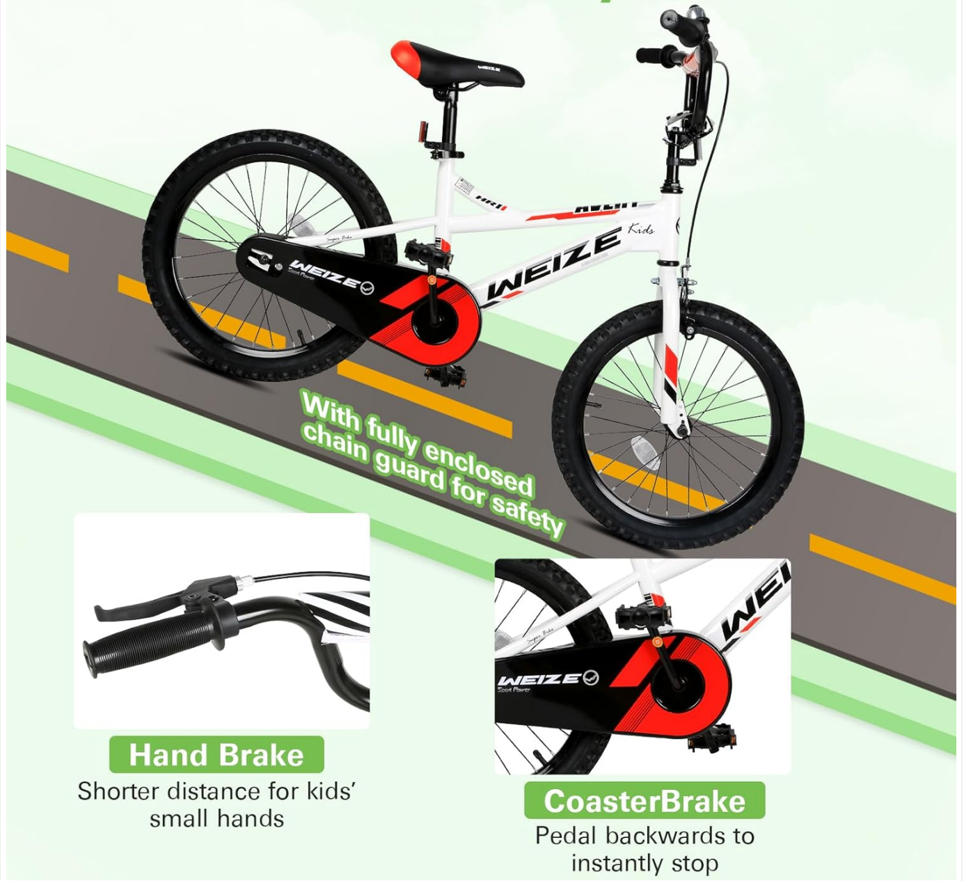
Image Description: This image showcases the WEIZE Kids Bike's dual brake system. It features the full bike with an inset showing a close-up of the hand brake lever and another inset illustrating the coaster brake mechanism at the rear wheel, emphasizing the fully enclosed chain guard for safety.