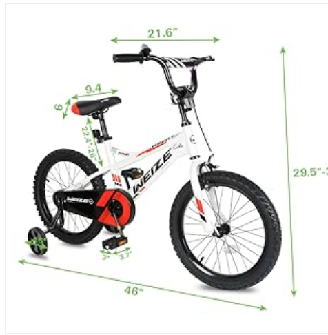
Image Description: Diagram showing the dimensions of the 16-inch WEIZE Kids Bike, including overall length, height, handlebar width, and seat height range.