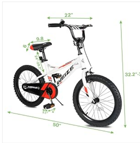
Image Description: Diagram showing the dimensions of the 18-inch WEIZE Kids Bike, including overall length, height, handlebar width, and seat height range.