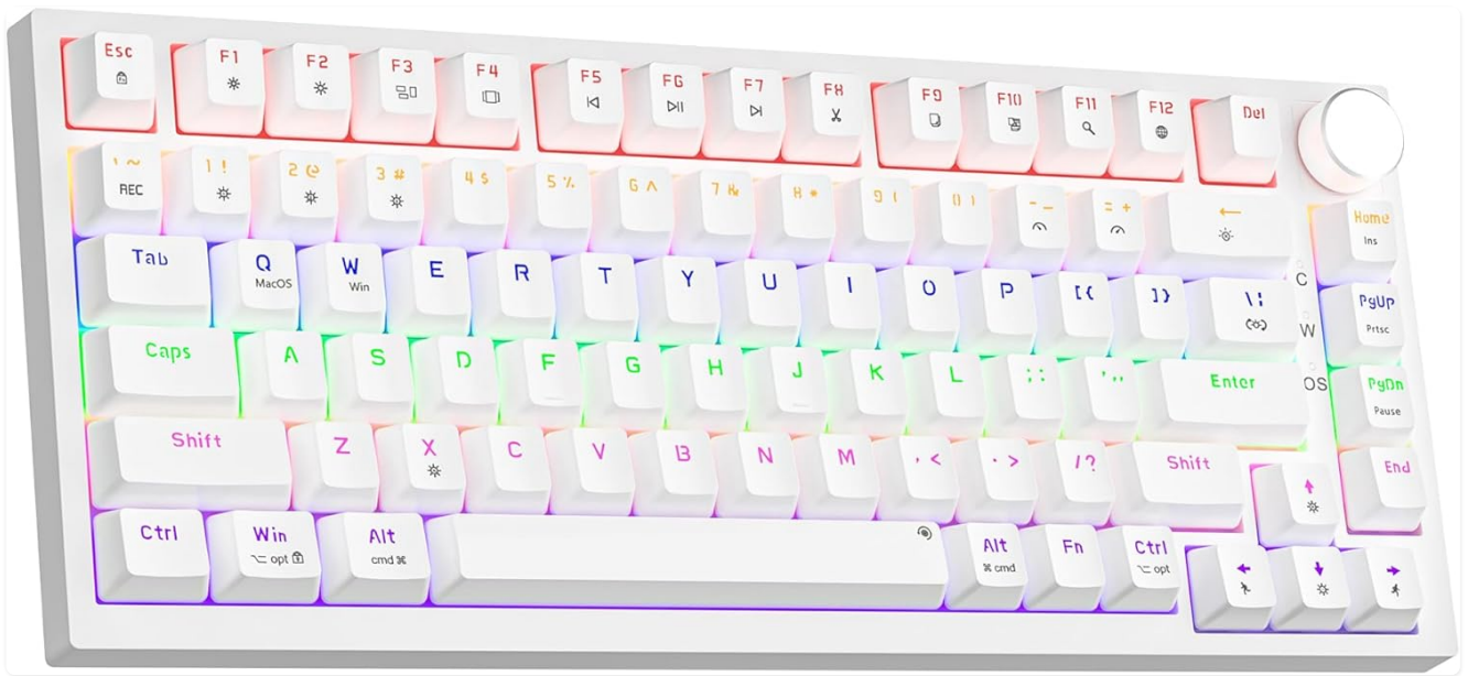
The Newmen GM326 keyboard, ready for connection.