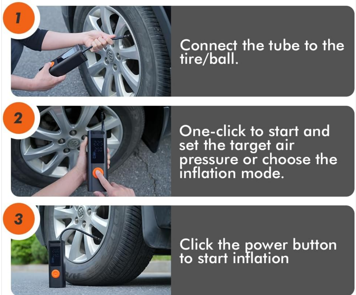
Figure 4: Easy-to-follow steps for product use.