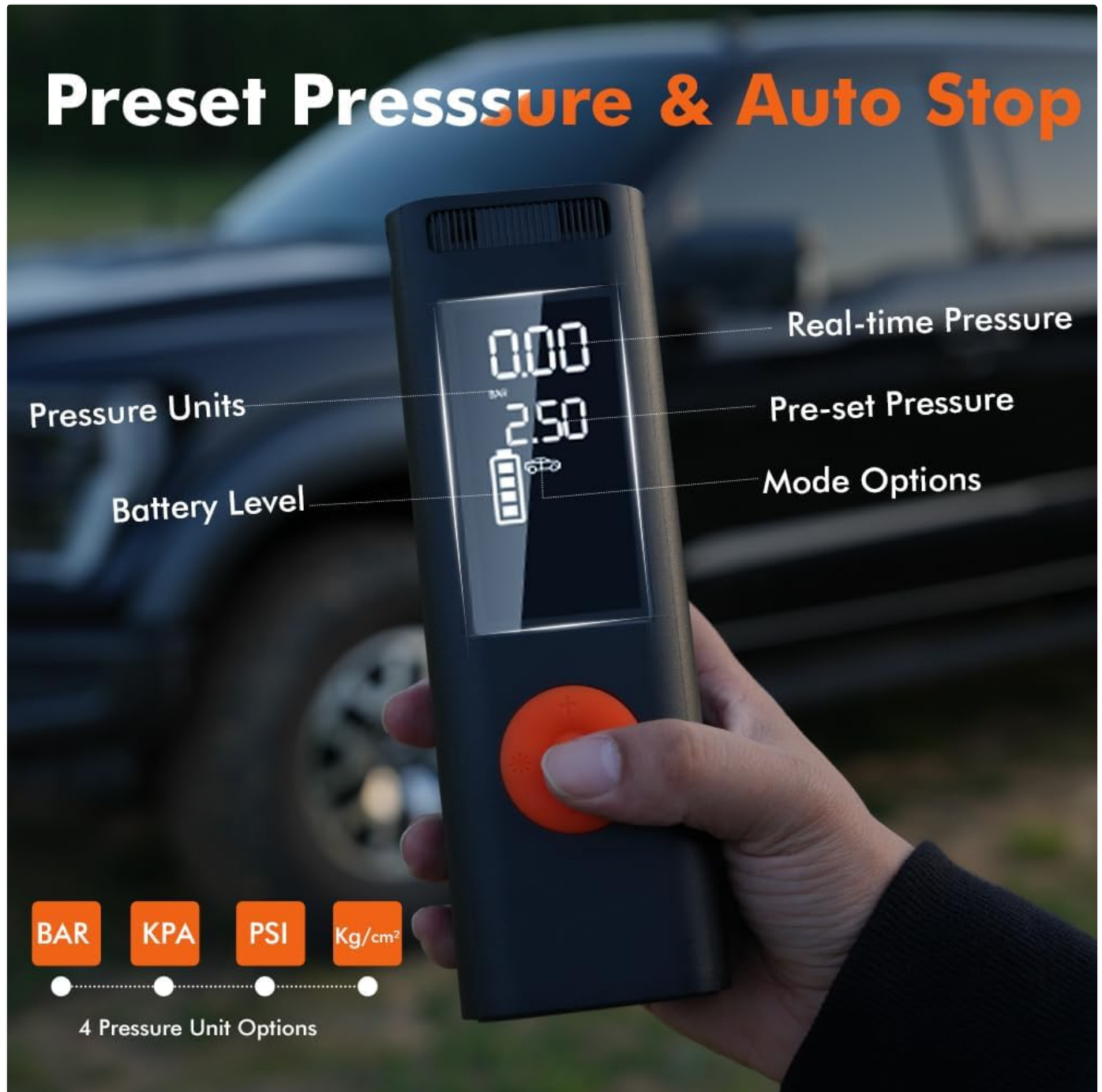
Figure 3: LCD screen displaying device status and settings.

charge ensures optimal performance and standby time.