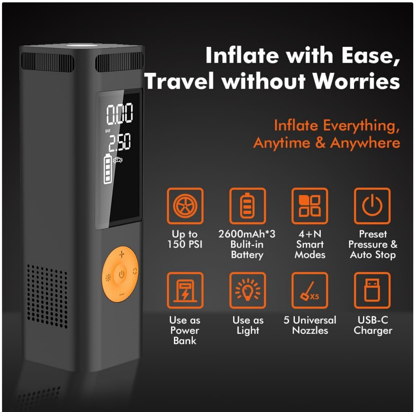
Figure 2: Overview of ZETTA 1024 key features.