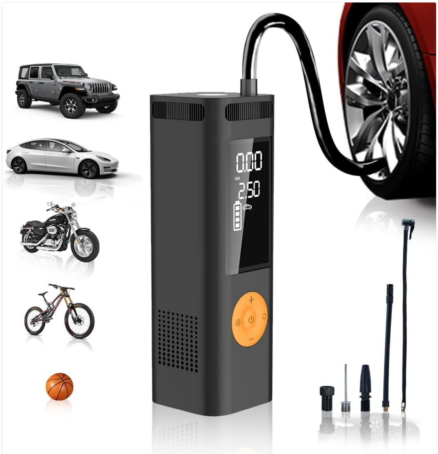
Figure 1: ZETTA 1024 Portable Tire Inflator and its applications.