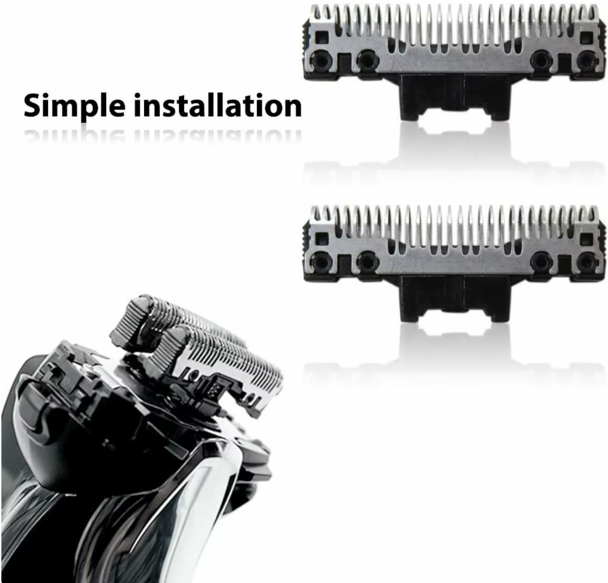
Image: The replacement blades positioned for simple installation into a shaver head.