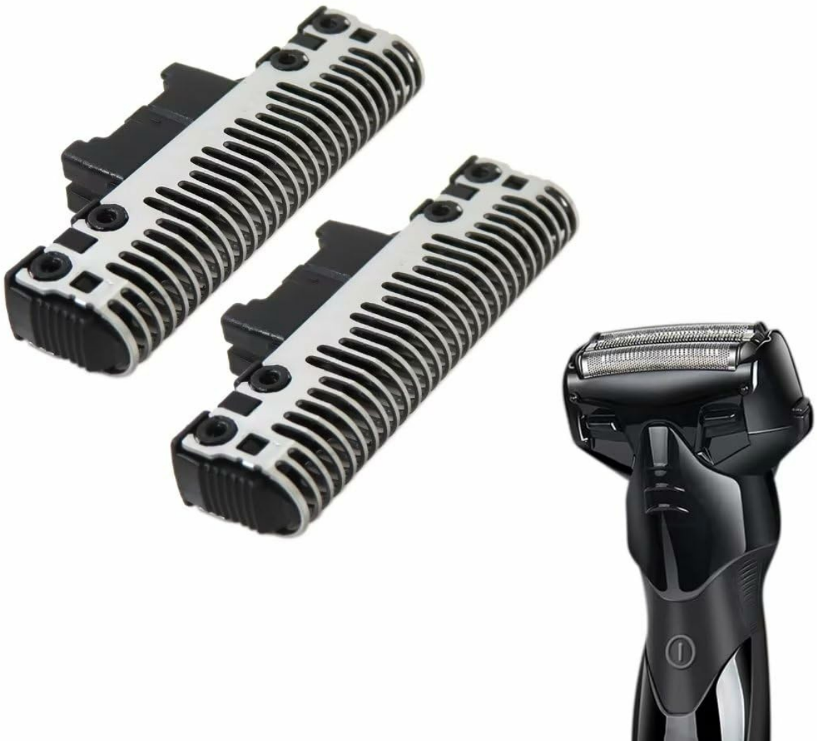
Image: Replacement blades shown with a compatible Panasonic shaver, indicating the correct fit for models like ES762, ES765, ES766, ES882, ES8951, WES9077P, WES9075P.

For PANASONIC ES762 ES765 ES766 ES882 ES8951 WES9077P WES9075P