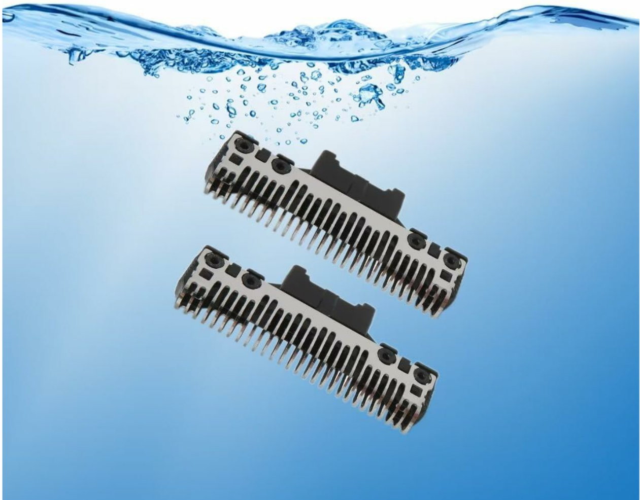
Image: Replacement blades being cleaned under water, demonstrating their waterproof design for easy maintenance.