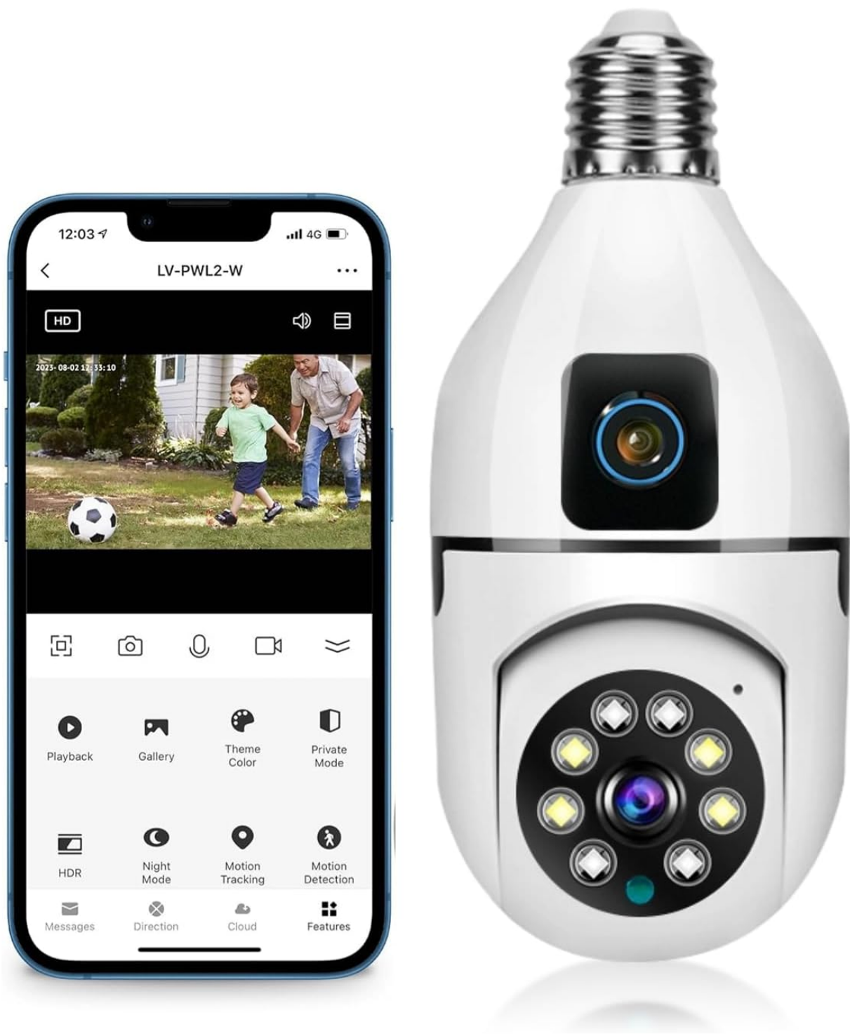
Image: Yoidesu Light Bulb Camera and its accompanying mobile application interface.