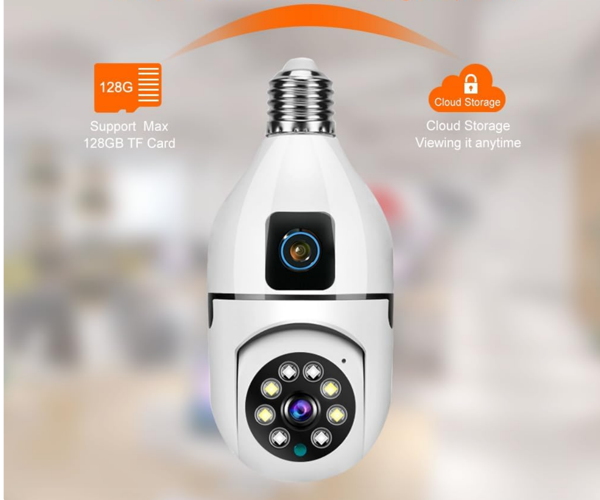
Image: Visual representation of the camera's storage options, including local TF card and cloud storage.