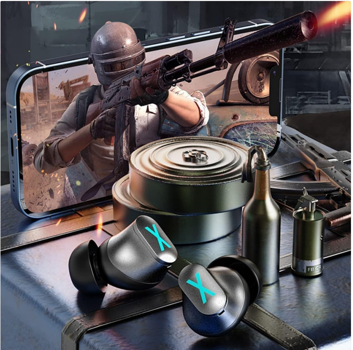
Image: The K89 earbuds positioned in a gaming scenario, alongside a smartphone displaying a game, emphasizing their use for gaming.