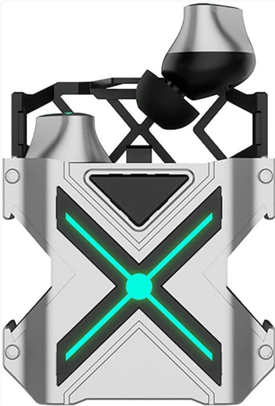
Image: The SETHDA K89 Gaming Earbuds with their charging case, showcasing their futuristic design.