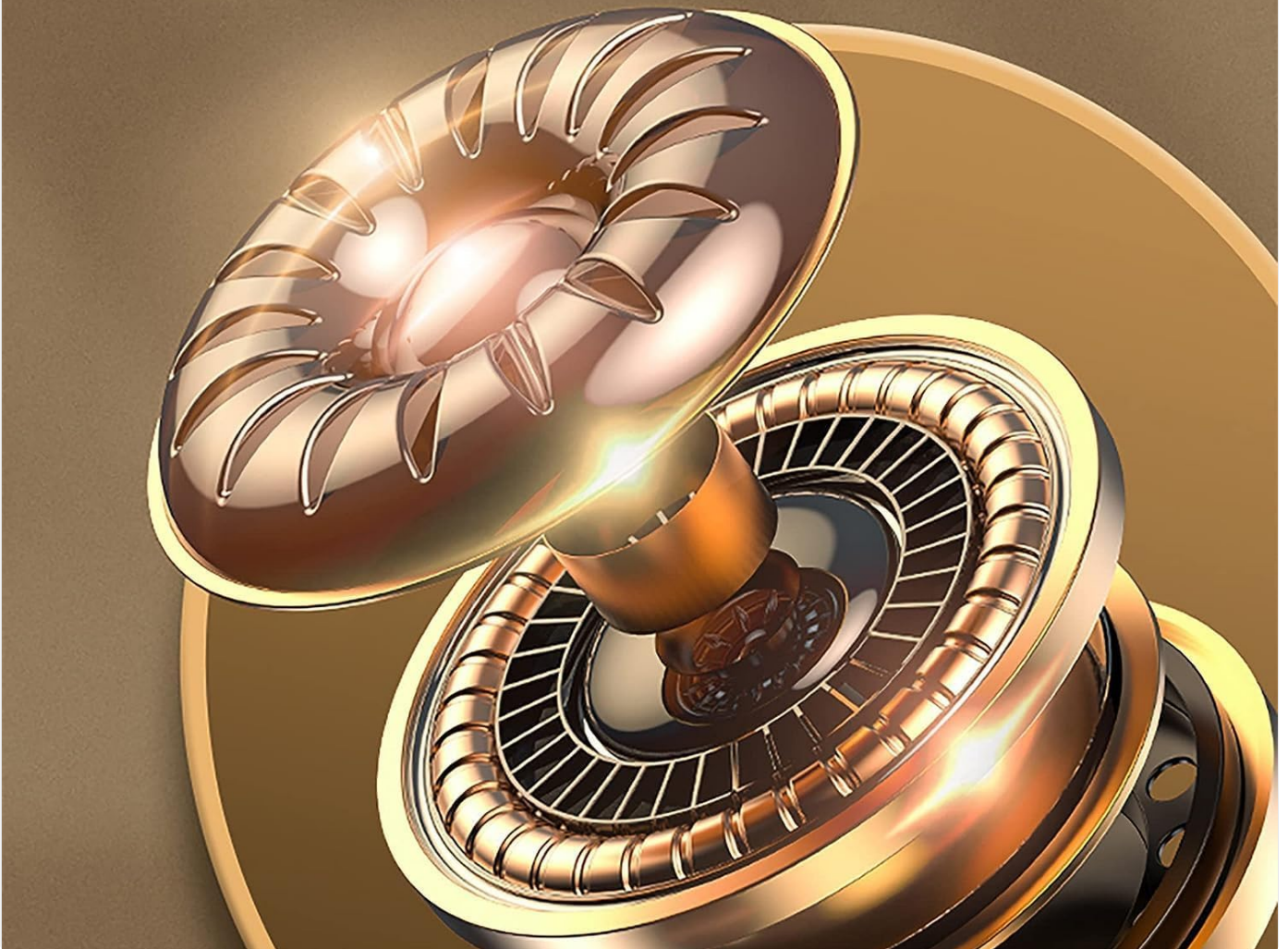
Image: A detailed close-up of the earbud's internal speaker driver, illustrating the Hi-Fi audio technology.