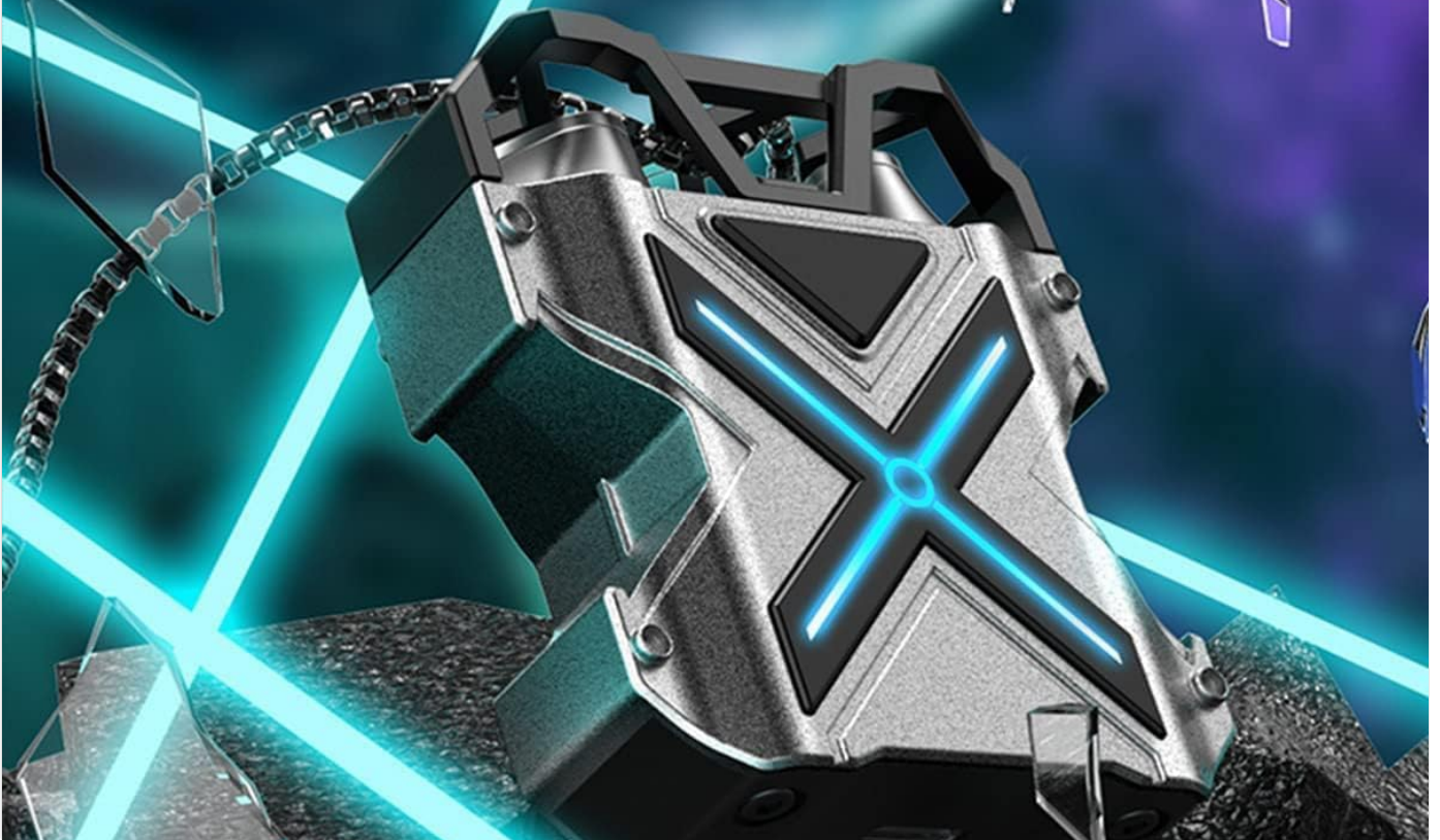
Image: The K89 earbuds and charging case displayed in a dynamic, futuristic environment, highlighting their modern aesthetic.