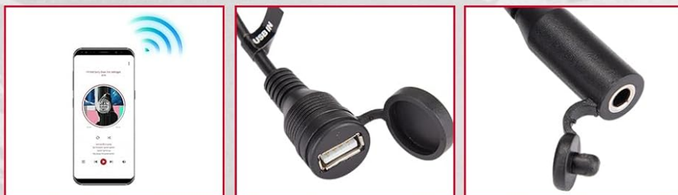
Image: Visual representation of connecting a smartphone via Bluetooth to the sound system.