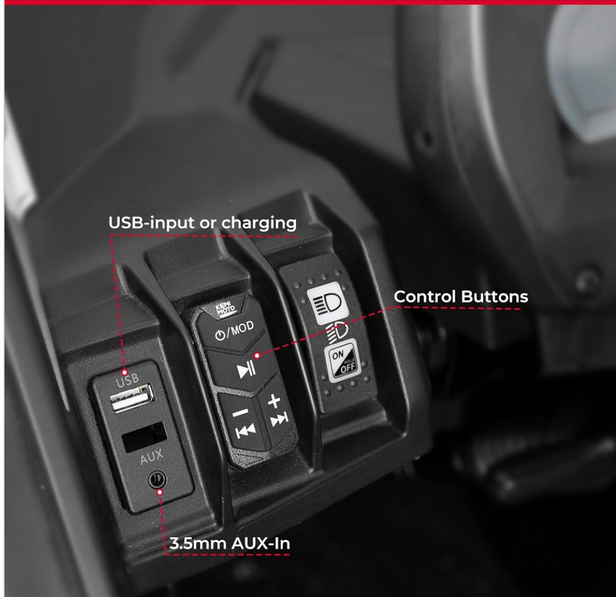
Image: Close-up of the control panel, showing the USB input, AUX input, and control buttons.

Your browser does not support the video tag.