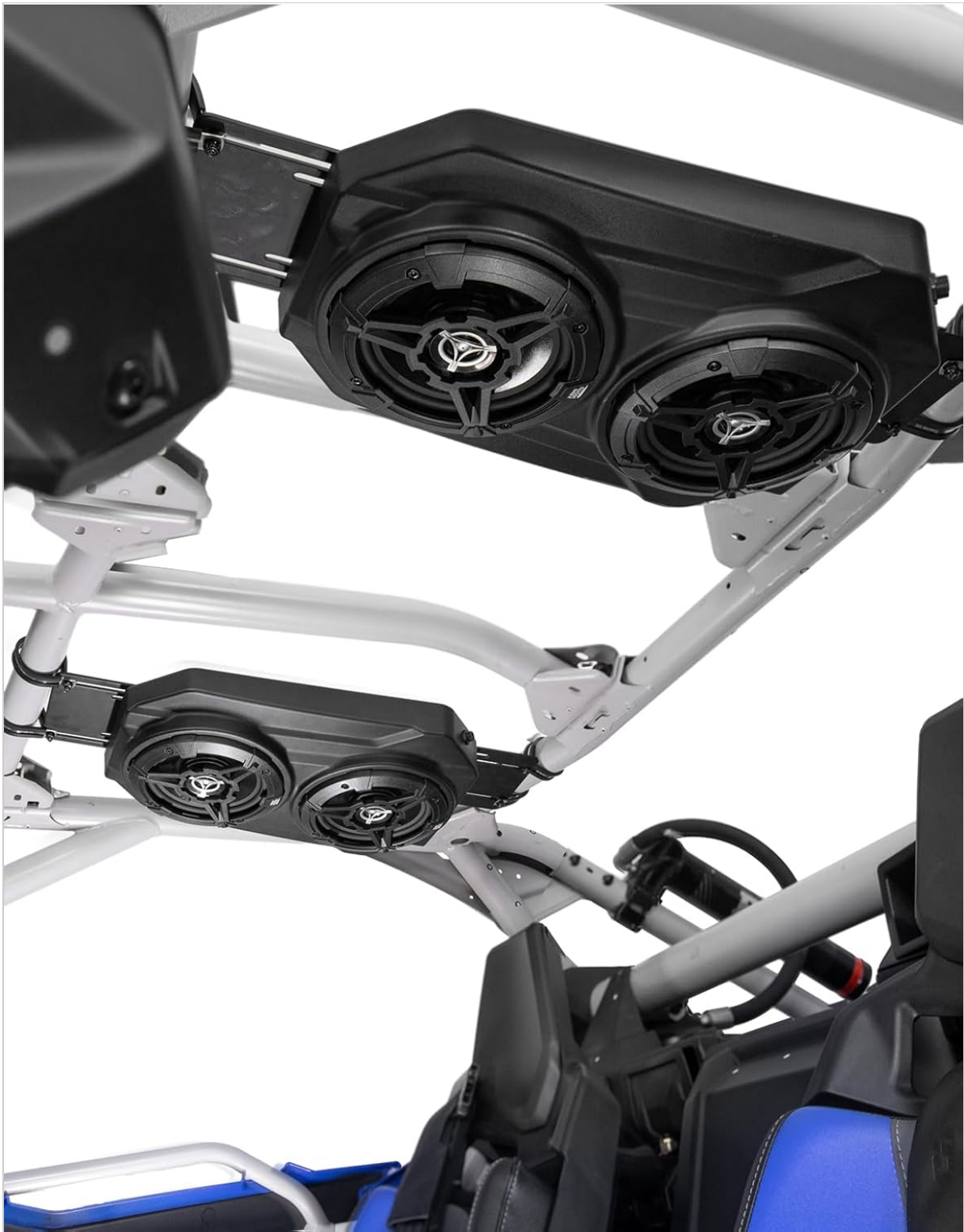
Image: The KEMIMOTO UTV sound system securely mounted to the vehicle's roll cage.