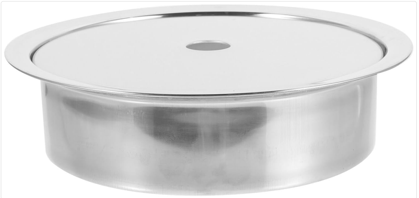
Image 1: The OSALADI Induction Cooker Adapter Plate, showcasing its sleek stainless steel design and integrated lid.

The OSALADI Induction Cooker Adapter Plate is a robust and practical accessory designed to integrate induction cookers or gas stoves into hot pot tables. Made from durable stainless steel, this fitting ensures stability and longevity. It is an ideal solution for repairing existing hot pot tables or setting up new ones, providing a secure and functional cooking surface.