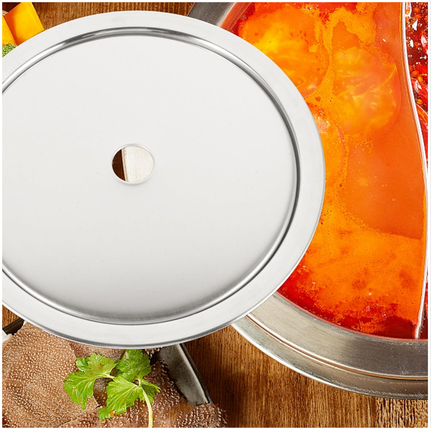
Image 4: An example of the adapter plate in use during a hot pot meal, demonstrating its practical application.