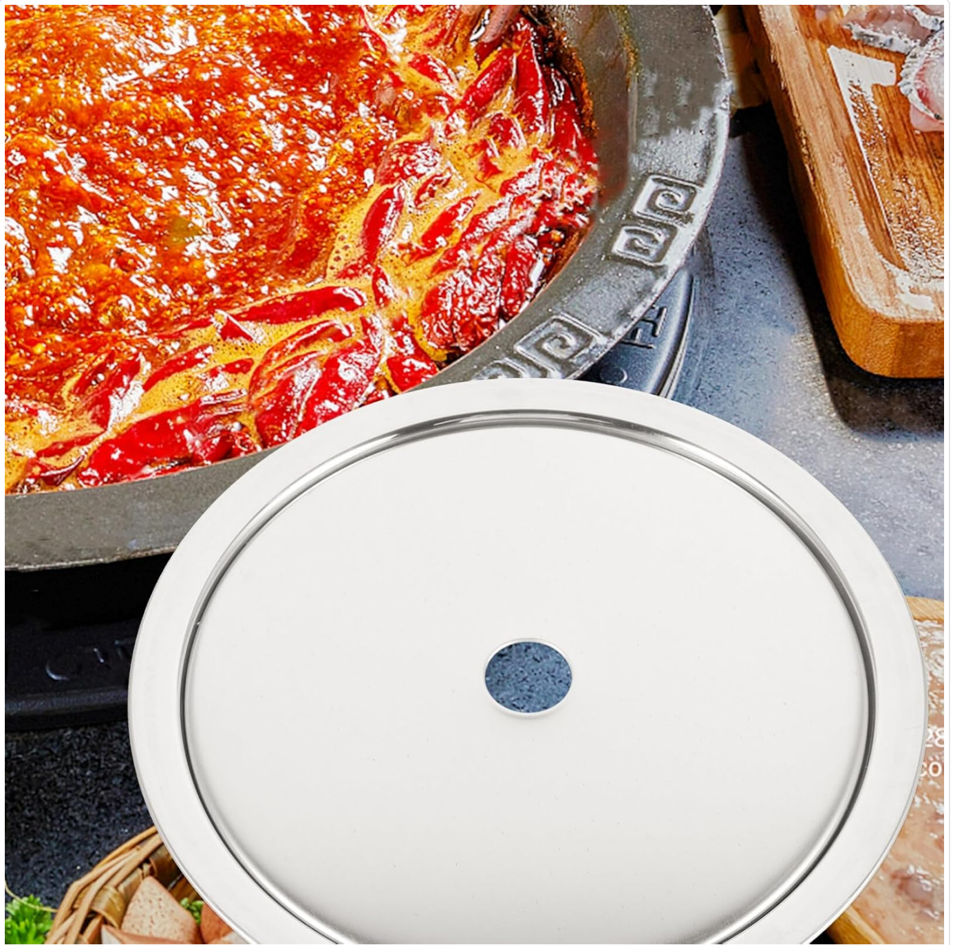
Image 3: The adapter plate seamlessly integrated into a hot pot table, ready for a cooking appliance.