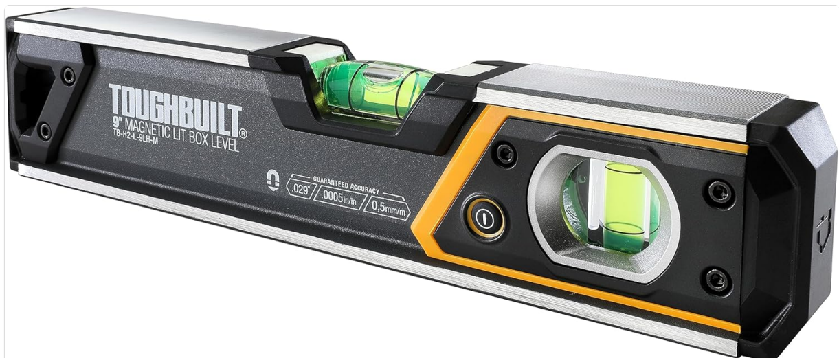
Front view of the ToughBuilt 9-inch Lighted Magnetic Box Level, showcasing its robust design and illuminated vials.

The ToughBuilt 9-inch Lighted Magnetic Box Level is engineered for precision and durability in various work environments. Its compact design and advanced features make it suitable for professional and DIY applications.