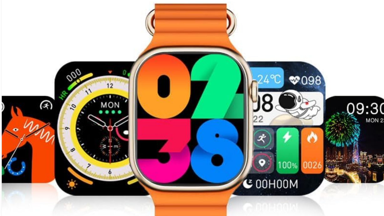
Image: Several X9 Pro Smartwatches with different watch faces displayed, showcasing the dial switching and style customization options.

A variety of dial options, matching different occasions to meet the daily needs of collocation