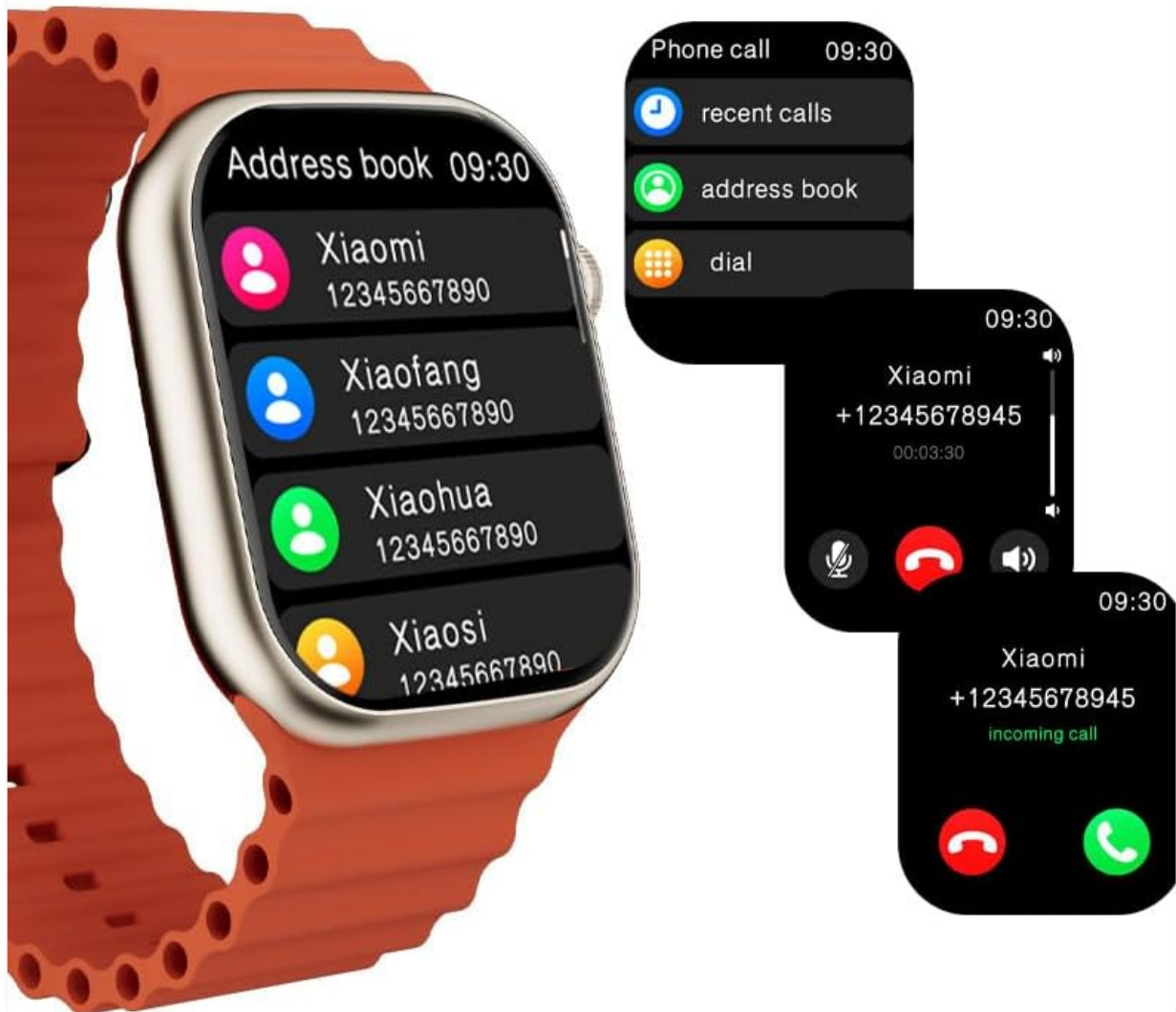
Image: The X9 Pro Smartwatch screen showing options for recent calls, address book, and dial pad, along with an incoming call notification. This demonstrates the Bluetooth call and address book synchronization features.

Call sliding answer, call dialing, HD sound quality call synchronization mobile phone call records, free call back, free answer