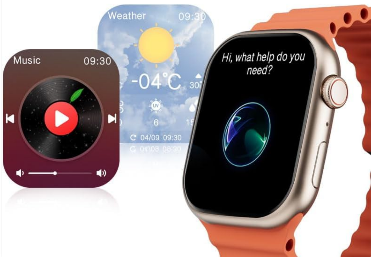
Image: The X9 Pro Smartwatch screen showing the weather forecast and the AI voice assistant interface, ready to receive commands. This highlights the AI intelligence and voice assistant functionality.

Wear a watch, make a call, do not lose a call at critical times: play music, check the weather... ..