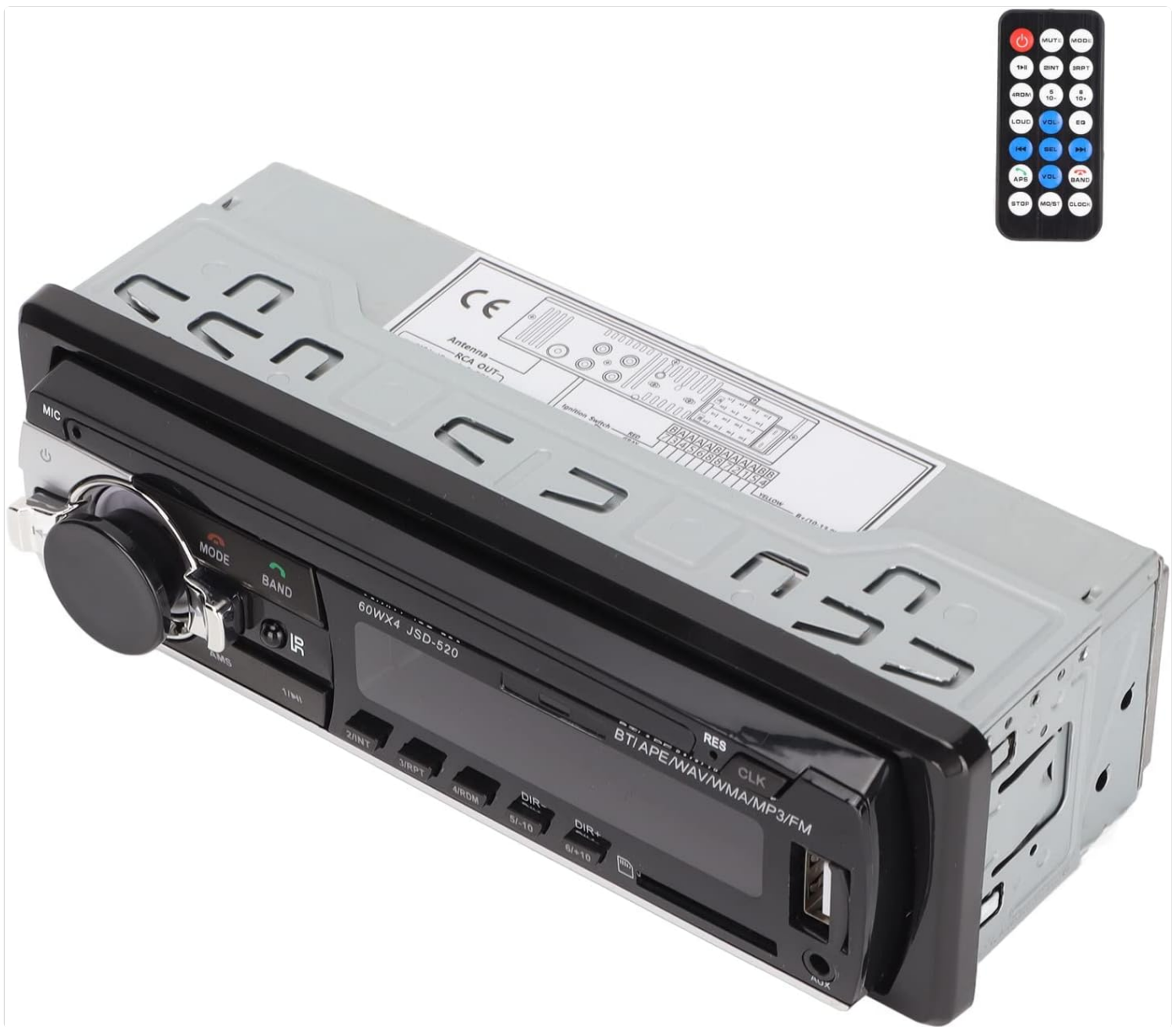
Figure 1: SUNGOOYUE QN8035 Car Radio and included remote control.