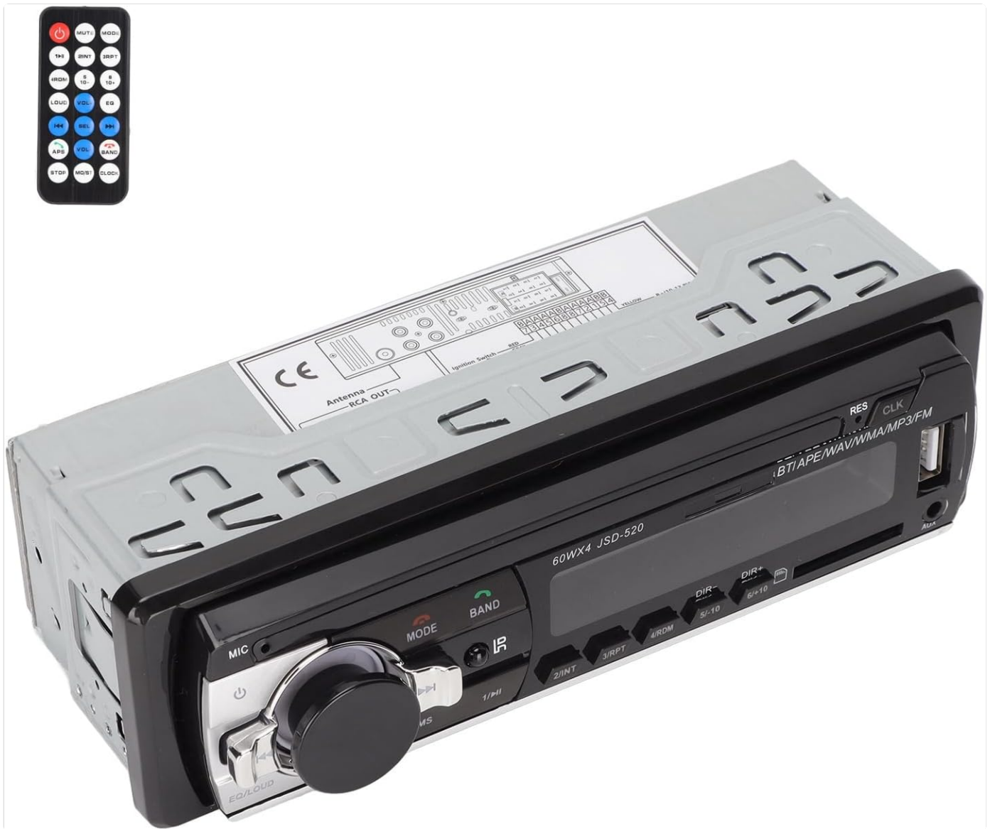
Figure 7: FM Radio Frequency Range (87.5-108.0 MHz).