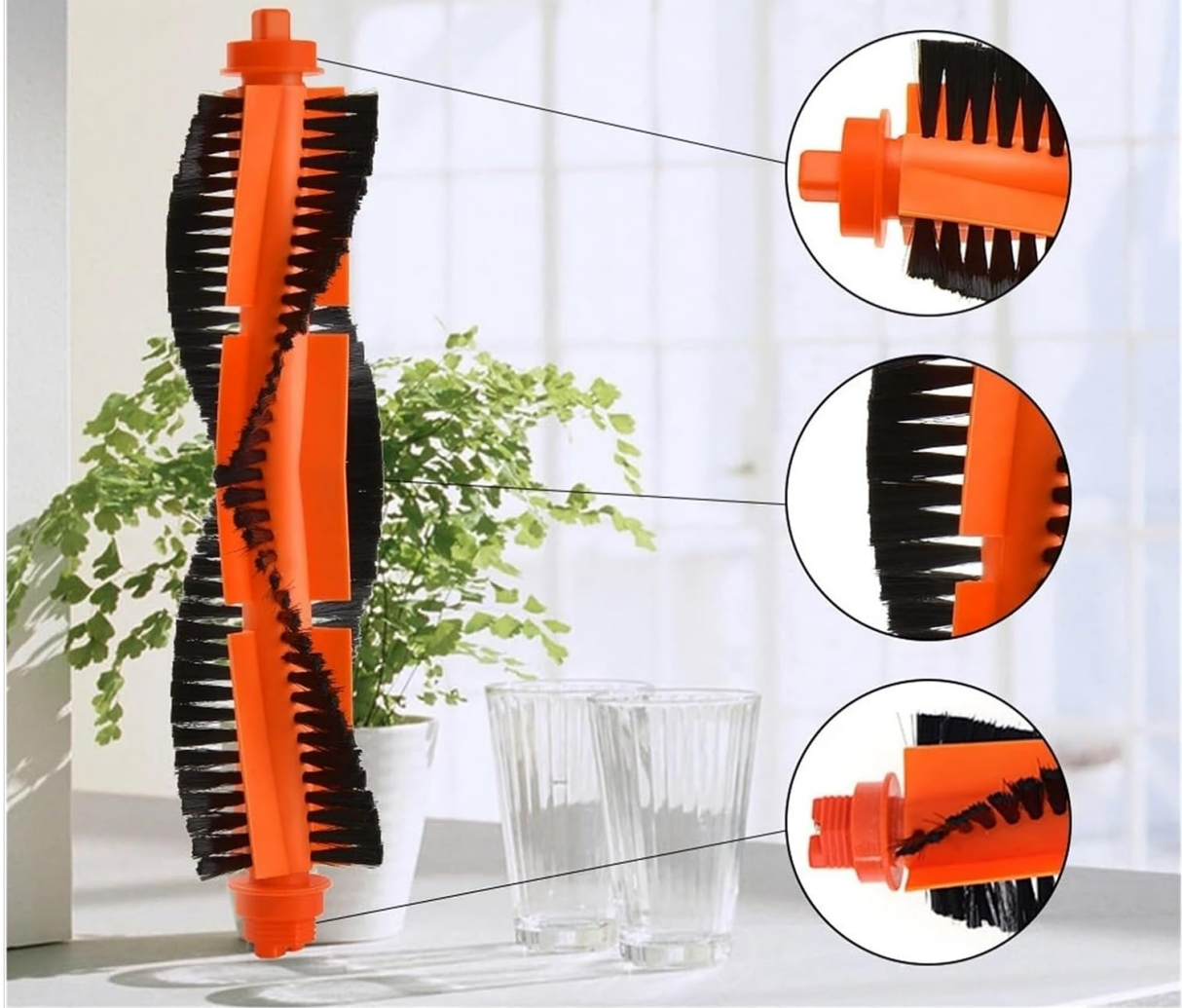
Figure 2: Detail of the main brush, showing its design for effective debris collection.