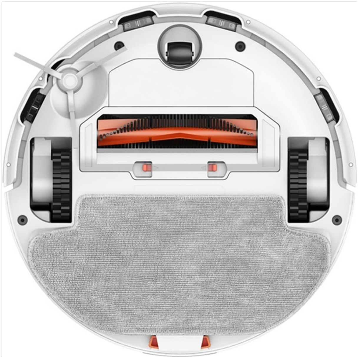
Figure 6: Bottom view of the robot vacuum with all compatible parts installed.