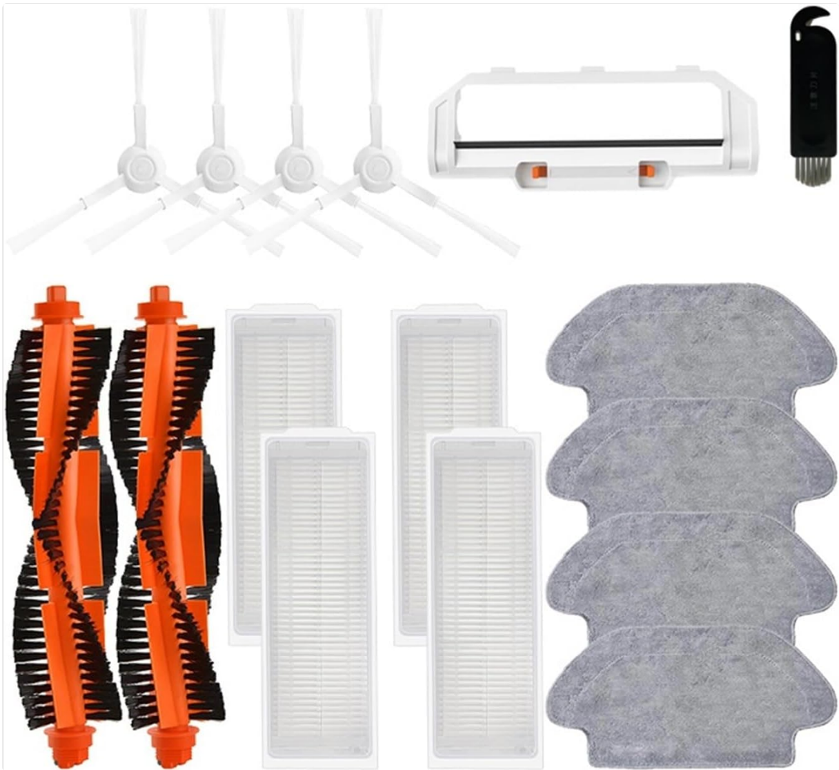
Figure 1: Complete set of McbeAn replacement parts, including main brushes, side brushes, HEPA filters, mop pads, and a cleaning tool.