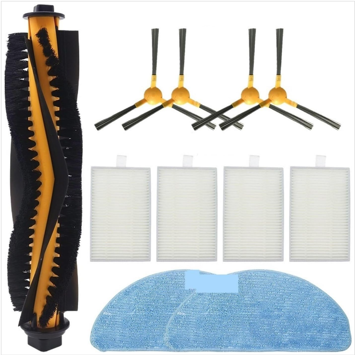
Figure 1: Overview of the McbeAn replacement parts kit, showing the main brush, side brushes, HEPA filters, and mop pads.