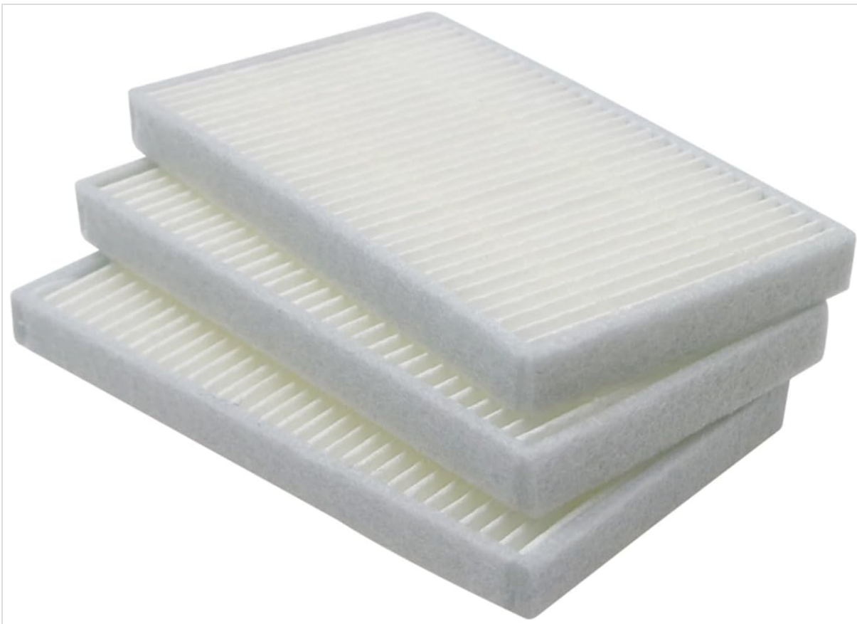
Figure 3: New HEPA filters ready for installation.