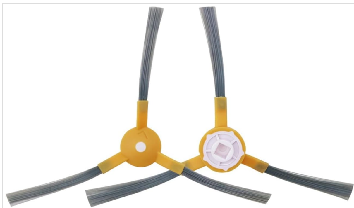
Figure 4: New three-arm side brushes.