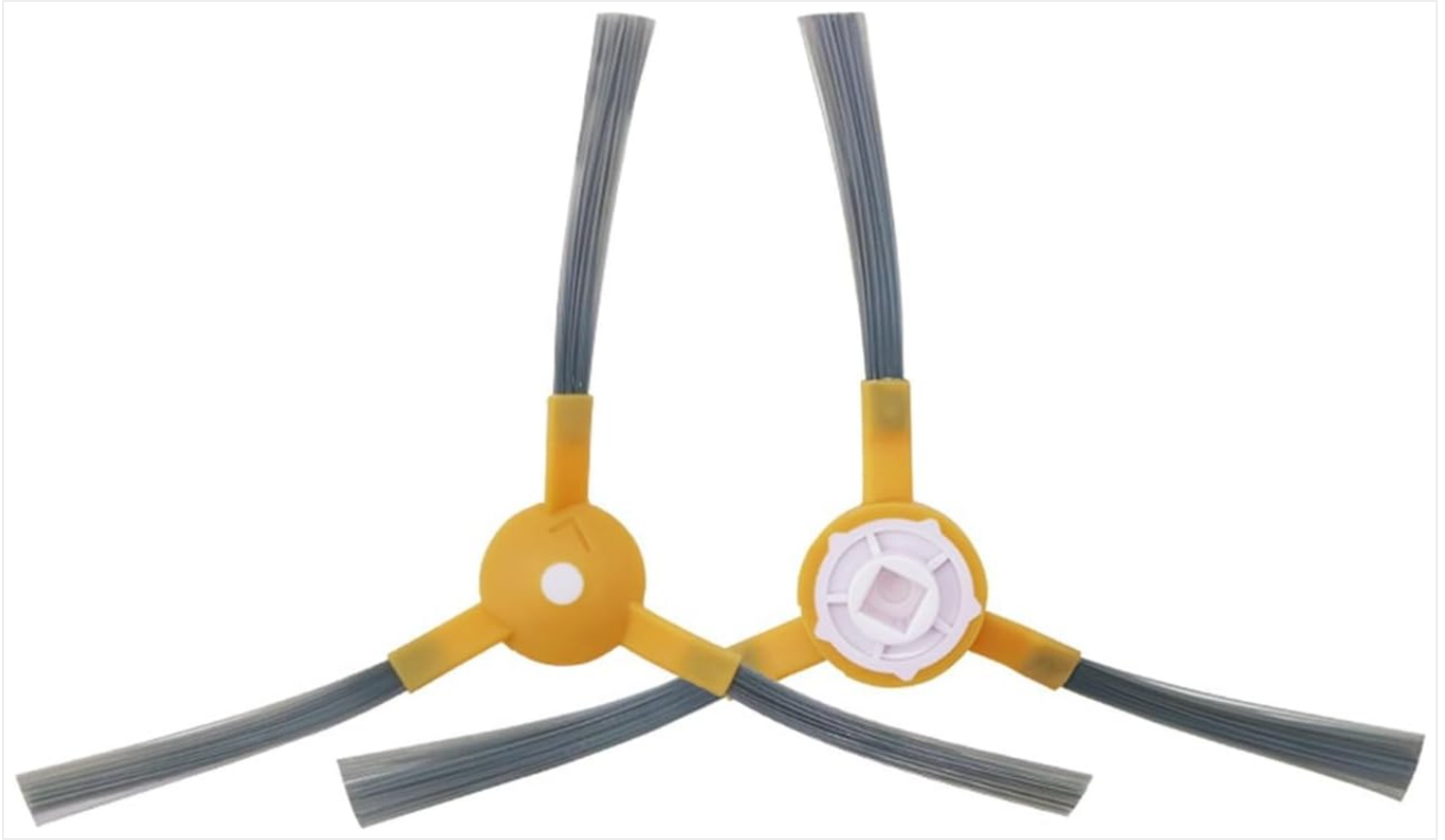
Image: A pair of new side brushes, ready for installation. Note the central screw hole for attachment.