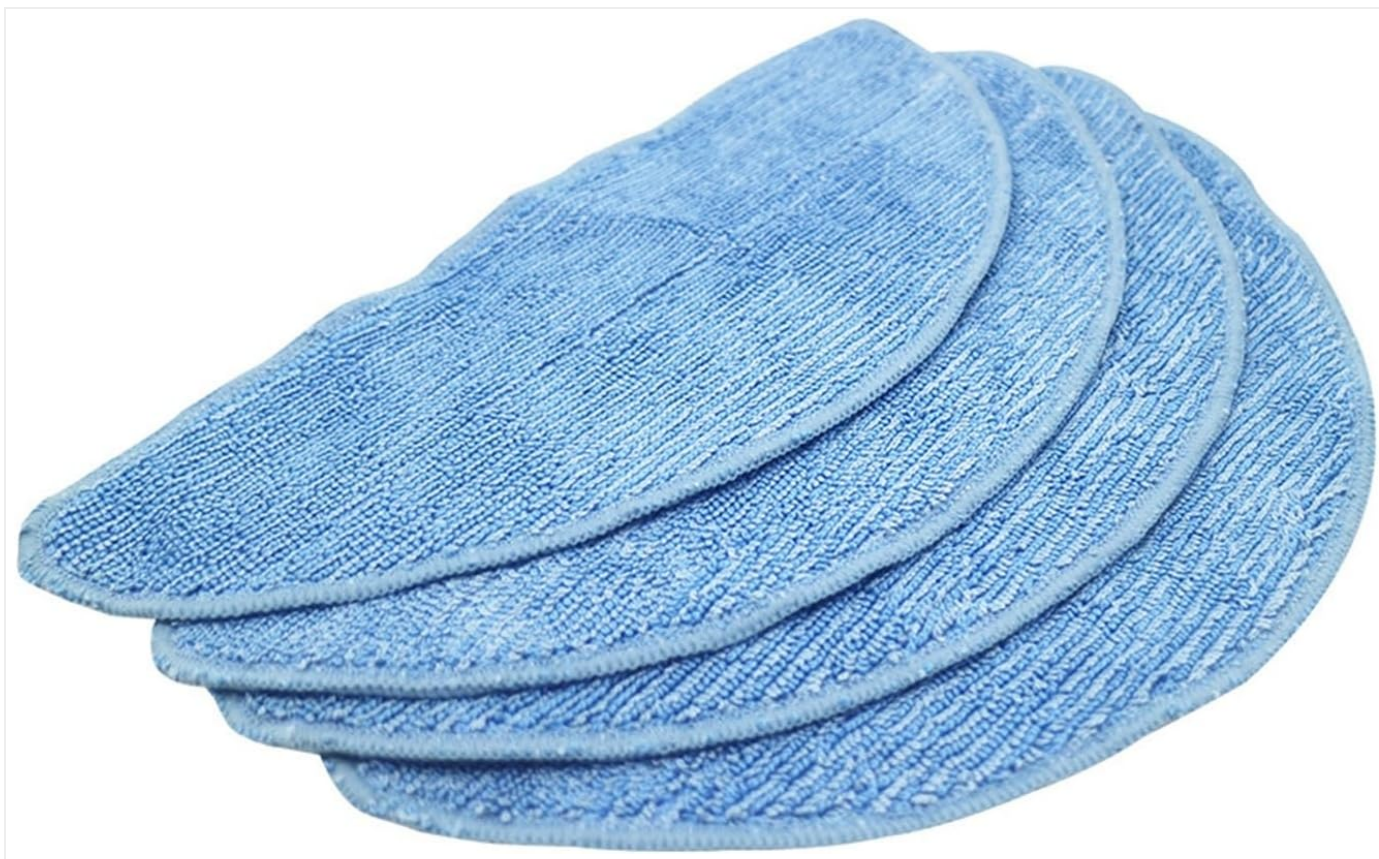
Image: A stack of four blue microfiber mop pads, designed for effective wet cleaning.