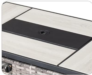
table top with lid