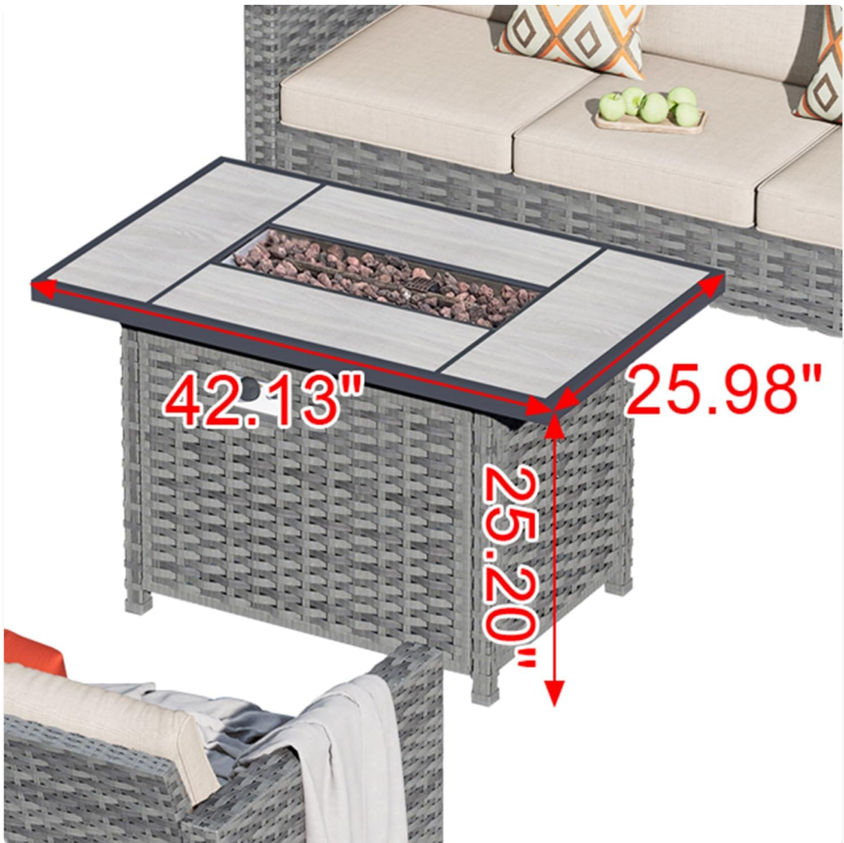
Image: A diagram illustrating the precise dimensions of the HOOOWOOO 42-inch fire table: 42.13 inches deep, 25.98 inches wide, and 25.20 inches high.