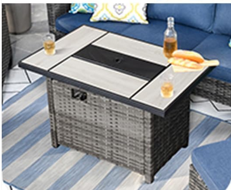
Image: The HOOOWOOO fire table shown with the flame active and with the lid covering the burner, converting it into a regular table.