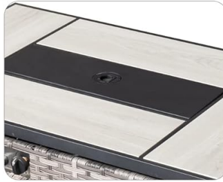
table top with lid