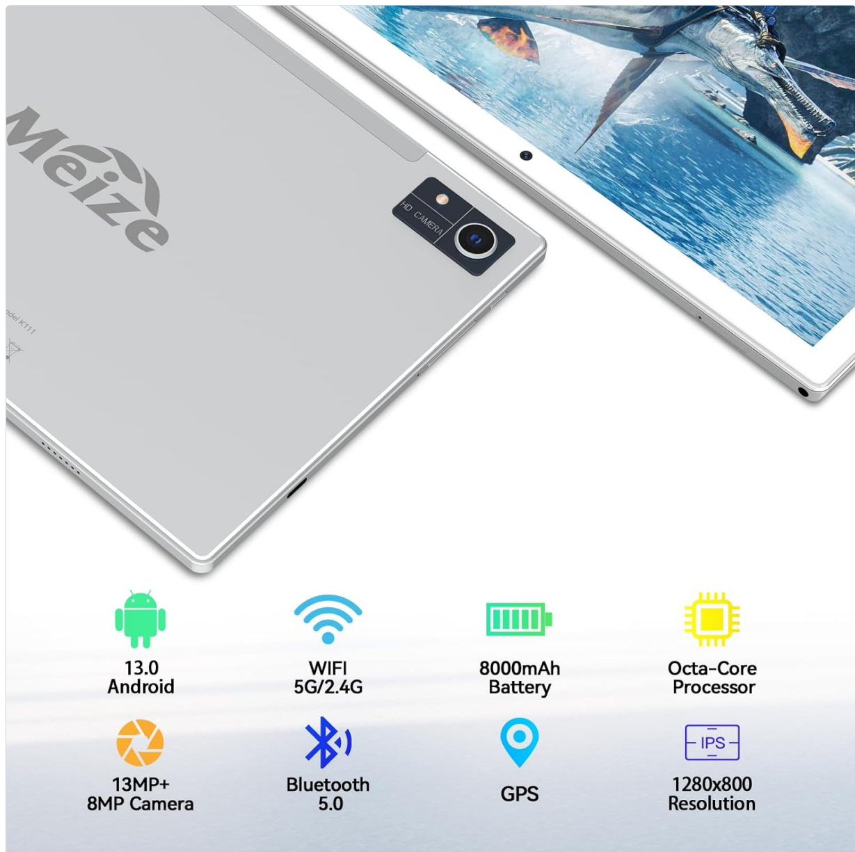
Image: An infographic highlighting the tablet's camera specifications, showing a 13MP rear camera and an 8MP front camera, alongside other key features.