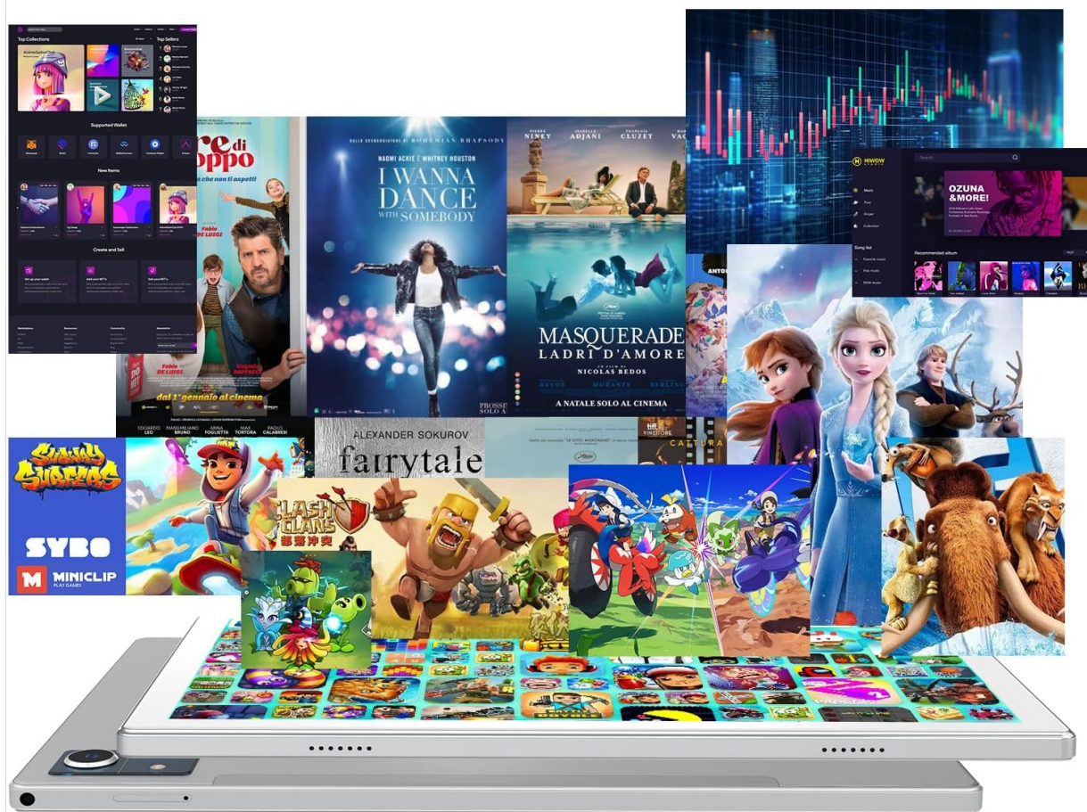
Image: The tablet screen displaying numerous application icons and media content, illustrating the ample 128GB internal storage and 16GB RAM (8GB physical + 8GB virtual) for diverse usage.