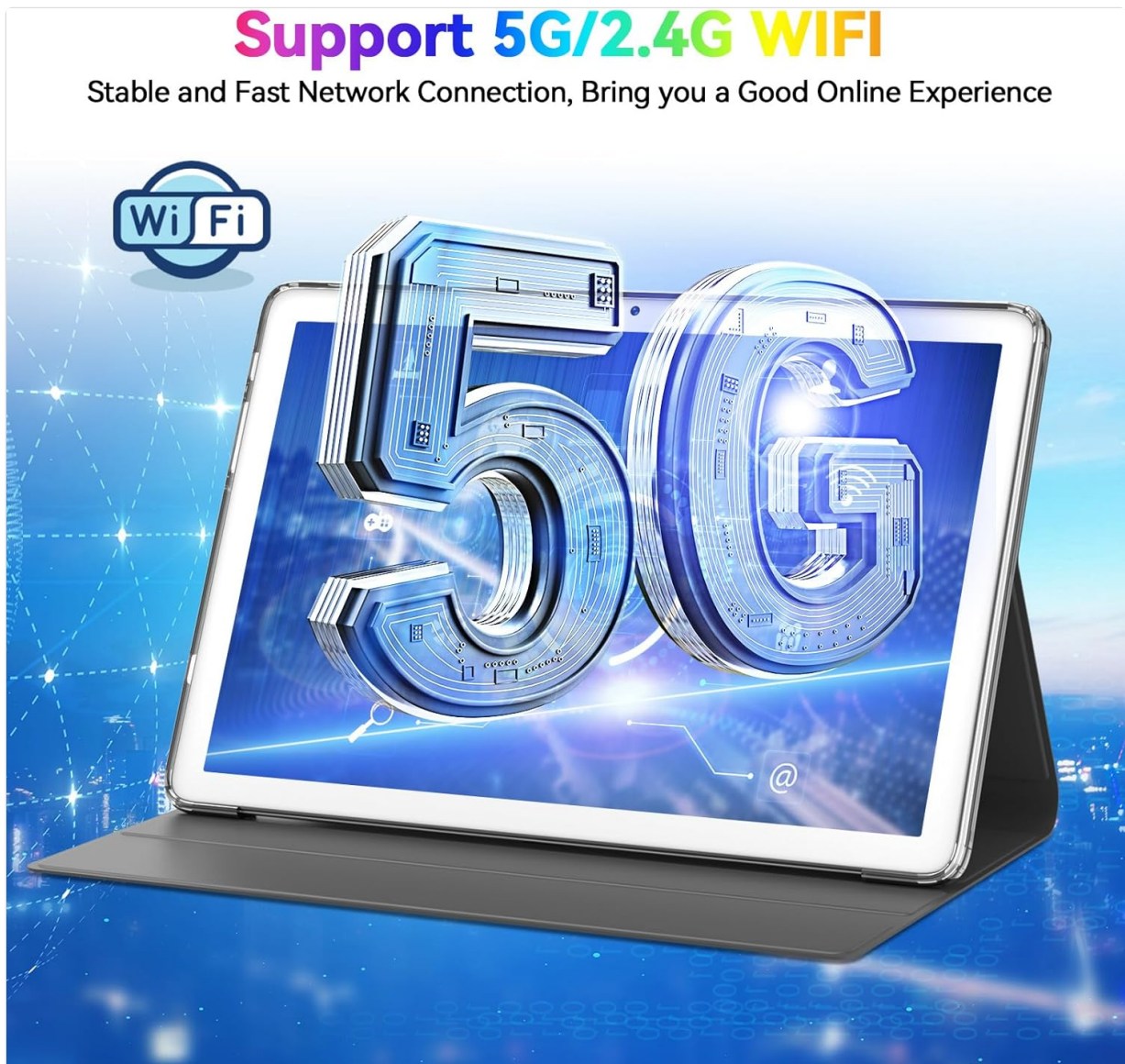
Image: The tablet screen showing a graphic indicating support for both 5G and 2.4G Wi-Fi networks, ensuring stable and fast internet connectivity.