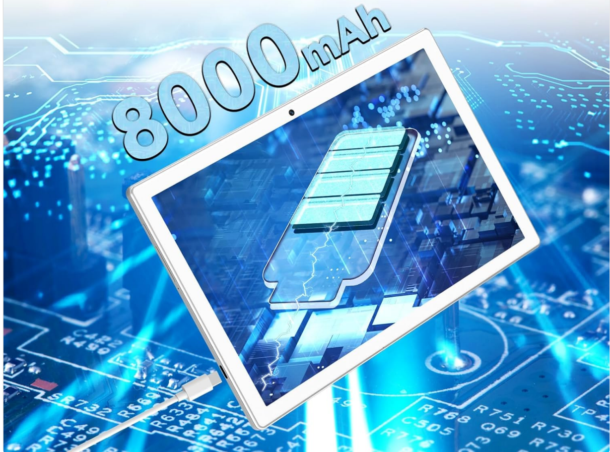
Image: A visual representation of the tablet's 8000mAh battery, indicating approximate usage durations: 10 hours for videos, 8 hours for games, and 12 hours for music playback.