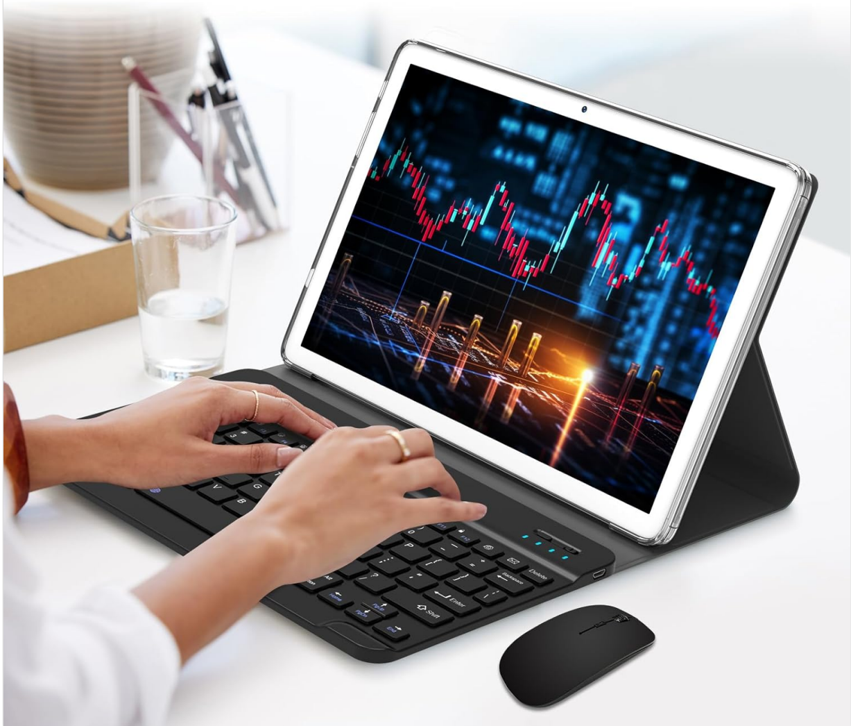
Image: A user operating the MEIZE D115A tablet with the connected Bluetooth keyboard and wireless mouse, demonstrating its capability as a portable workstation.