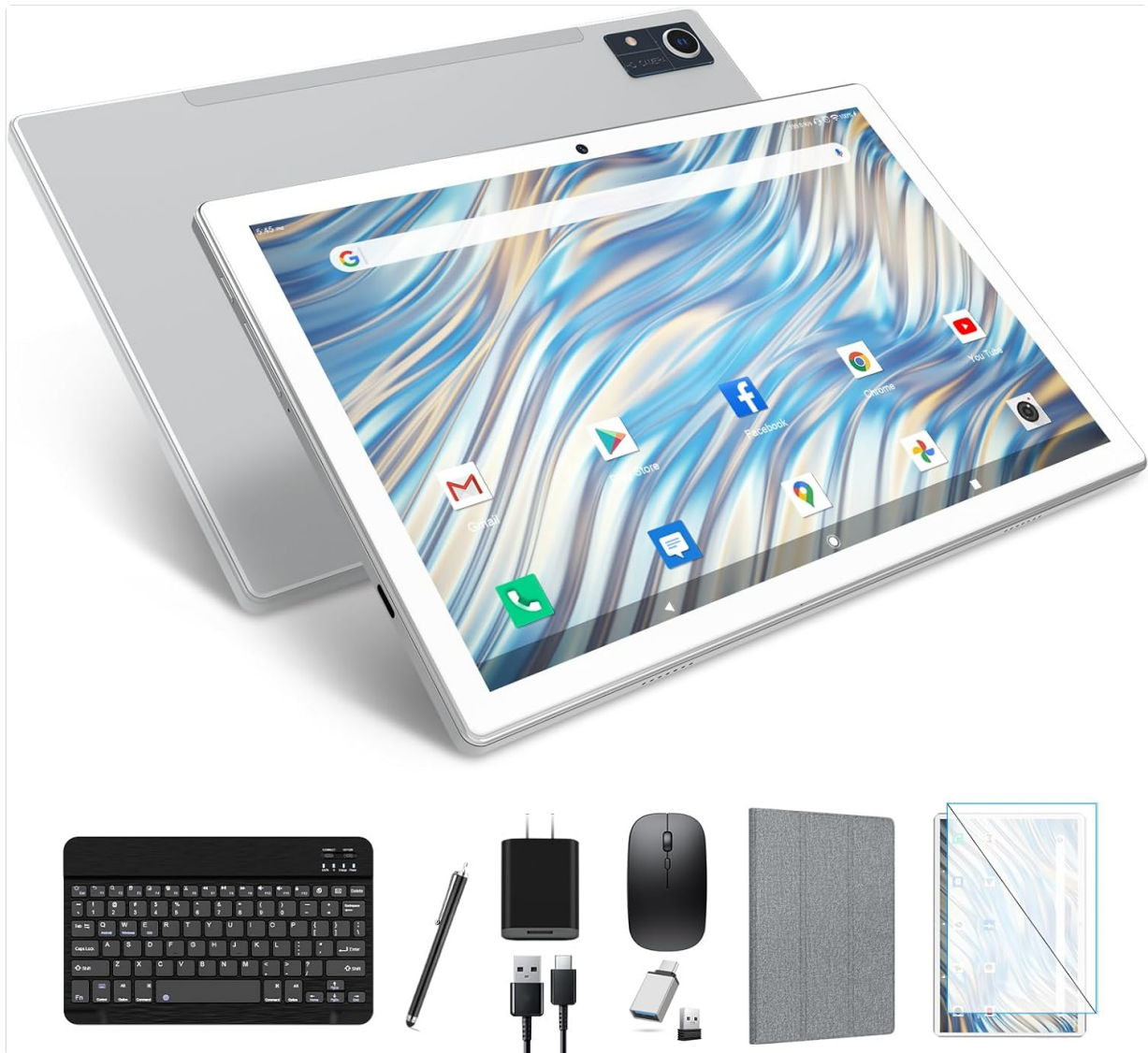
Image: The MEIZE D115A tablet displayed with its complete set of accessories, including the Bluetooth keyboard, wireless mouse, stylus, charging cable, power adapter, and protective case.