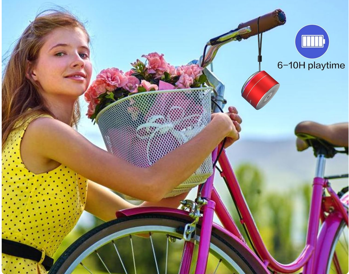
Figure 3: The speaker's portable design with a lanyard, ideal for on-the-go use like cycling, offering 6-10 hours of playtime.