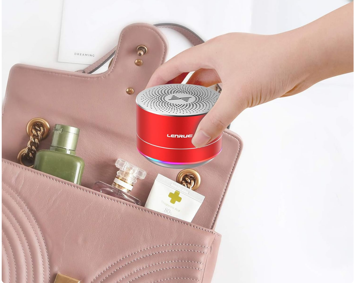
Figure 1: The LENOUE A2 speaker's compact metal design, easily fitting into a small bag.

Compact and portable, easy to be taken anywhere