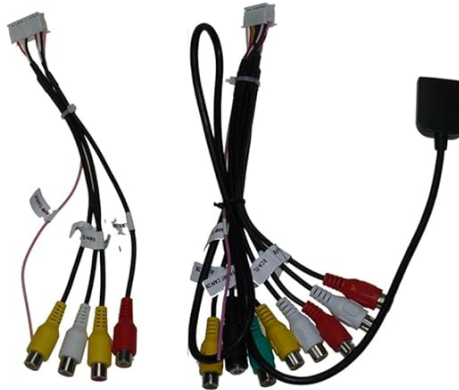
RCA Plugs & Sim Card Slot