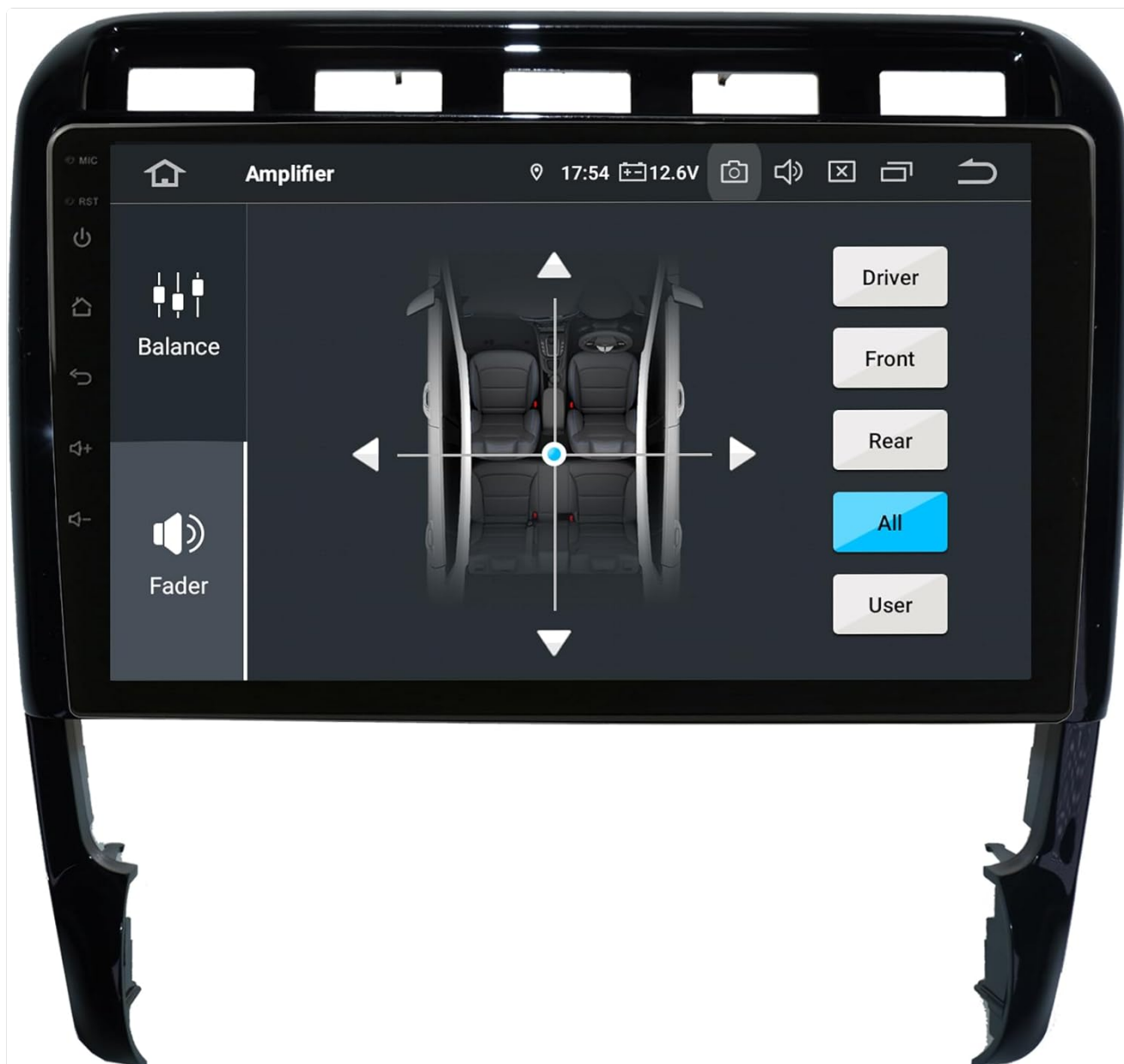
Figure 5.7: Amplifier and audio balance settings.