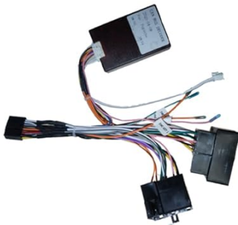
Power Cable + CAN BUS