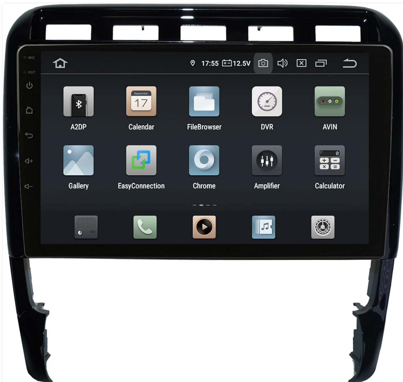
Figure 5.2: App drawer showing available applications.