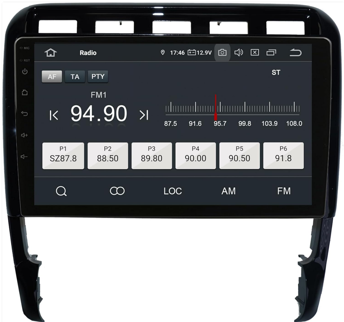
Figure 5.6: Radio tuner interface.

Scanning: Use the scan function to find available stations. Save your favorite stations to presets.