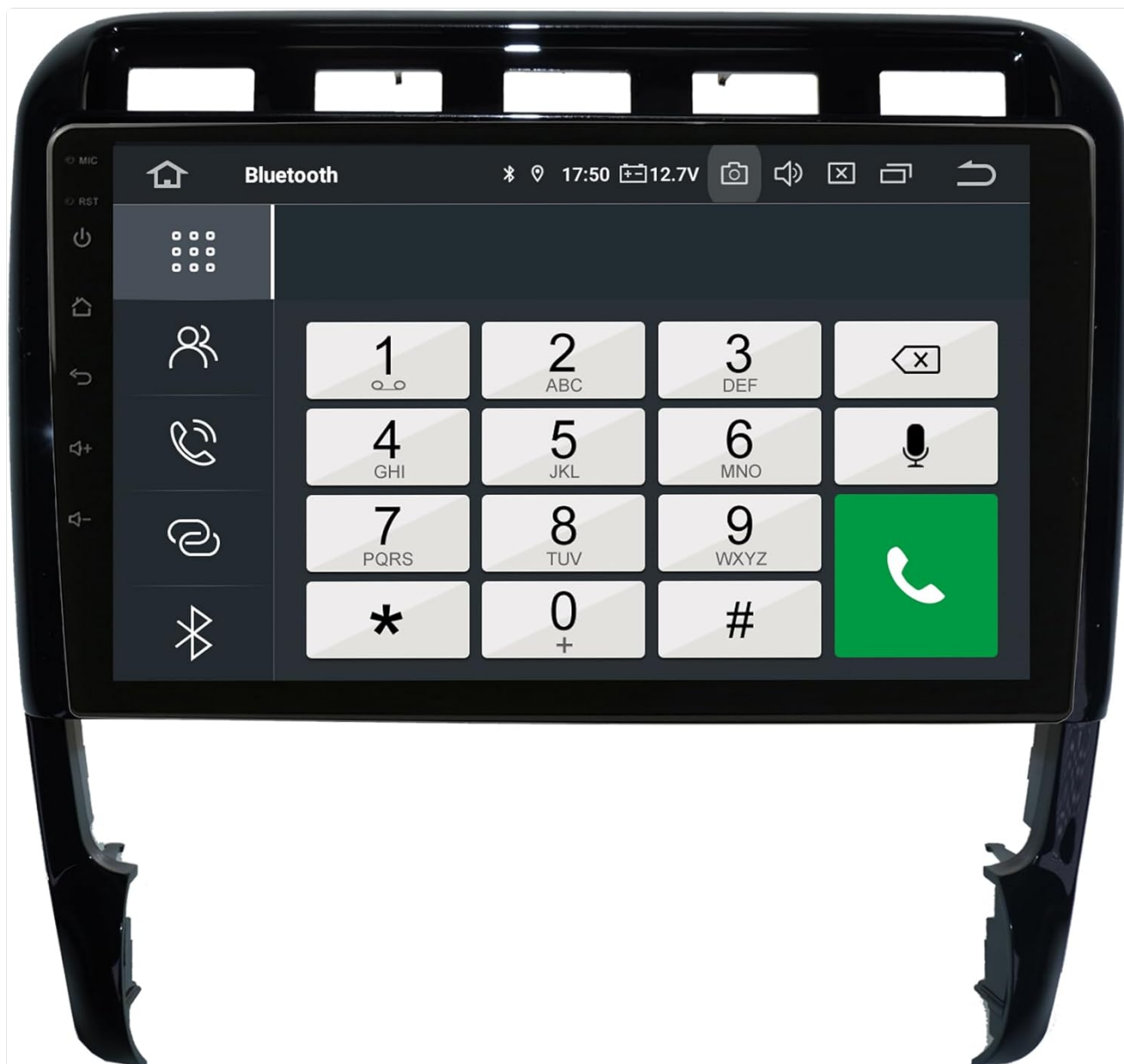
Figure 5.5: Bluetooth phone dialer interface.

Pairing: Go to Bluetooth settings on the head unit and your phone. Search for available devices and select the head unit. Confirm the pairing code.