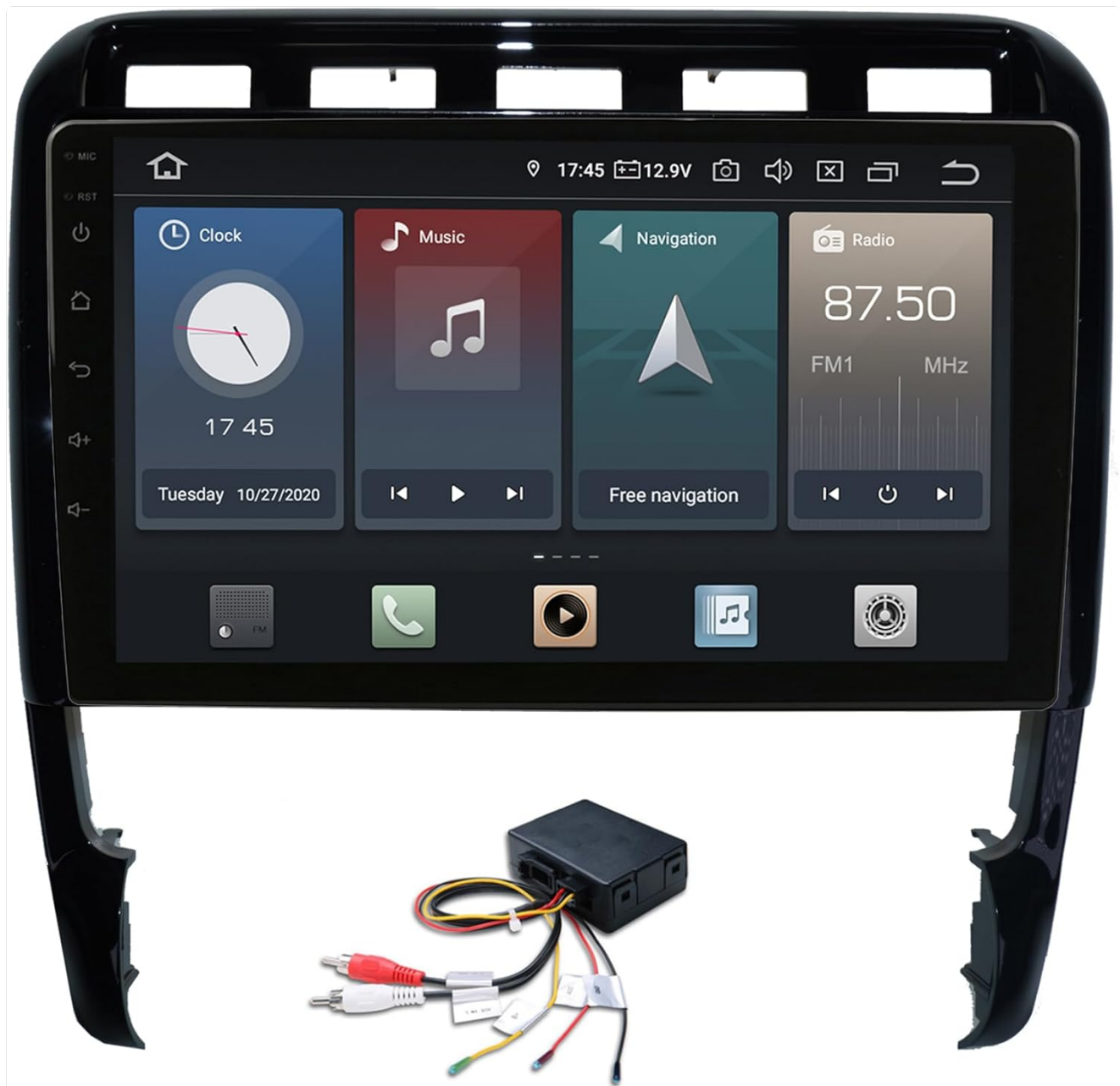
Figure 5.1: Main user interface with shortcuts to essential applications.