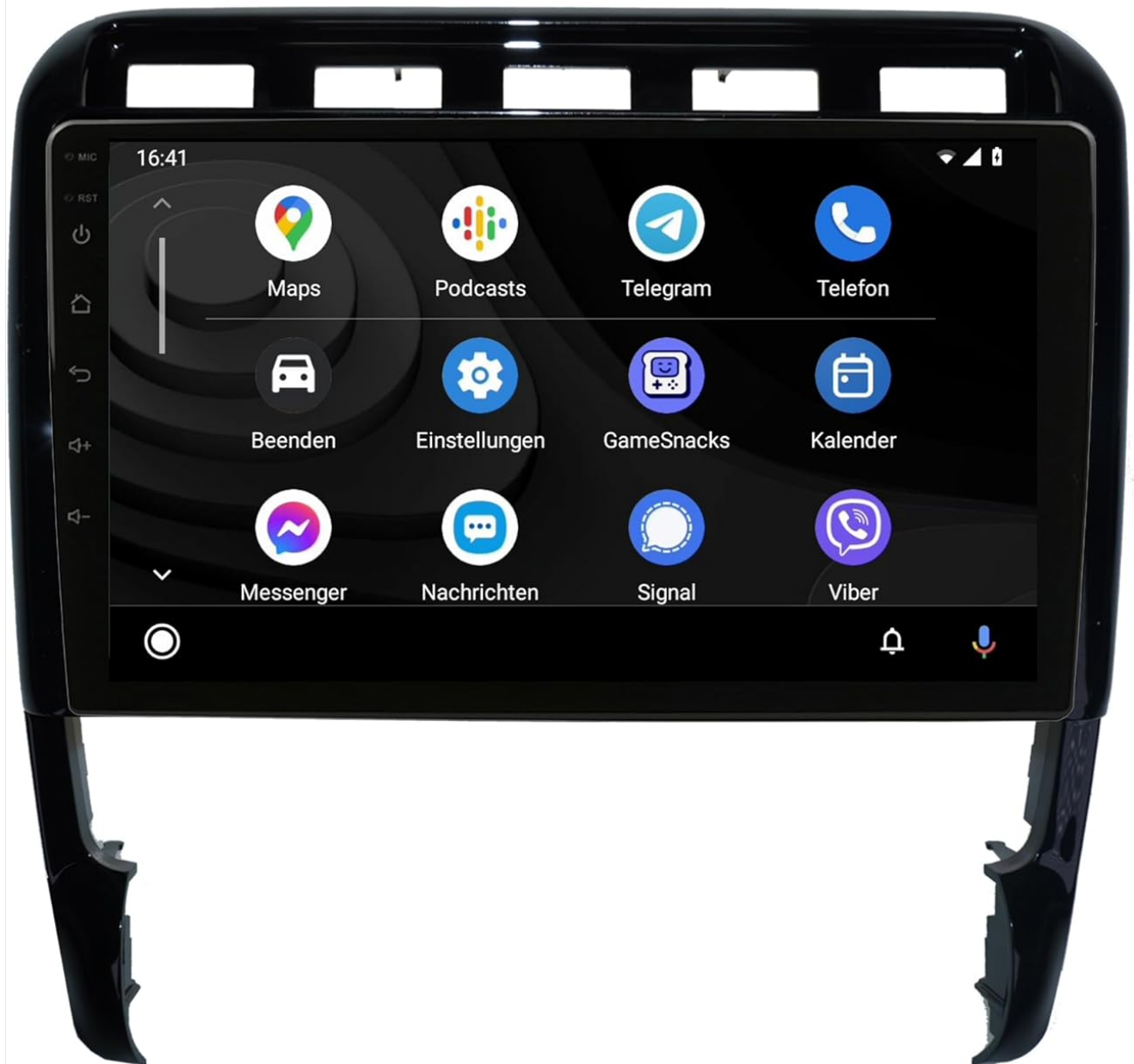
Figure 5.4: Android Auto interface.

To activate: Connect your smartphone via Bluetooth or USB. Follow the on-screen prompts to enable CarPlay or Android Auto.