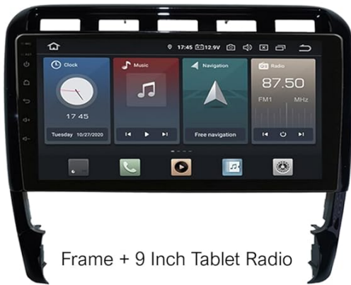
Frame + 9 Inch Tablet Radio