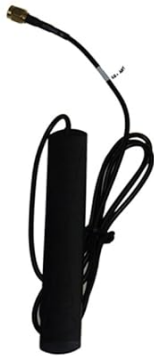
4G - Antenna