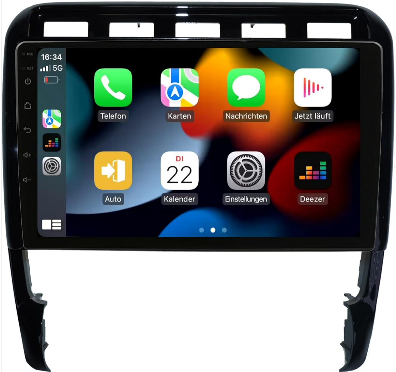
Figure 5.3: Wireless CarPlay interface.