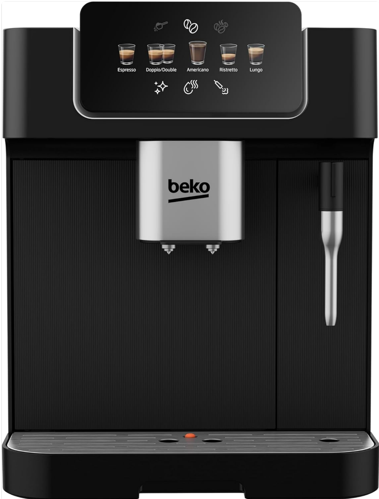
Figure 3.1: Front view of the Beko CEG 7302 B Espresso Coffee Maker Machine, showcasing the control panel, coffee

Familiarize yourself with the parts of your Beko CEG 7302 B Espresso Coffee Maker Machine.