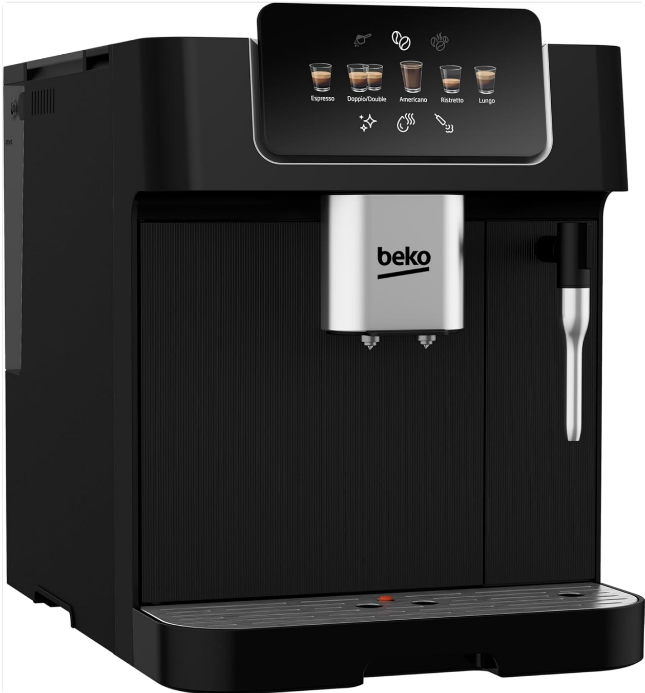
Figure 3.2: Angled view of the Beko CEG 7302 B, highlighting its sleek black design and compact form factor.