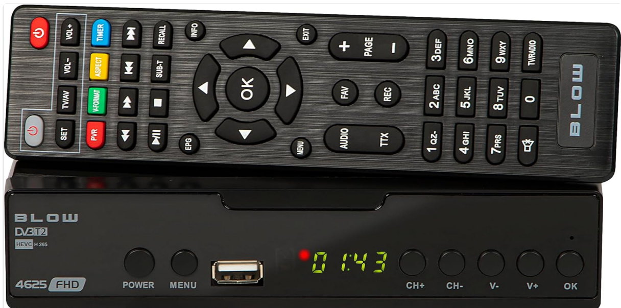
Image 4.1: Front view of the BLOW 4625FHD DVB-T2 Tuner with its remote control.