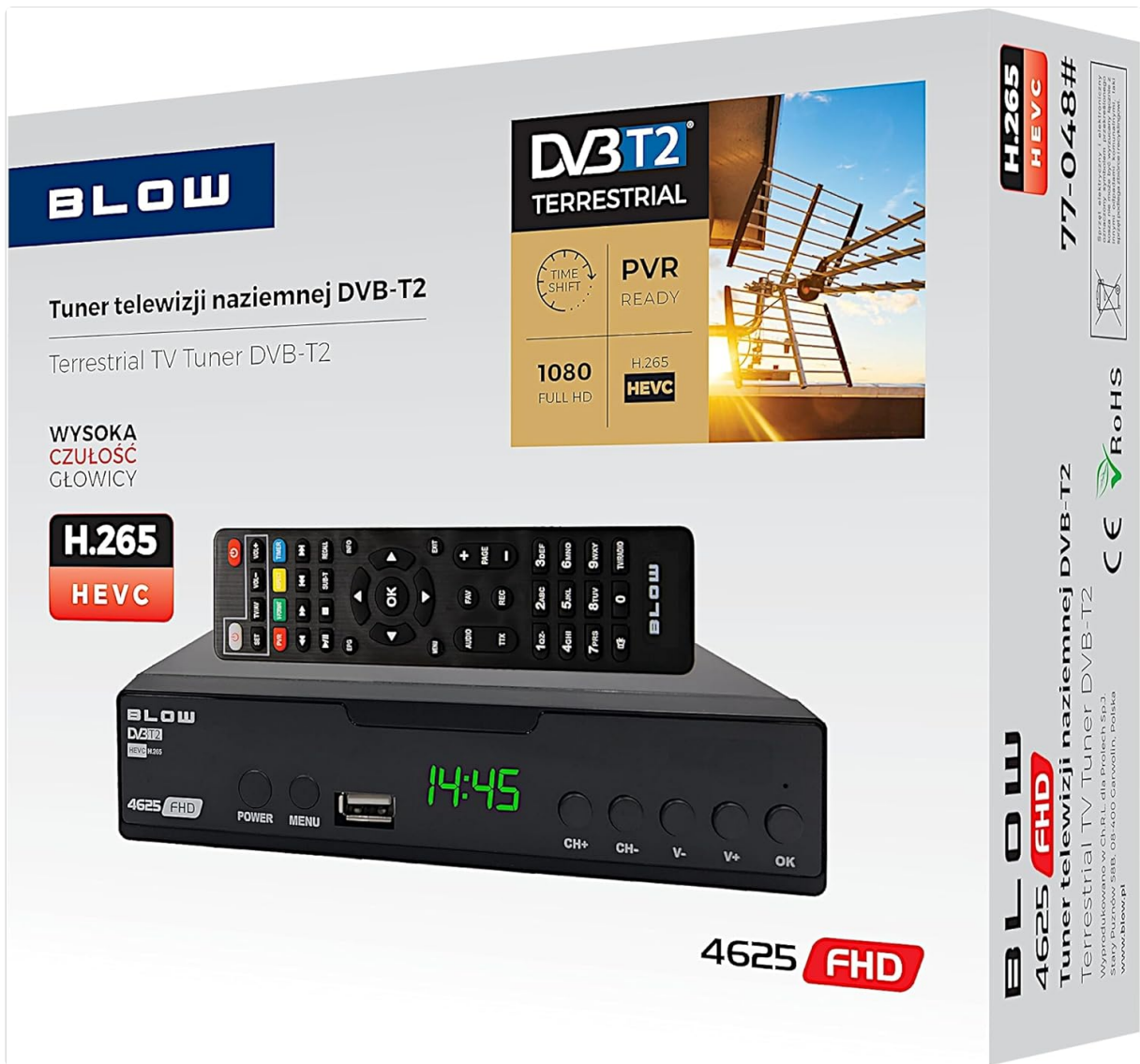
Image 3.1: Retail packaging of the BLOW 4625FHD DVB-T2 Tuner, showing the tuner unit and remote control.