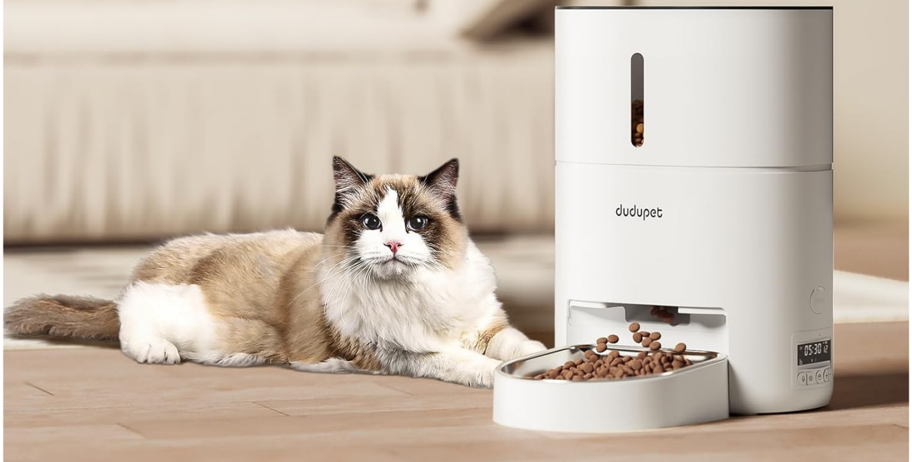
Image: An automatic pet feeder positioned next to a cat, illustrating the feeder's capabilities: 1-6 meals per day, 1-20 portions per meal, and a portion size of approximately 7\pm 2g , suitable for 4L (approx. 2KG) of food.