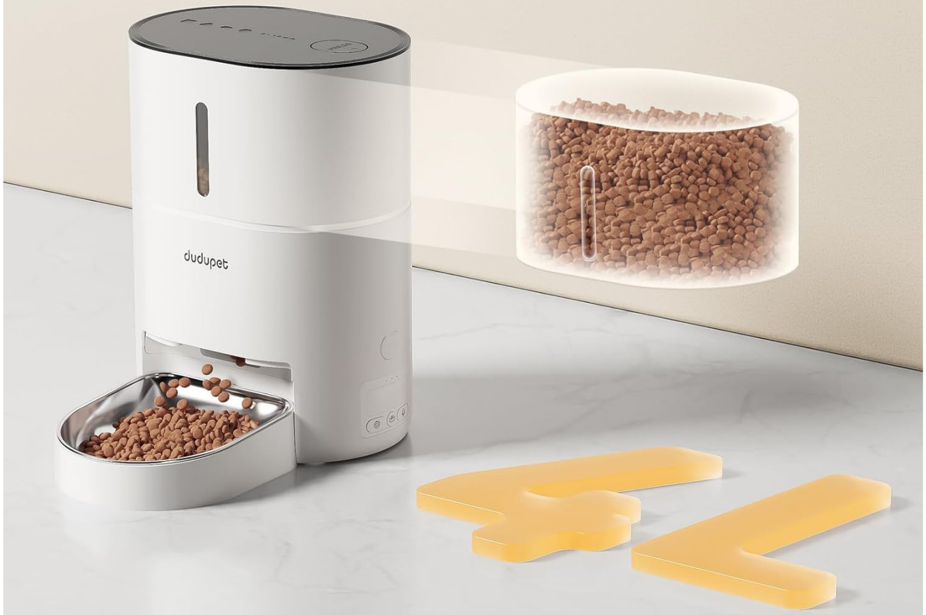
Image: A visual representation of the feeder's 4L large capacity, showing the internal food storage filled with kibble. Text indicates it is suitable for cats and small dogs, and recommends dry pet food with a diameter of 3-10mm.