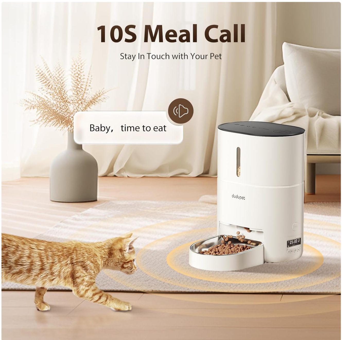
Image: The pet feeder with a cat approaching it, illustrating the 10-second voice recording feature. A speech bubble indicates a voice message, such as "Baby, time to eat," playing to call the pet for its meal.