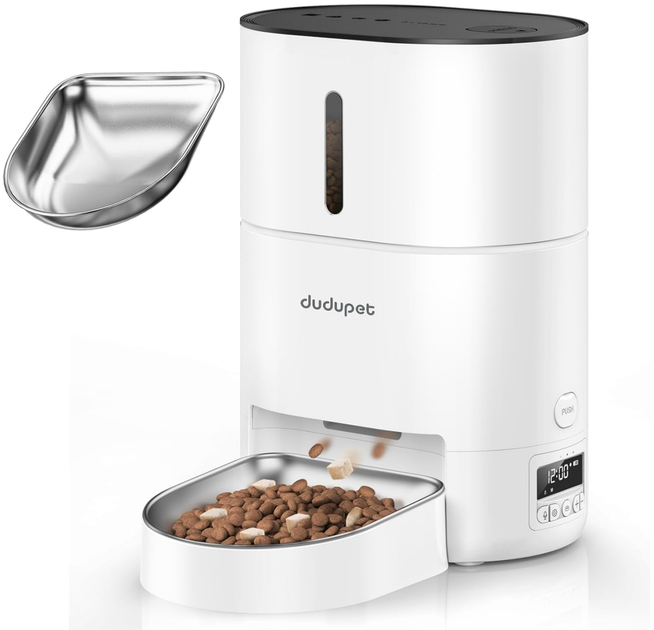
Image: The DUDUPET 4L Automatic Pet Feeder, showcasing its sleek white design, the main unit with a visible food reservoir, and a stainless steel feeding bowl filled with kibble. A separate, empty stainless steel bowl is also shown, indicating it's a removable component.