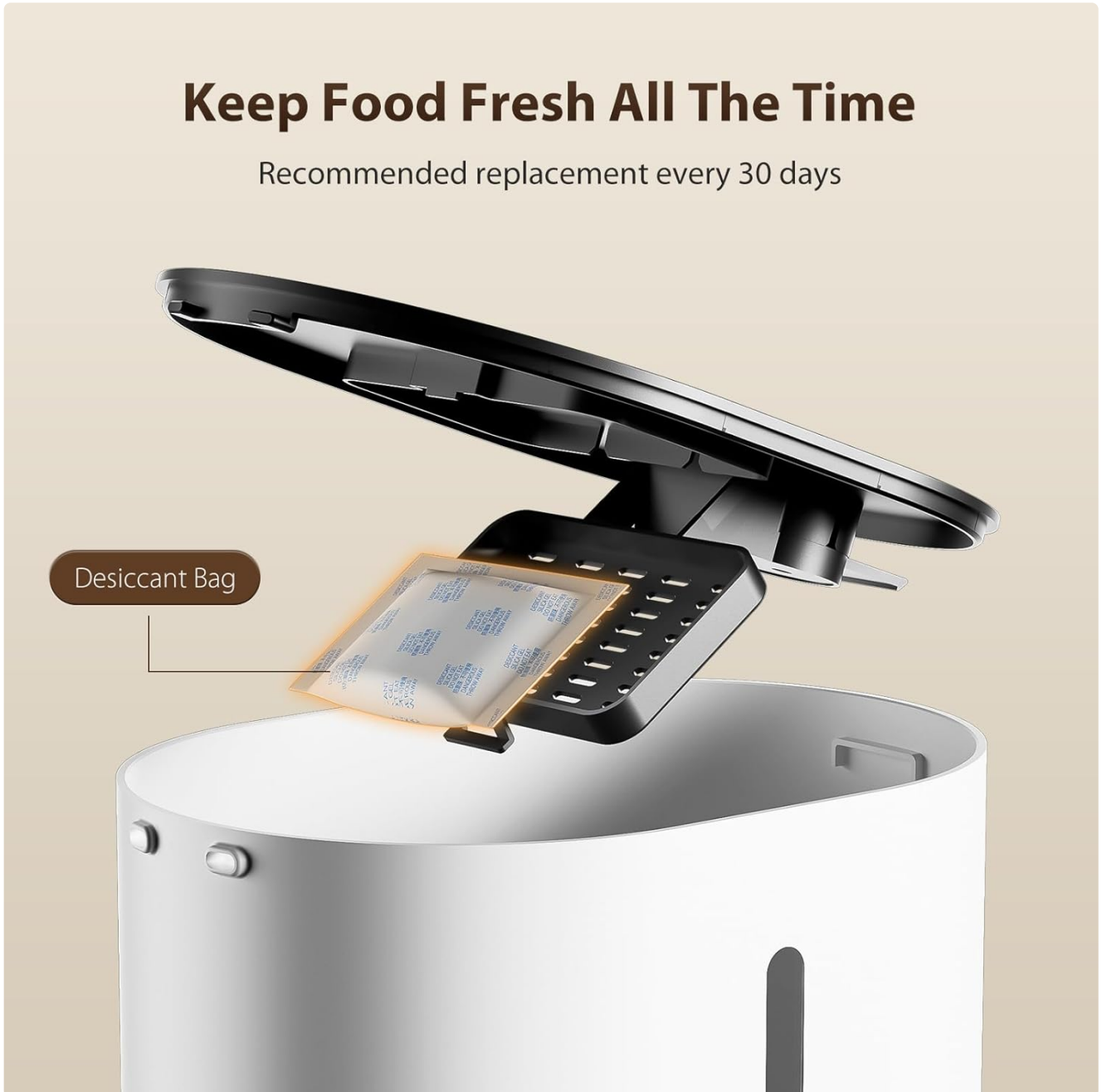
Image: A close-up view of the feeder's lid, showing the compartment where the desiccant bag is placed to maintain food freshness. The desiccant bag is highlighted with text indicating its purpose and recommended replacement frequency.