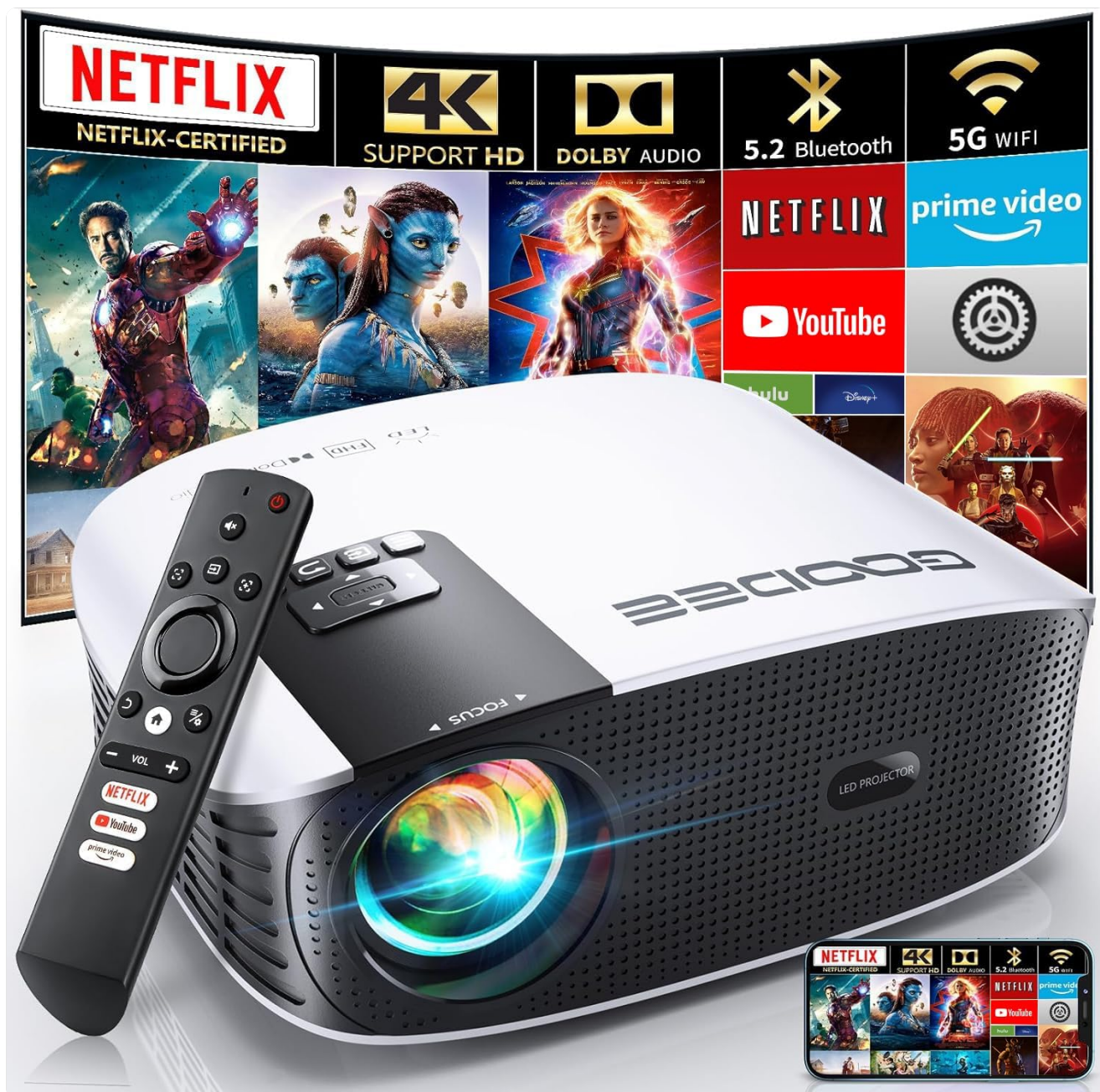
The GooDee Smart 4K Projector and its included remote control. The projector features a sleek white and black design with a prominent lens and control panel.