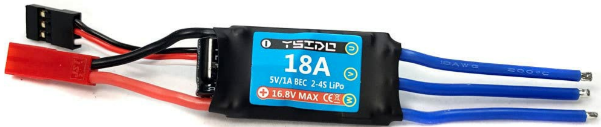
Image 3: Close-up view of the 18A Electronic Speed Controller (ESC), showing its specifications label.