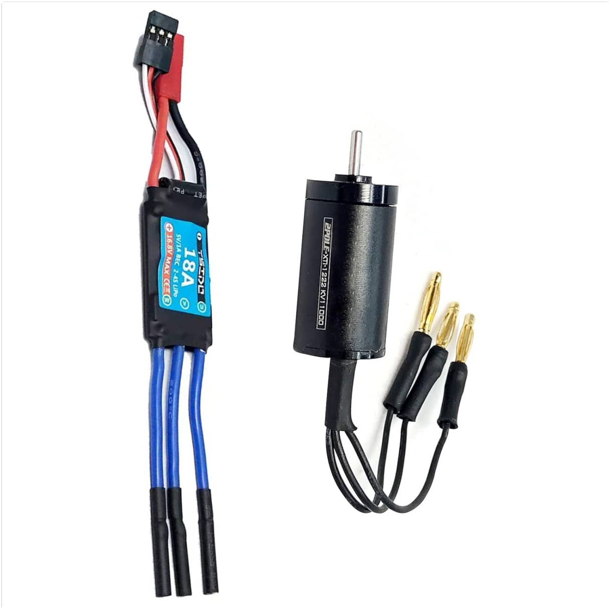
Image 1: The ZEZEUFU 18A ESC and 11000KV Brushless Motor included in the package. The ESC is on the left with blue wires, and the motor is on the right with gold bullet connectors.