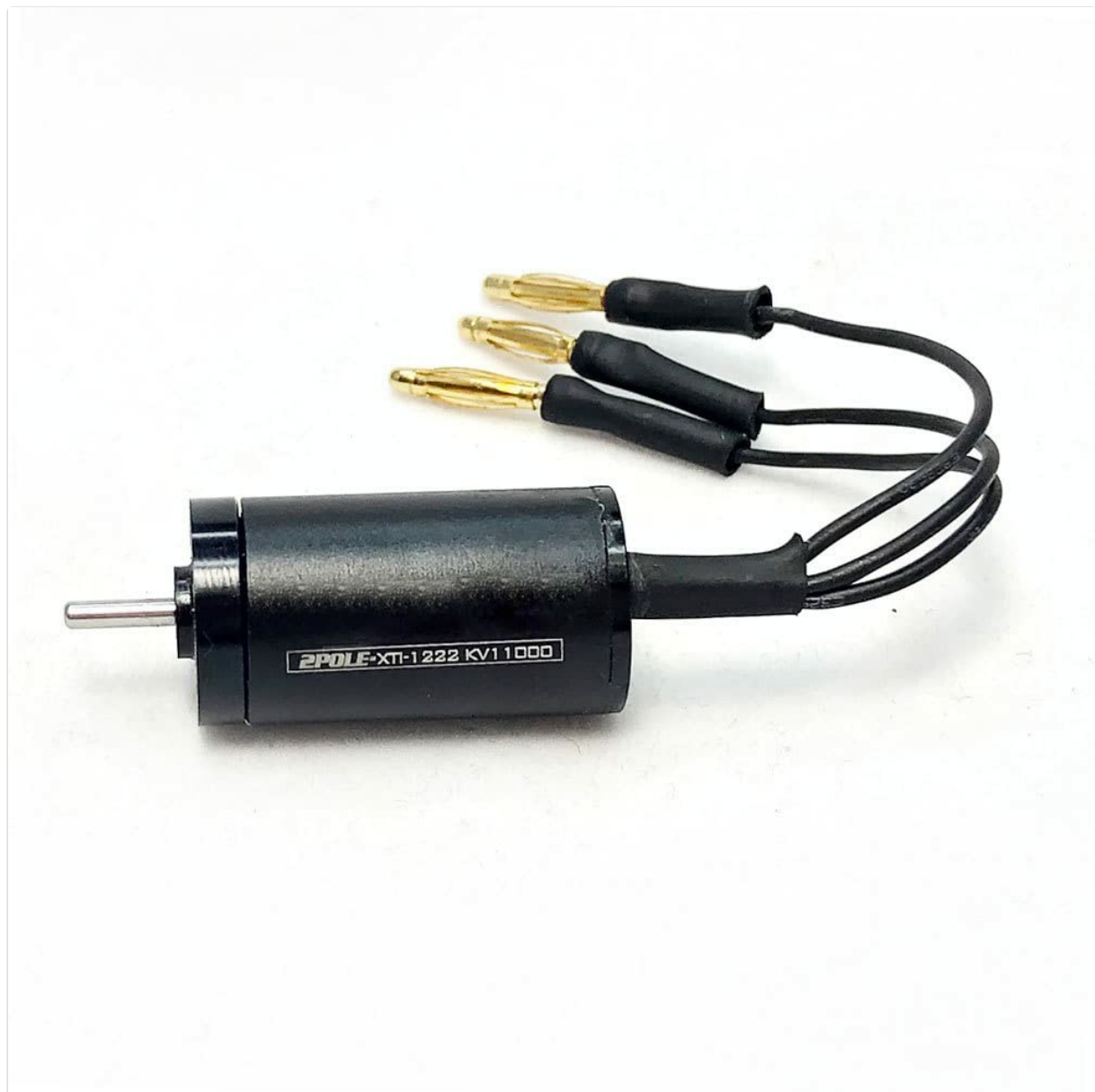
Image 2: Close-up view of the 11000KV Brushless Motor, showing the shaft and gold bullet connectors.