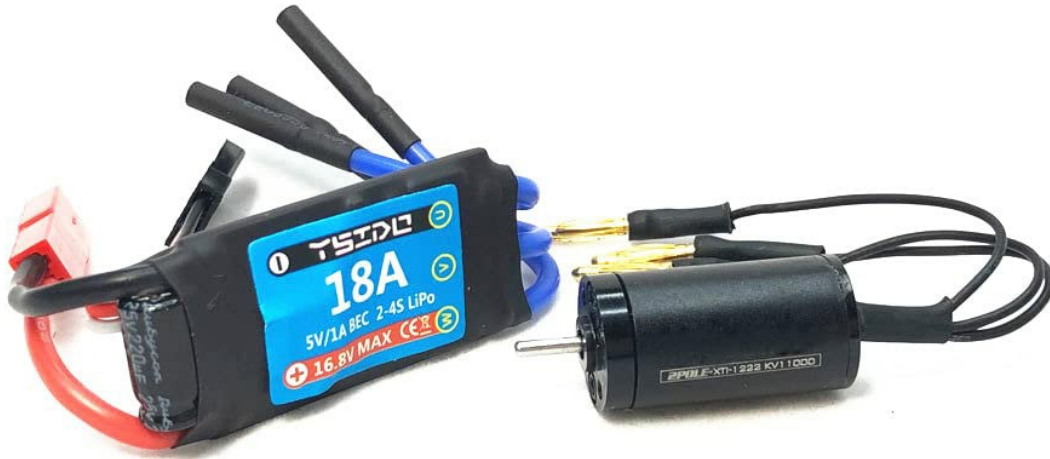
Image 5: The 18A ESC and 11000KV Brushless Motor connected, ready for installation into an RC vehicle.