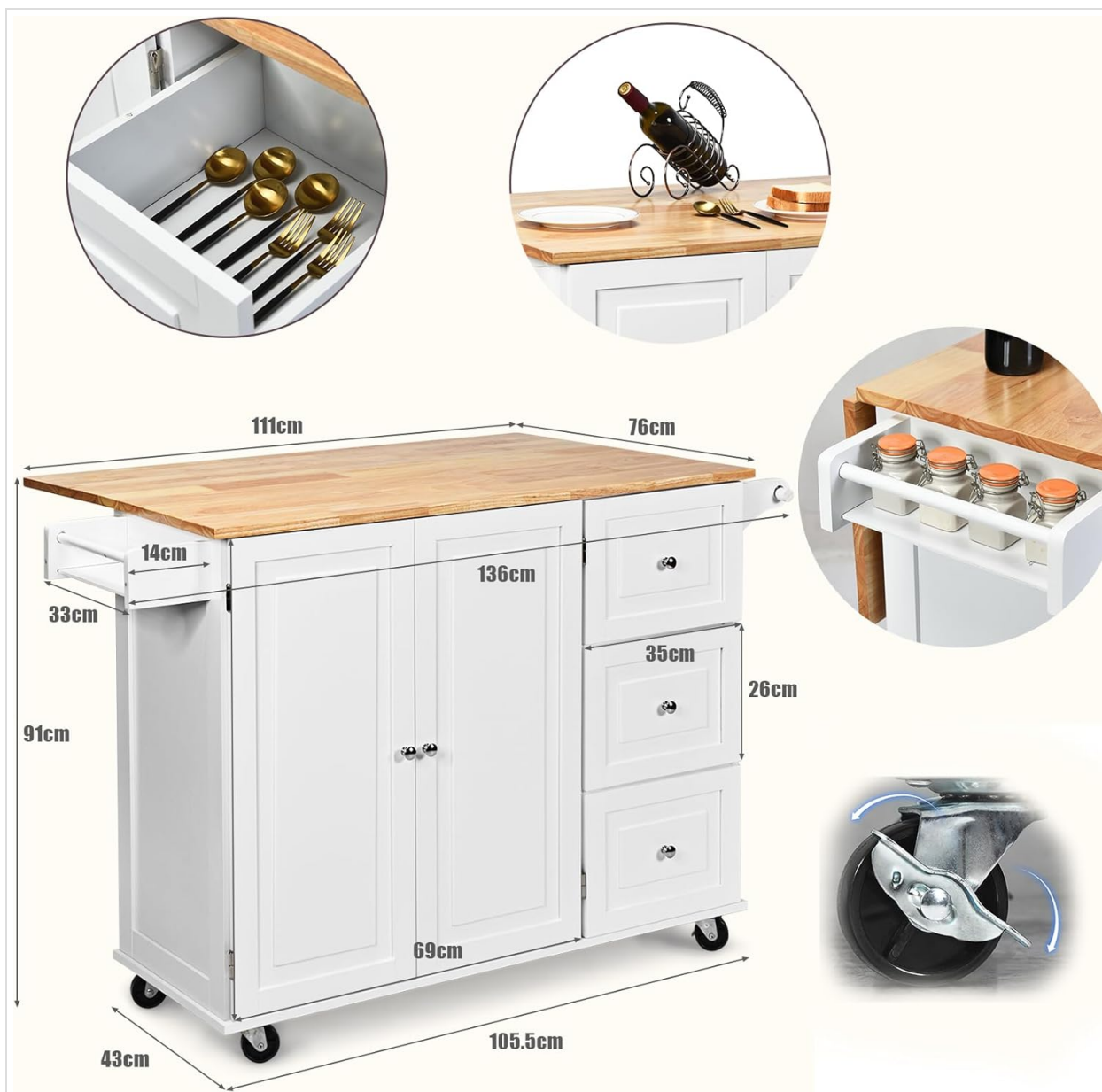
Image 8.1: A comprehensive diagram illustrating the key dimensions of the kitchen trolley, providing precise measurements for various components to aid in planning and placement.