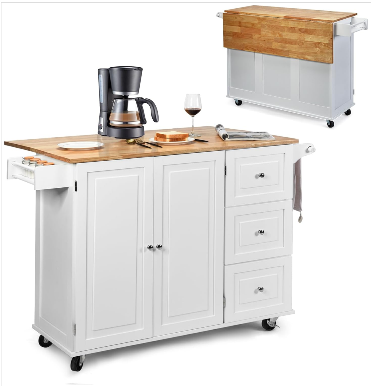
Image 4.1: The fully assembled KOMFOTTEU Kitchen Trolley, showcasing its design and functionality with a coffee maker and other items on its surface. The folding panel is visible in its compact state in the background.