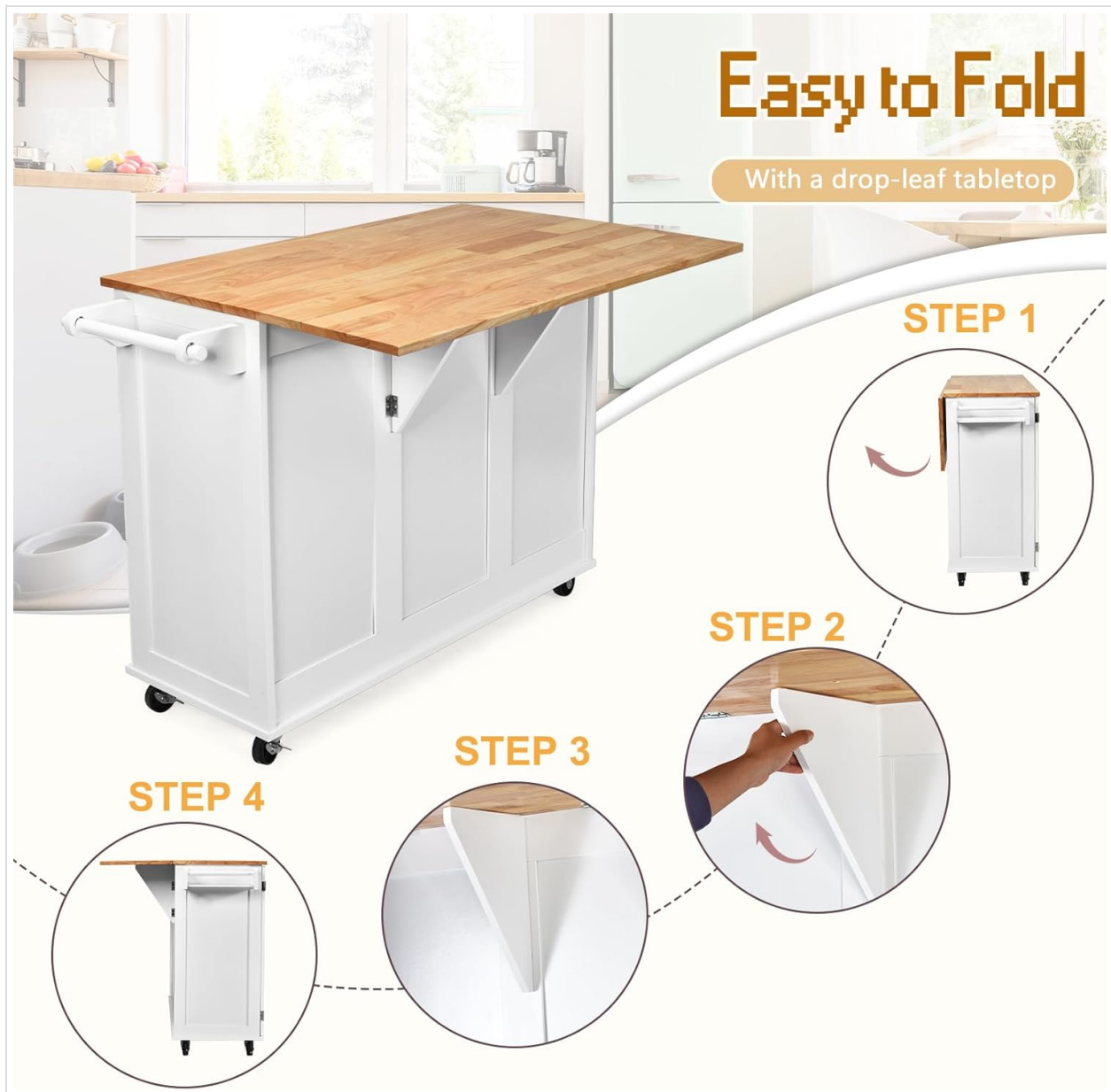
Image 5.1: A visual guide demonstrating the four simple steps to operate the drop-leaf tabletop, allowing for easy expansion and retraction of the work surface.

The kitchen trolley features a versatile folding panel that can be extended to create additional workspace or dining area. To extend the panel, gently lift it and secure it with the support brackets underneath. To fold it back, release the supports and carefully lower the panel.