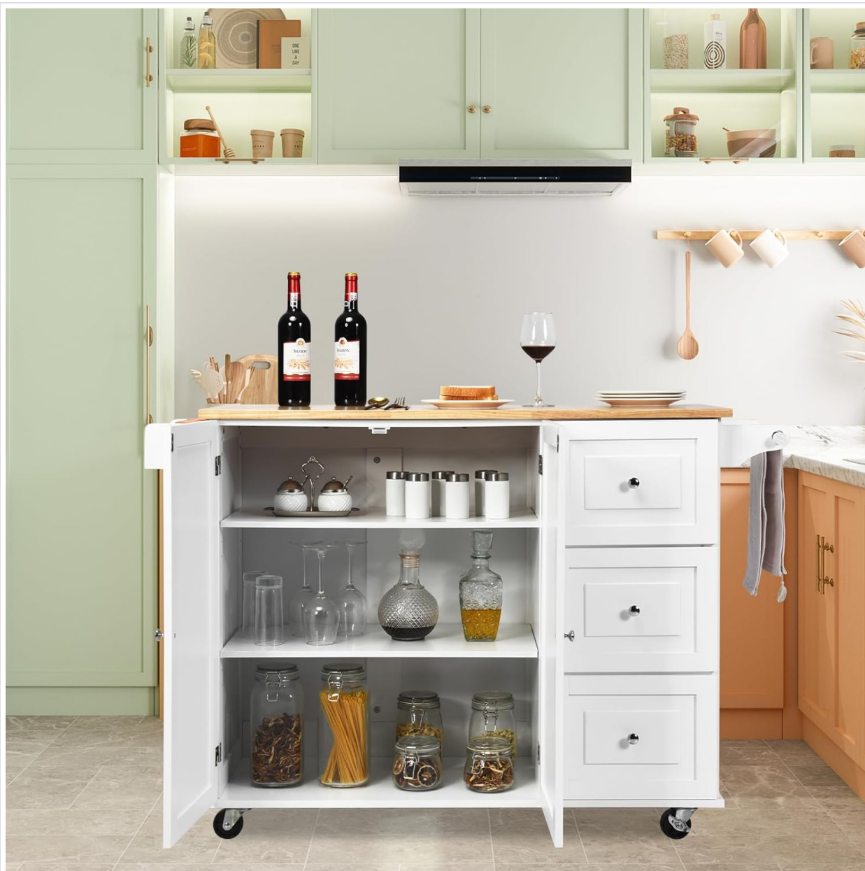
Image 5.3: The interior of the kitchen trolley's cabinets, showing the adjustable shelves configured to store various kitchen essentials like glassware, bottles, and dry goods.