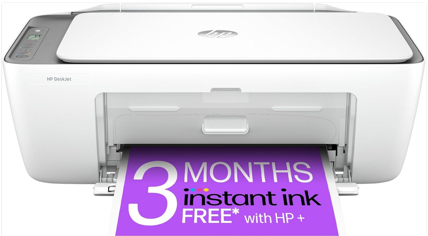
Figure 1.1: HP DeskJet 2820e All-in-One Printer, front view.

The HP DeskJet 2820e is a versatile all-in-one printer designed for home use, offering reliable print, scan, and copy functionalities. This compact and wireless device provides an effortless printing experience, supported by easy setup and robust Wi-Fi connectivity. This manual will guide you through every step, from initial setup to advanced features and troubleshooting.