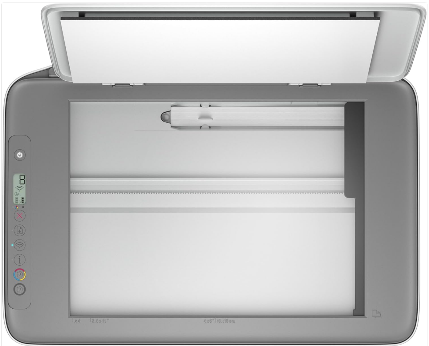
Figure 4.2: Top view of the HP DeskJet 2820e, showing the flatbed scanner.