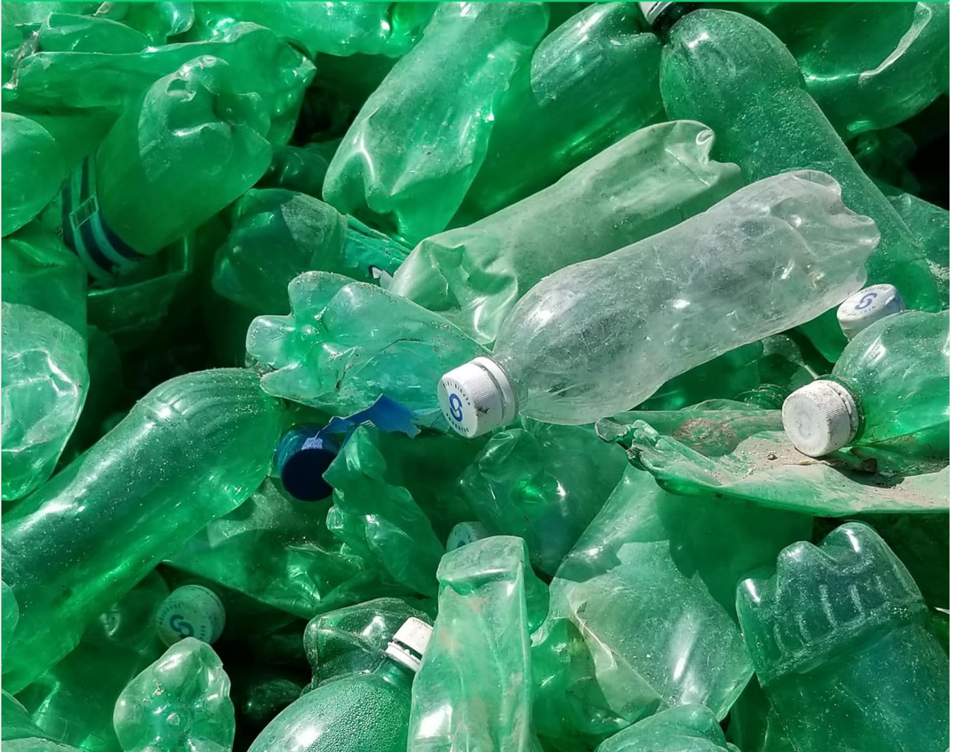
Figure 5.2: HP's commitment to using recycled plastic in product manufacturing.