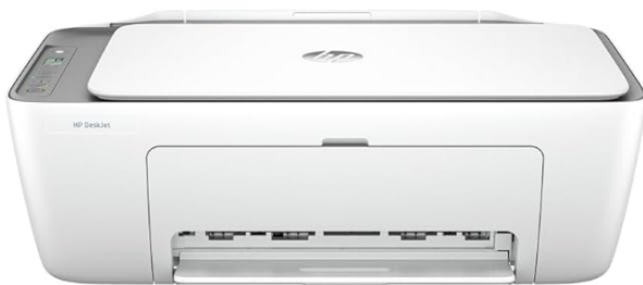
HP DeskJet 2820e All-in-One Printer