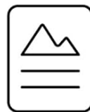
Setup flyer and reference guide