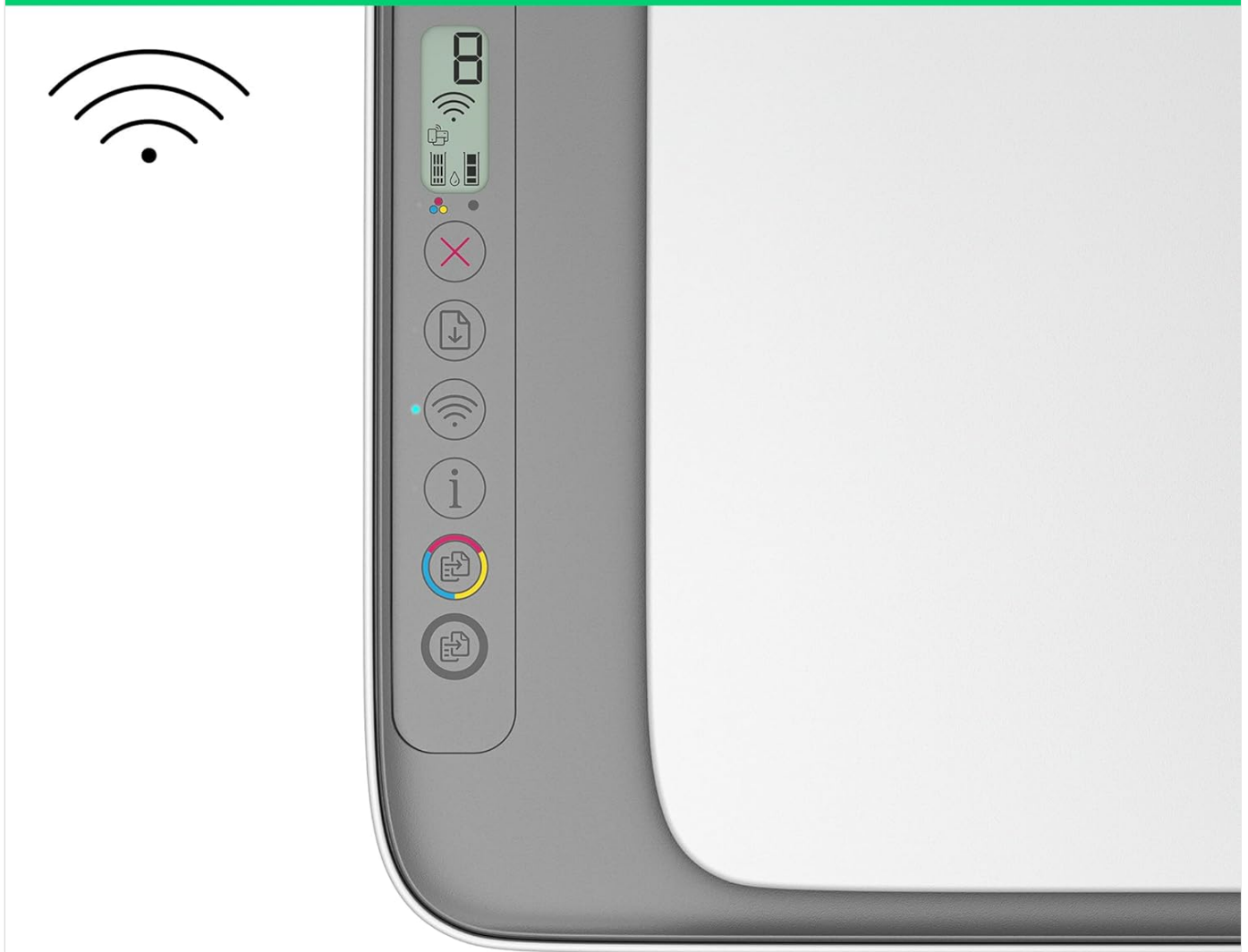
Figure 4.3: Close-up of the HP DeskJet 2820e control panel with Wi-Fi indicator.