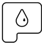
HP 305 Setup Black and Tri-colour Cartridges