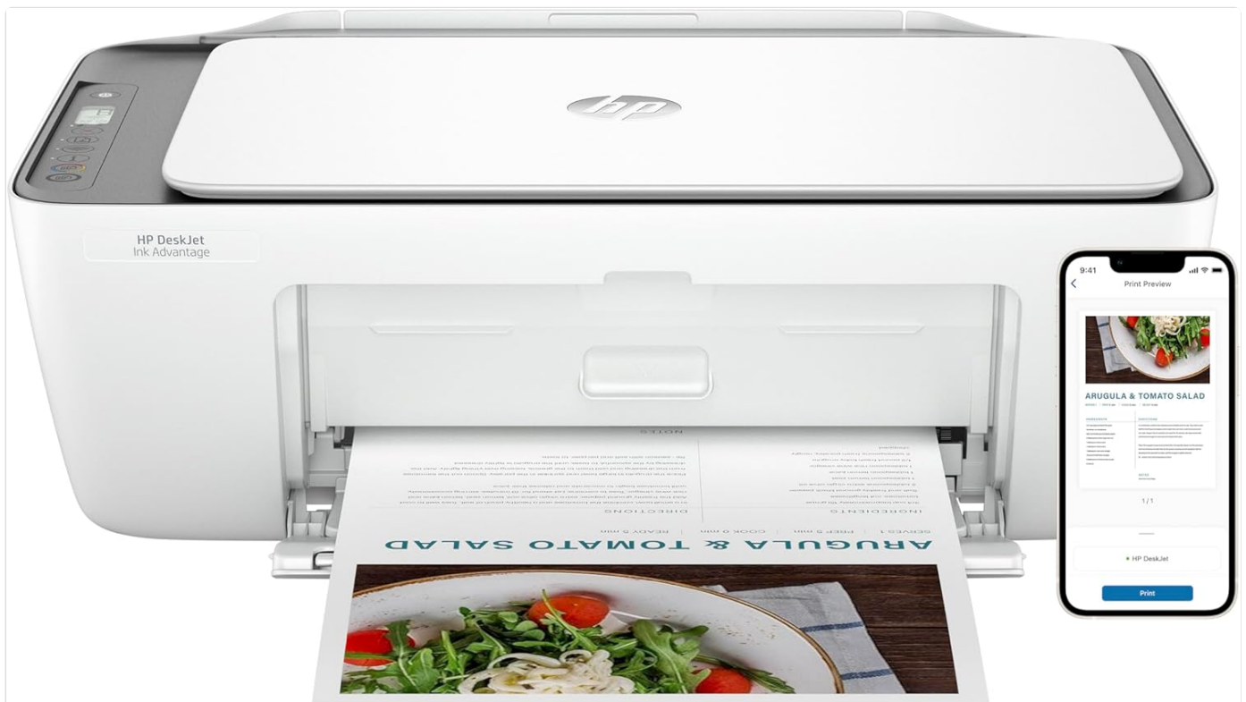
Figure 4.1: Printing a document wirelessly from a smartphone using the HP Smart app.

To print, ensure the printer is connected to your device via Wi-Fi. Open the document or photo you wish to print, select the print option, choose your HP DeskJet 2820e, and adjust settings as needed. The printer supports black and white printing at 7.5 pages per minute (ppm) and color printing at 5.5 ppm.