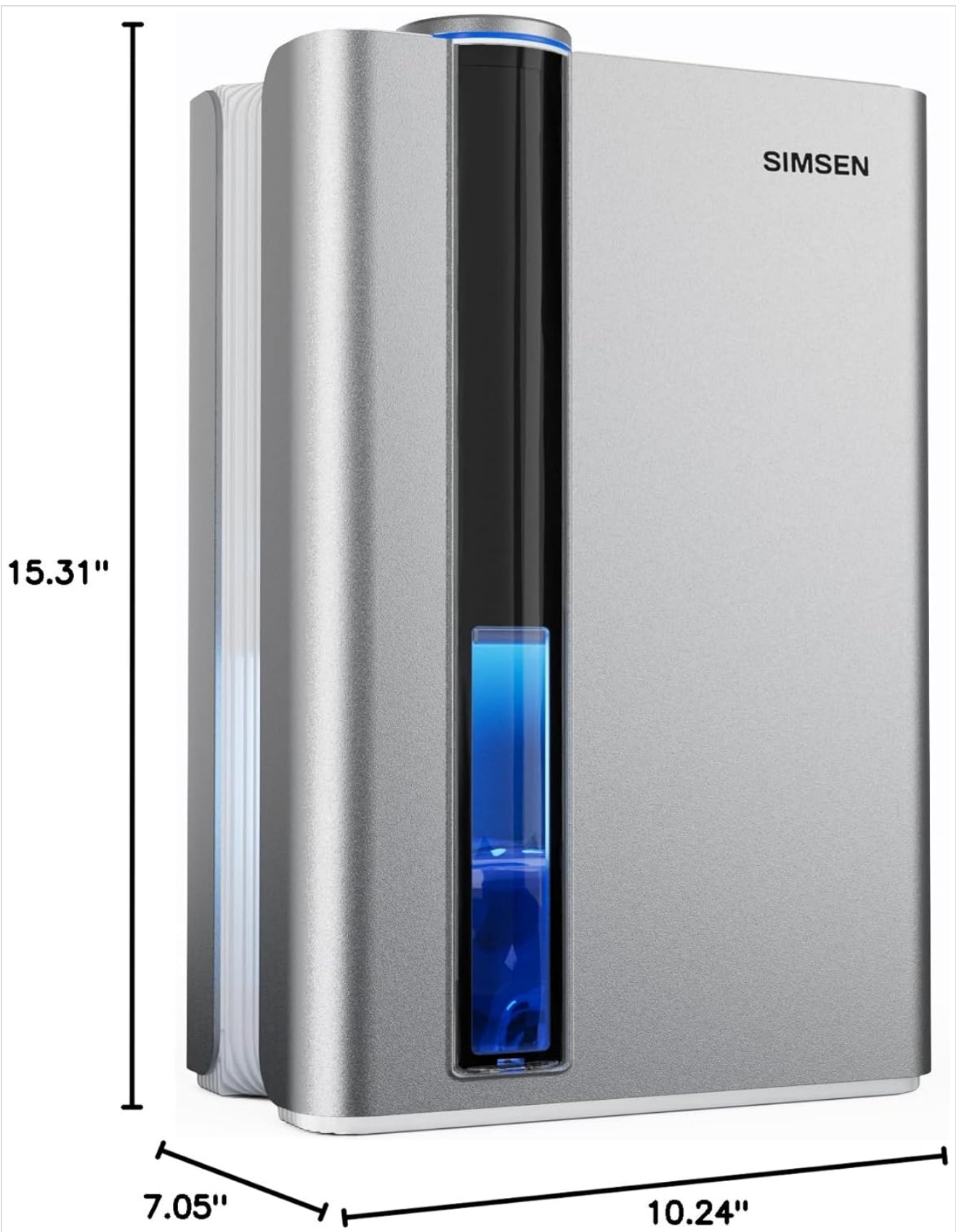
Figure 3: Product dimensions for the Simsen CT15 Dehumidifier, measuring approximately 7.05 inches in width, 10.24 inches in depth, and 15.31 inches in height.