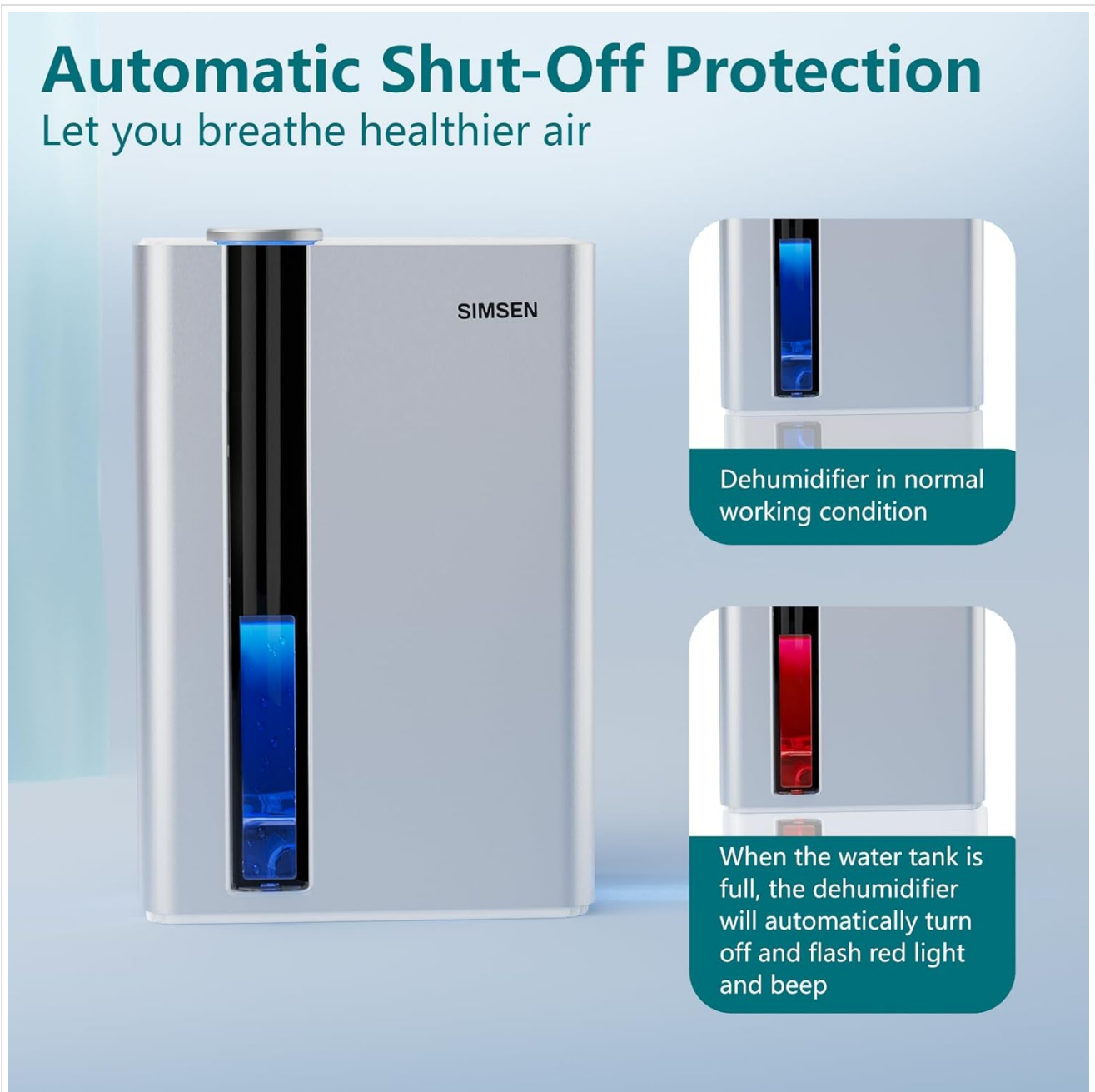
Figure 5: Automatic Shut-Off Protection: The unit will automatically turn off and flash a red light with a beep when the water tank is full, preventing overflow.