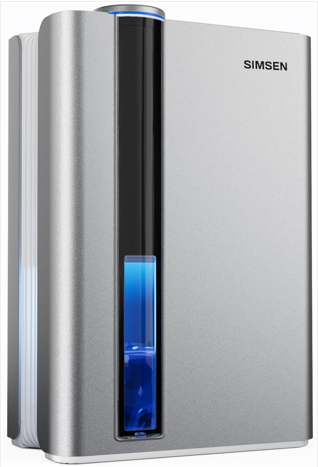
Figure 1: Front view of the Simsen CT15 Dehumidifier, showcasing its sleek silver design and visible water tank.