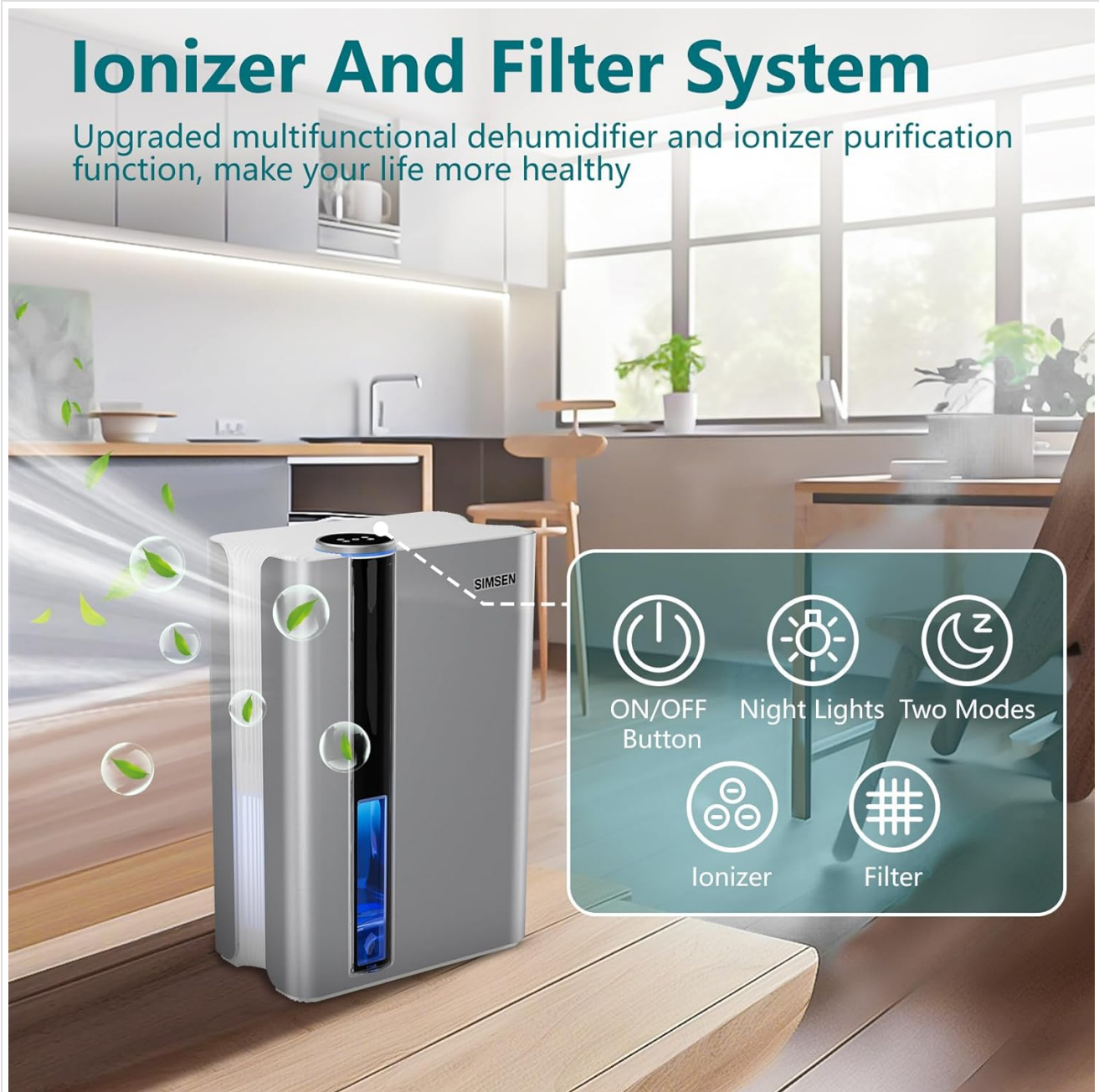
Figure 4: Control panel with touch-sensitive buttons for various functions.

The Simsen CT15 Dehumidifier features an intuitive control panel for easy operation.