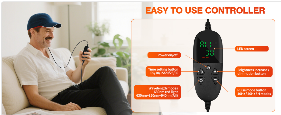
Figure 6.1: Recommended usage for the Red Light Cap.

The cap is lightweight and suitable for various settings, including home, office, and gym, allowing you to integrate therapy into your daily routine.