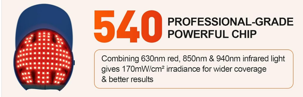
Figure 6.2: The cap's design with 540 LED chips for high irradiance.