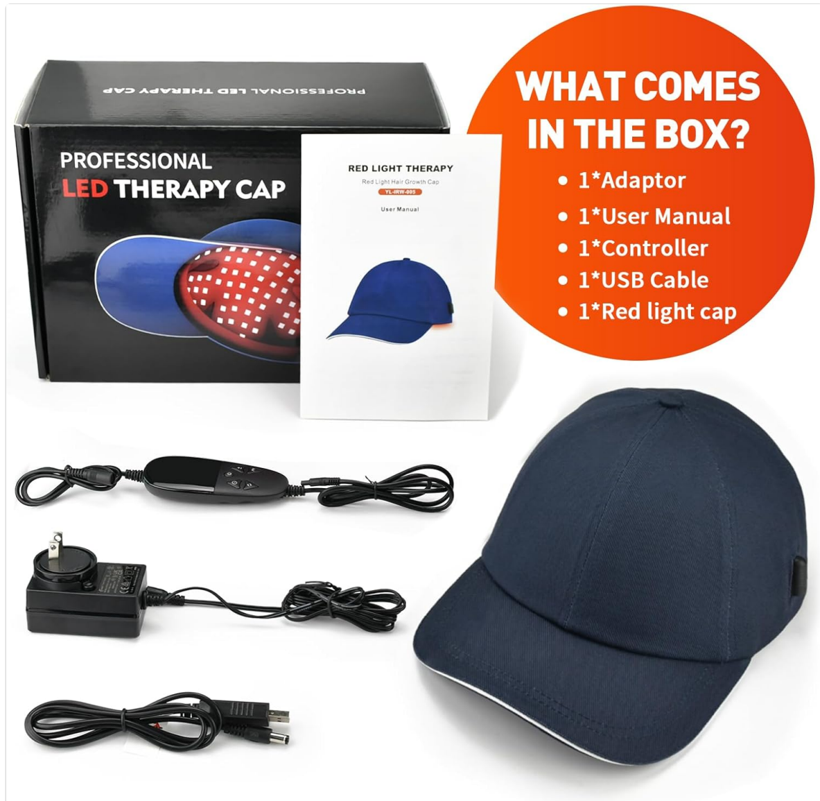
Figure 3.1: All components included in the Red Light Cap package.