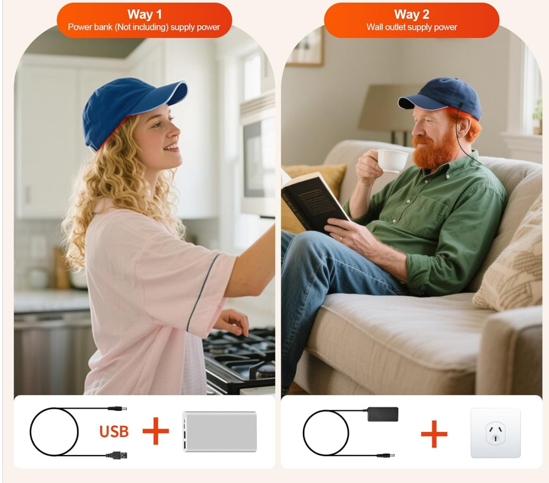
Figure 4.3: Dual power options for the Red Light Cap.