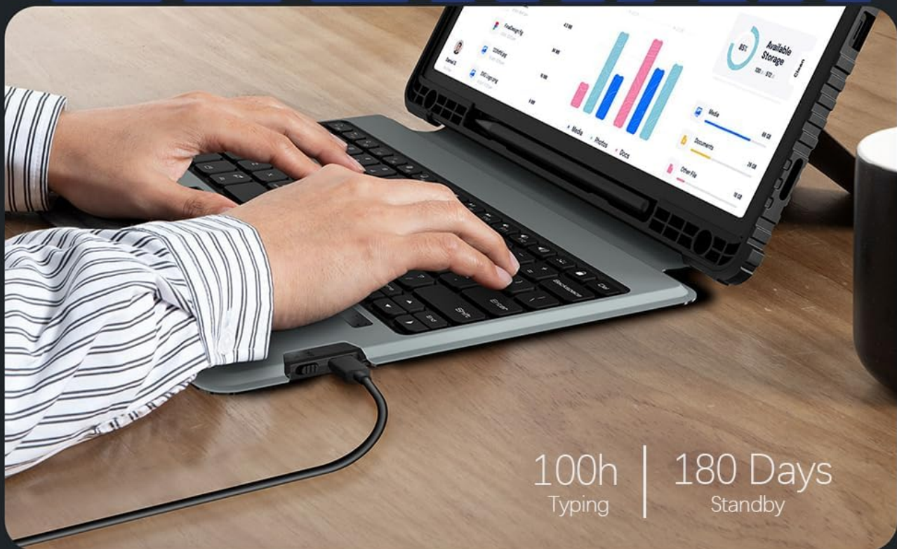
Image: Battery life details, showing 100 hours of typing and 180 days of standby time for the 500mAh battery.