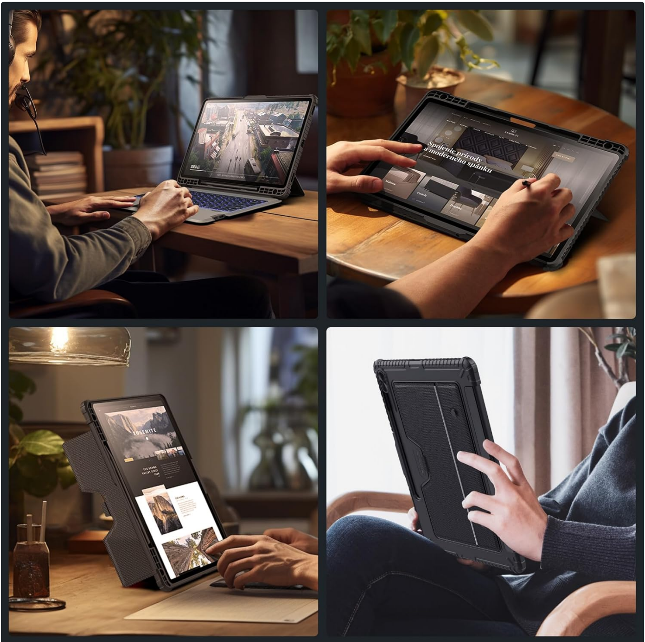
Image: Multiple usage scenarios for the Nillkin keyboard case, including typing, reading, and drawing.