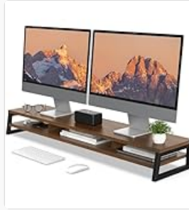
Image 2.2: The adjustable foot mechanism allows for precise height tuning.

Image 2.1: Detail of the stand's construction, highlighting the sturdy board, solid legs, and adjustable feet for height customization.