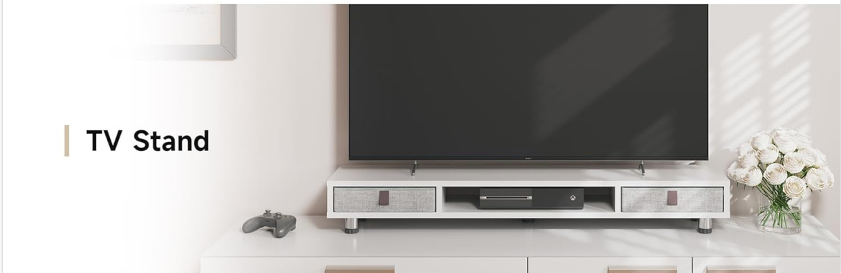
Image 3.2: The stand's versatility allows it to function as a printer station, dual monitor riser, or TV stand.