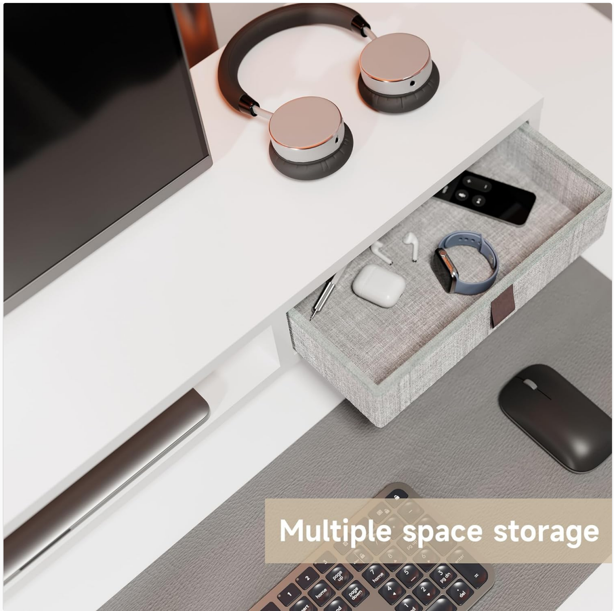
Image 3.1: The practical slide-out drawers offer convenient storage for small items, keeping your workspace clutter-free.