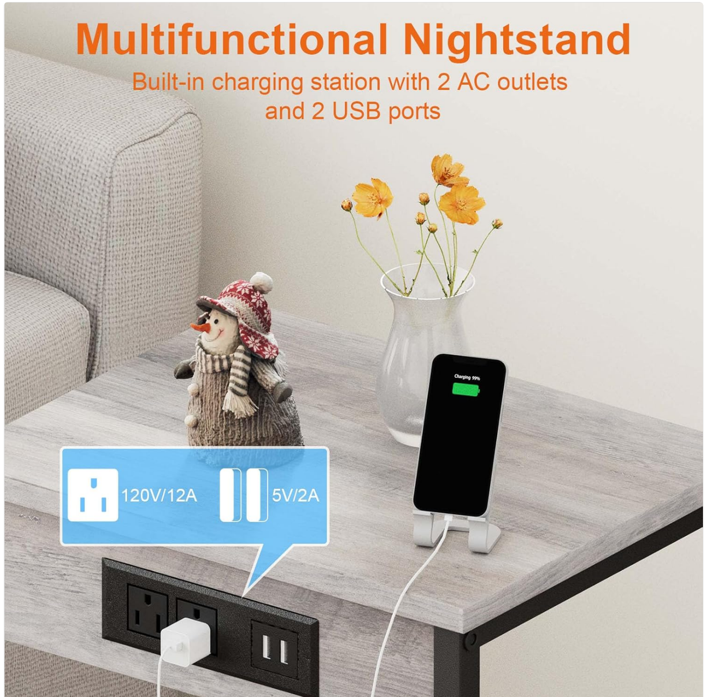
Image: Detail of the integrated charging station with AC and USB ports.

Your Fixwal End Table is equipped with a convenient charging station to power your electronic devices.