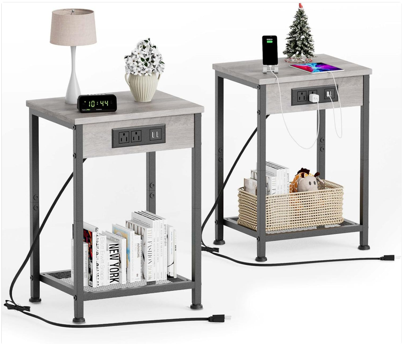
Image: Two Fixwal end tables, showcasing their design and functionality with a lamp, books, and a charging phone.