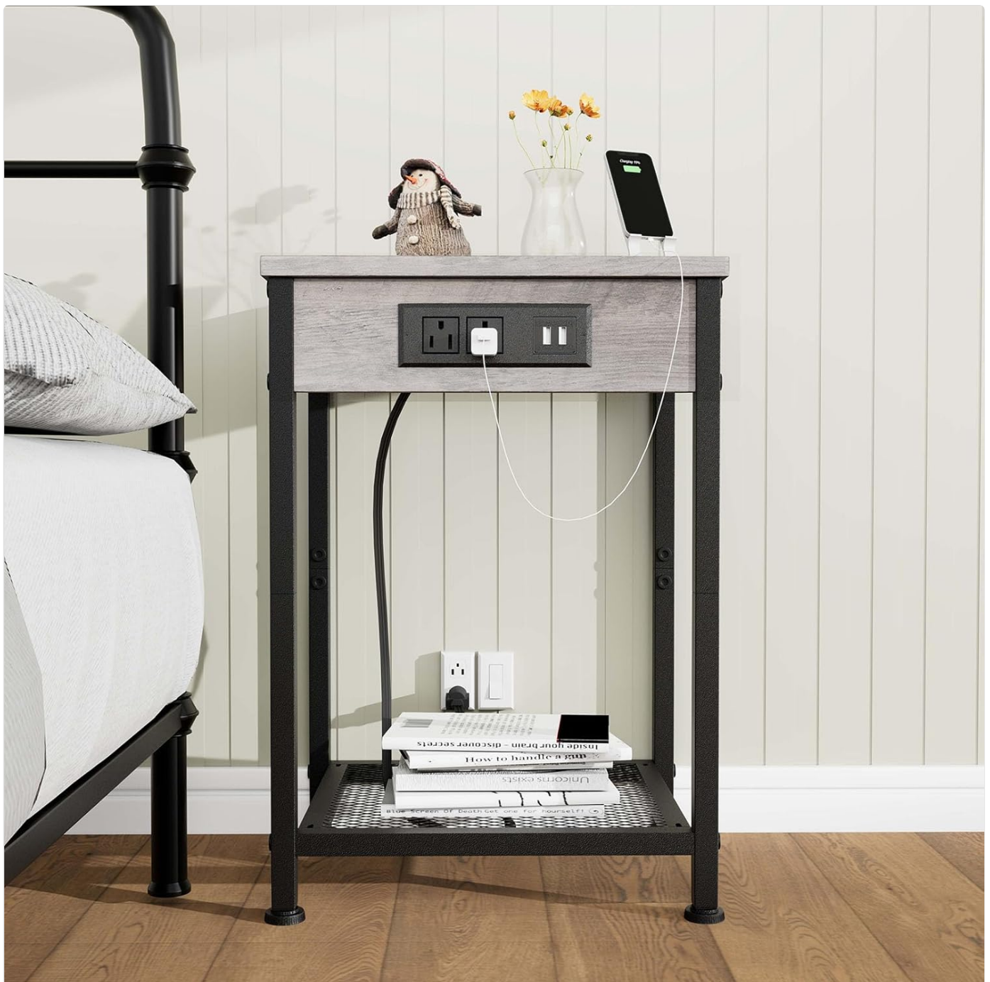
Image: End table in a bedroom setting, demonstrating its use as a nightstand with charging capabilities.