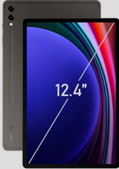
Galaxy Tab S9 Plus