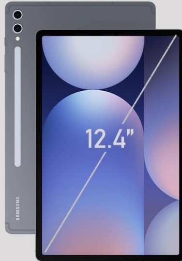
Galaxy Tab S10 Plus