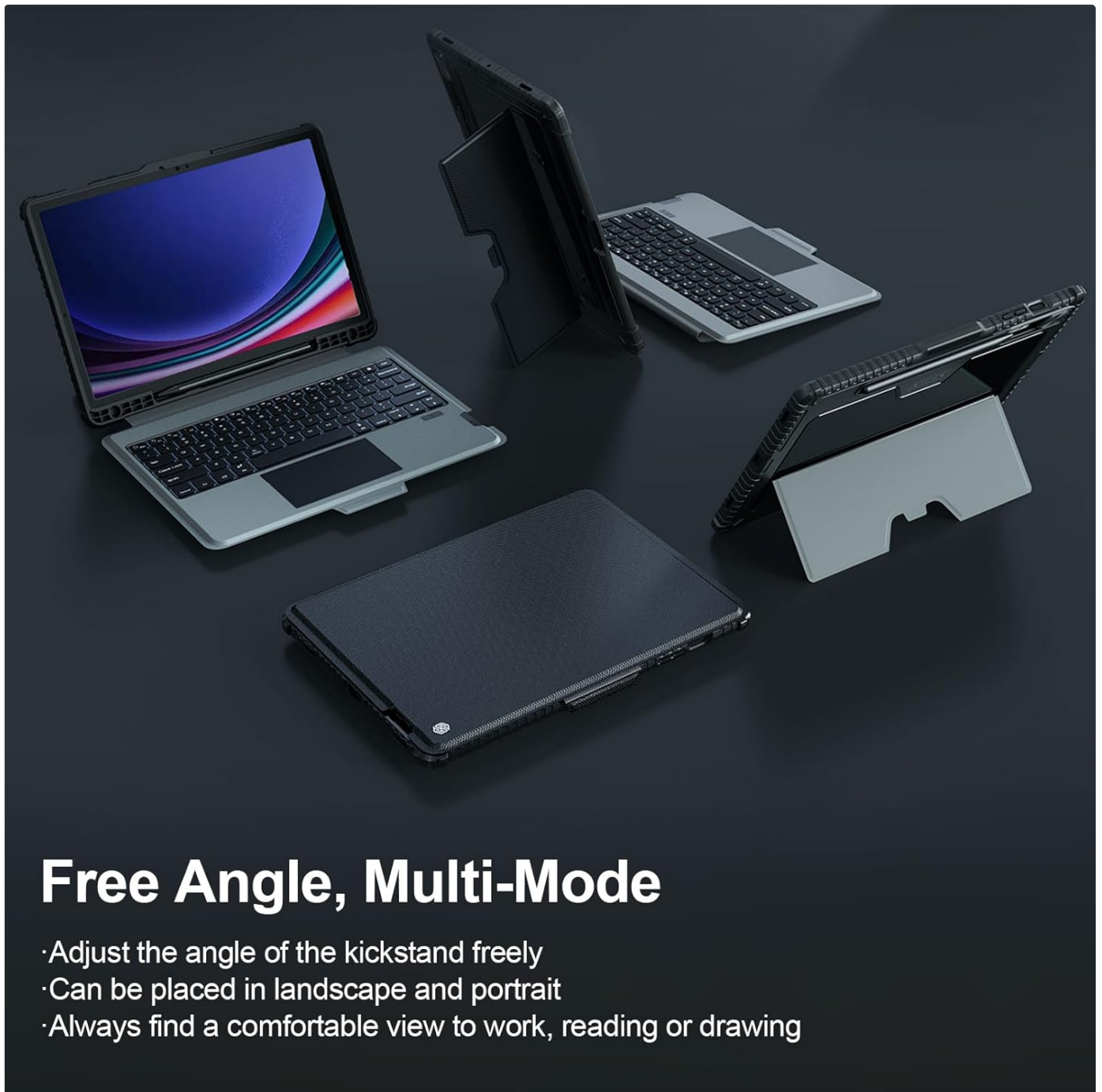
Figure 6: Multiple viewing angles and detachable keyboard functionality.