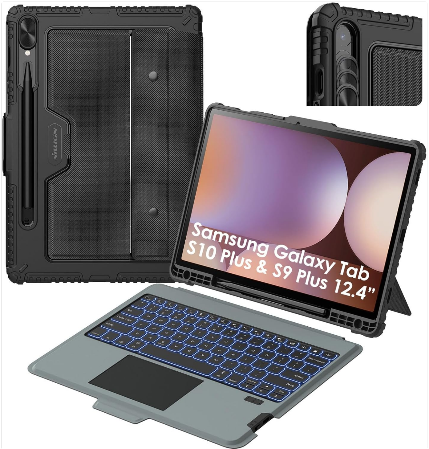
Figure 3: Assembled Nillkin keyboard case with tablet and detachable keyboard.