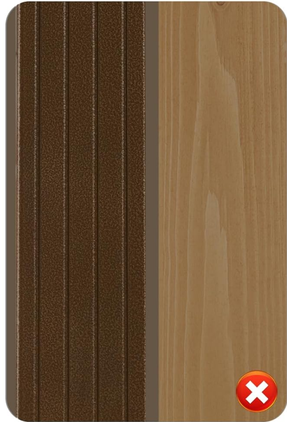
Figure 2: Wood-look aluminum finish on pergola components.