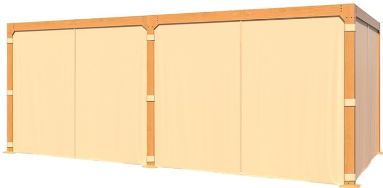
Figure 4: Reinforced corner design and sturdy anchoring plates.

Protection from Elements Enhanced Privacy ▶