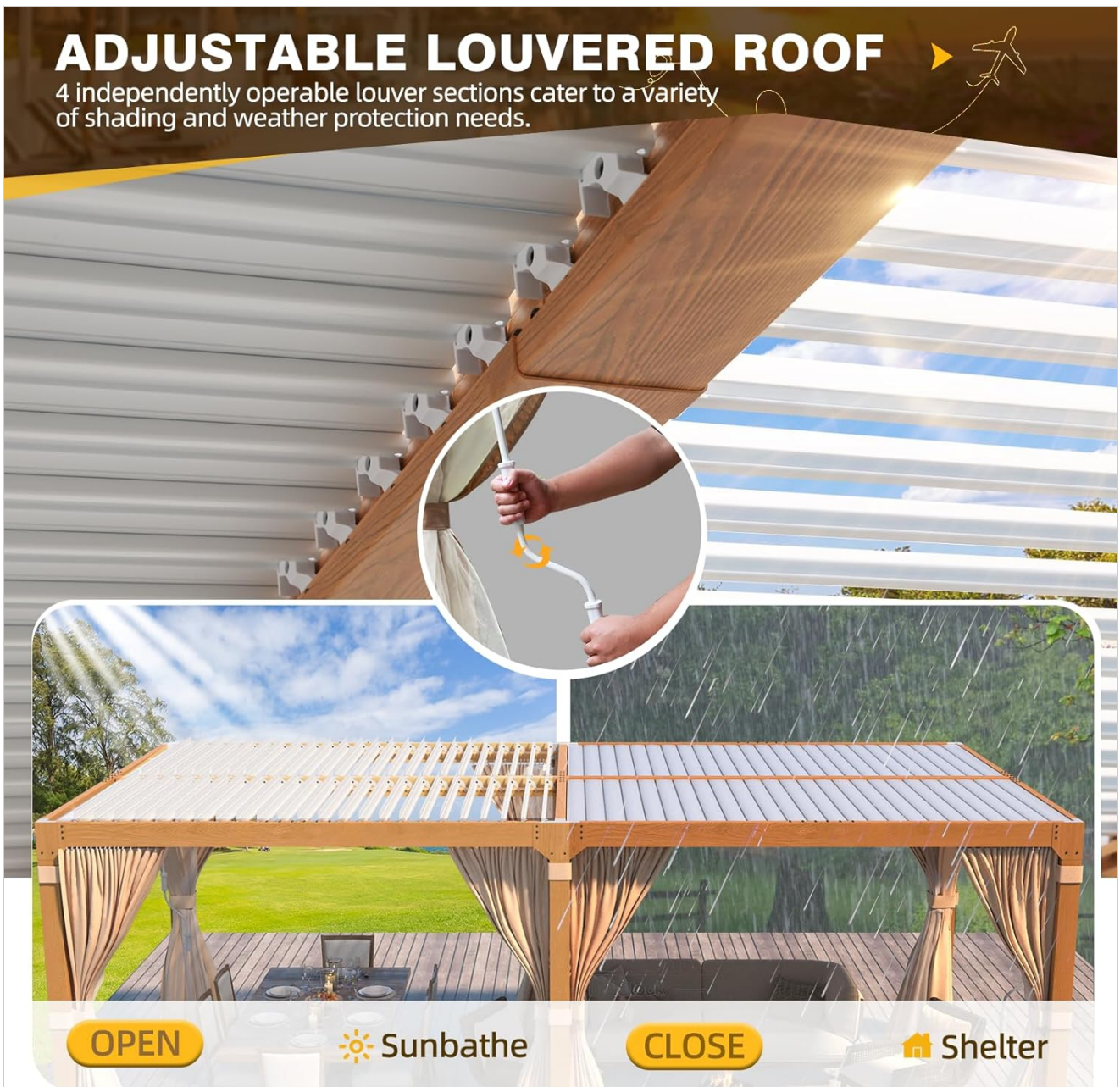
Figure 6: Adjustable louvered roof for versatile shading and weather protection.

When fully closed, the louvered roof provides a waterproof barrier, directing rainwater into the internal drainage system.