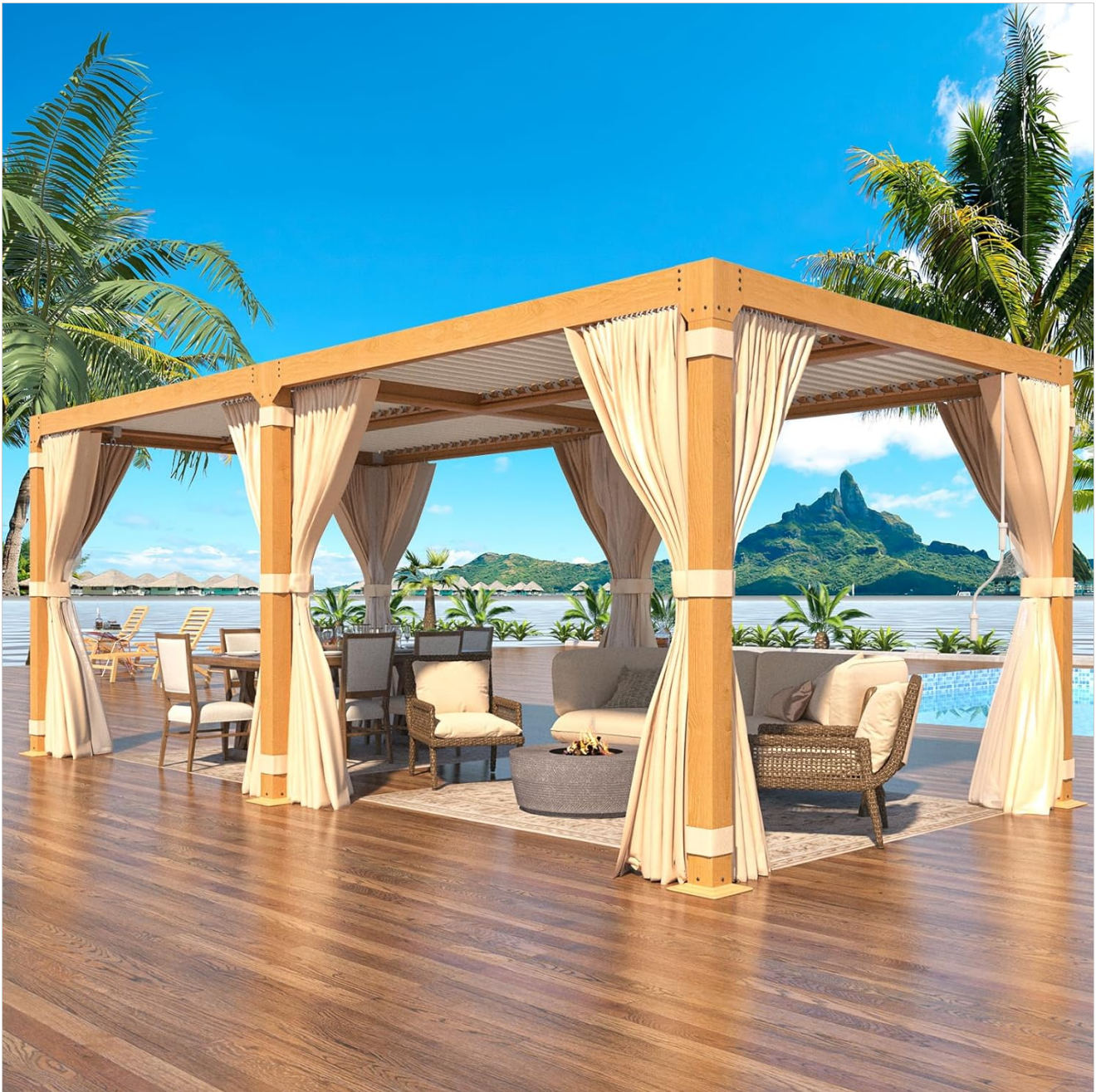
Figure 7: Versatile use with curtains and nets for light, insect protection, and privacy.