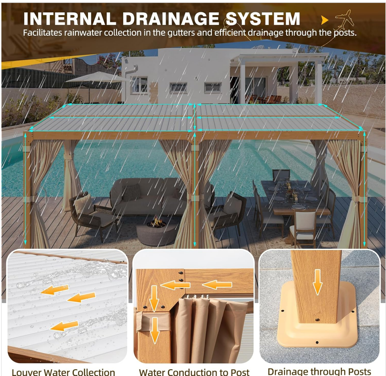
Figure 8: Internal drainage system for efficient rainwater management.