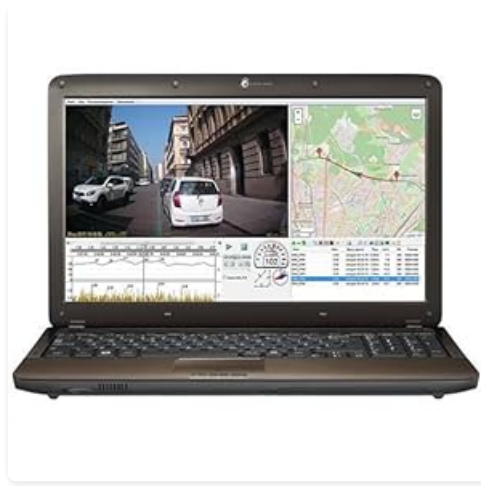
Image: A laptop screen displaying GPS tracking data, illustrating the camera's built-in GPS feature.