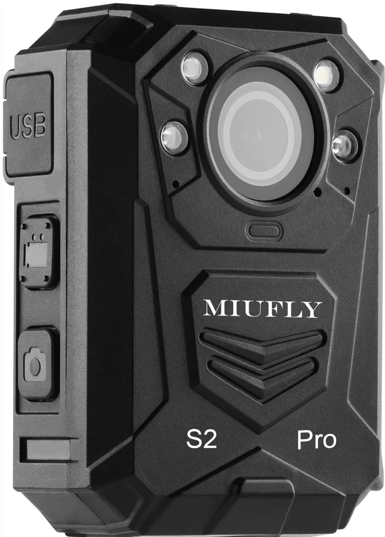
Image: Front view of the MIUFLY S2 PRO 2K Voice Control Camera, showcasing its compact and rugged design.