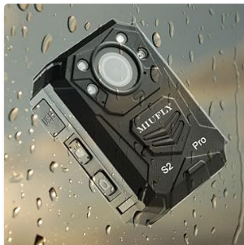
Image: The MIUFLY S2 PRO camera shown with water droplets, illustrating its IP67 waterproof resistance.