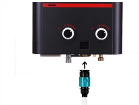
Image: A hand connecting a water inlet hose to the water heater, illustrating the setup process for water supply.