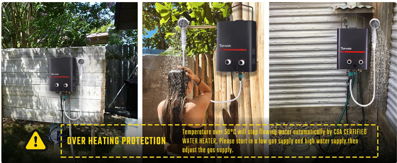
Image: A visual warning indicating overheating protection, showing the water heater in an outdoor setting with water flowing.