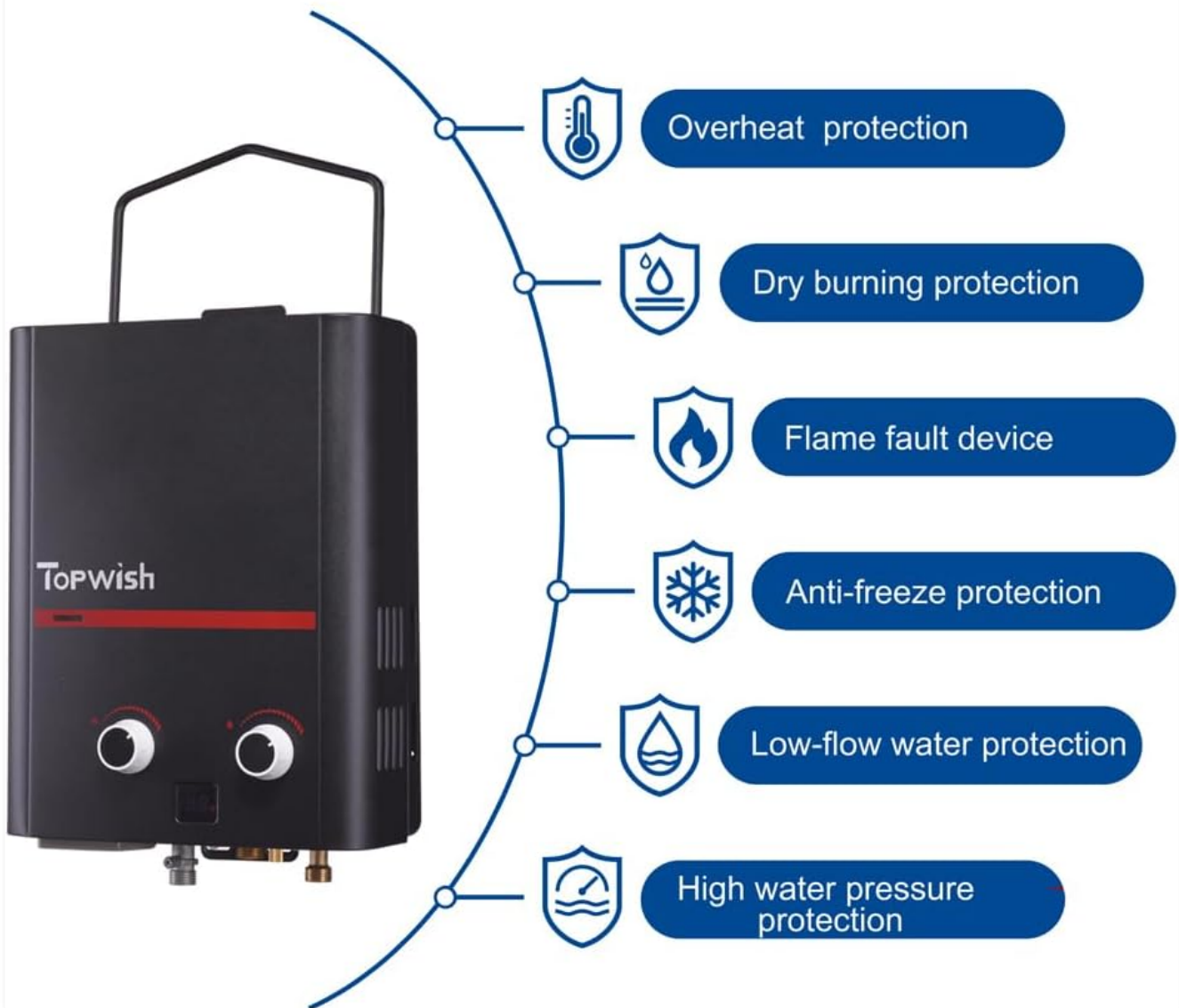
Image: A close-up view of the water heater's intelligent knob controls, highlighting the temperature display, gas control, and water control centers.