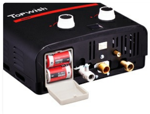
Image: A close-up view of the battery compartment, showing the insertion of D-cell batteries for the igniter.

The unit requires two D-cell batteries (not included) for ignition. Open the battery compartment on the side of the unit, insert the batteries according to polarity markings, and close the compartment.