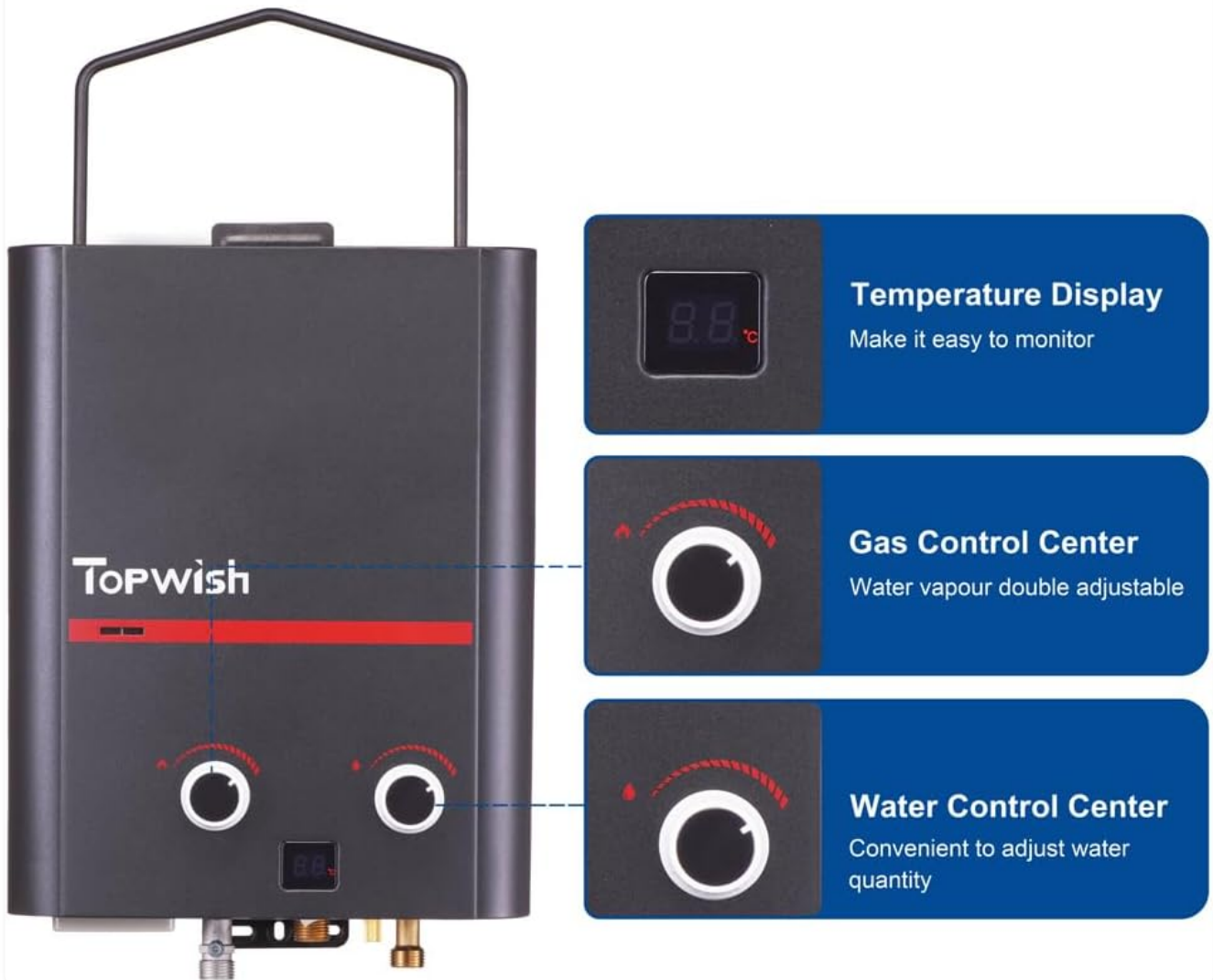
Image: The TOPWISH Portable Propane Water Heater, showcasing its compact design and control knobs.