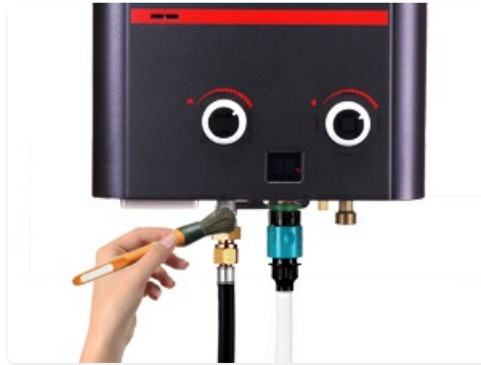
Image: A hand applying a soapy solution to a gas connection on the water heater, demonstrating the method for checking gas leaks.