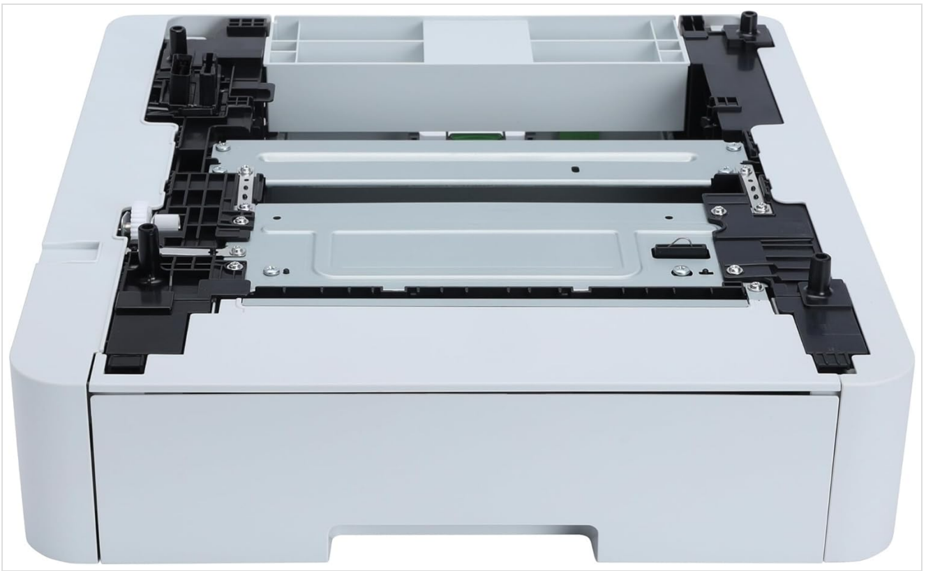
Image: Top view of the LT310CL paper tray, illustrating the interface where a compatible printer will be placed.