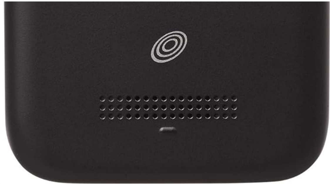
Figure 2: Back view of the BLU View 2 smartphone. The rear panel features the main camera lens with an LED flash, the BLU brand logo, and a speaker grille at the bottom.