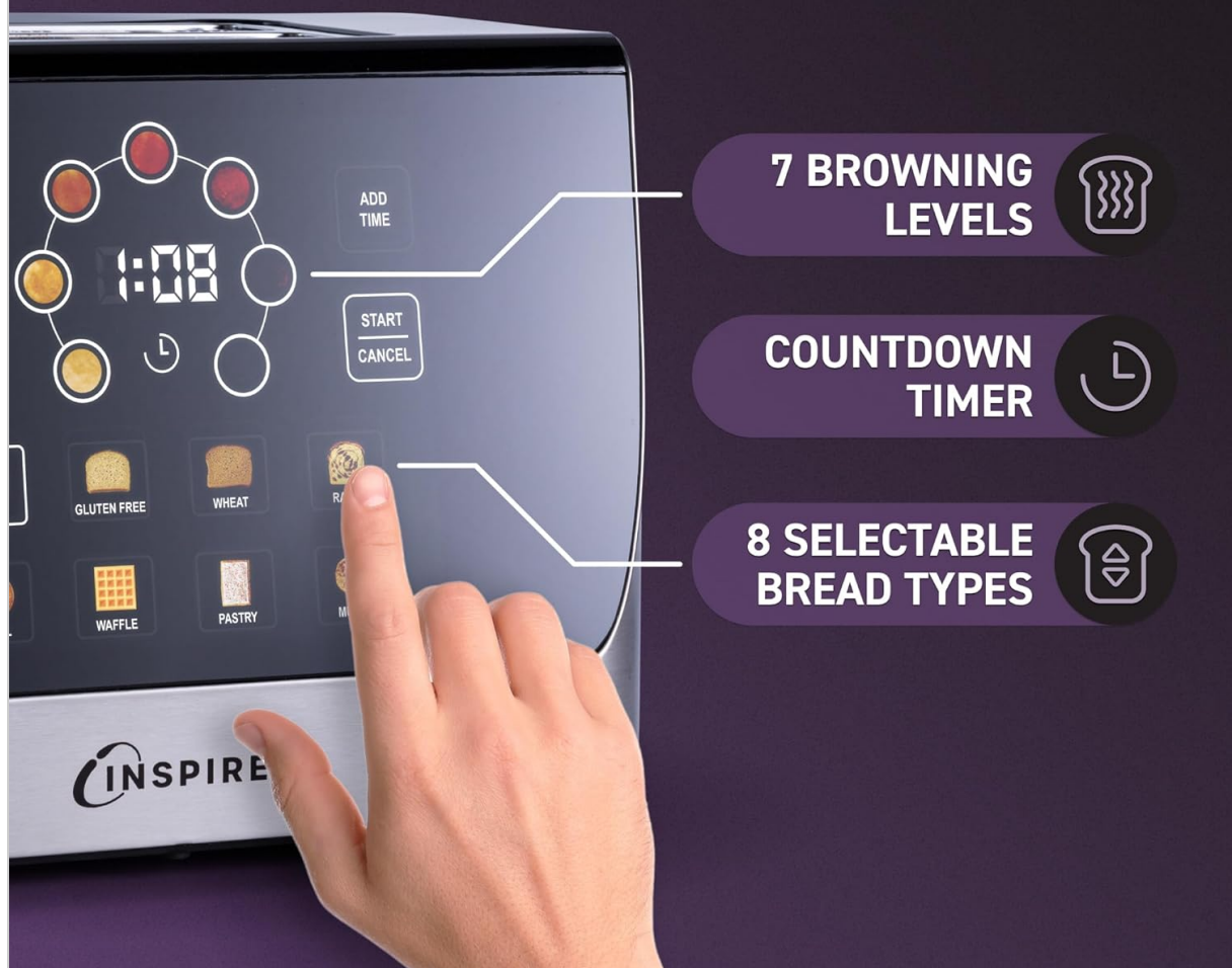
Image: Touchscreen display highlighting bread type selection and browning level options.