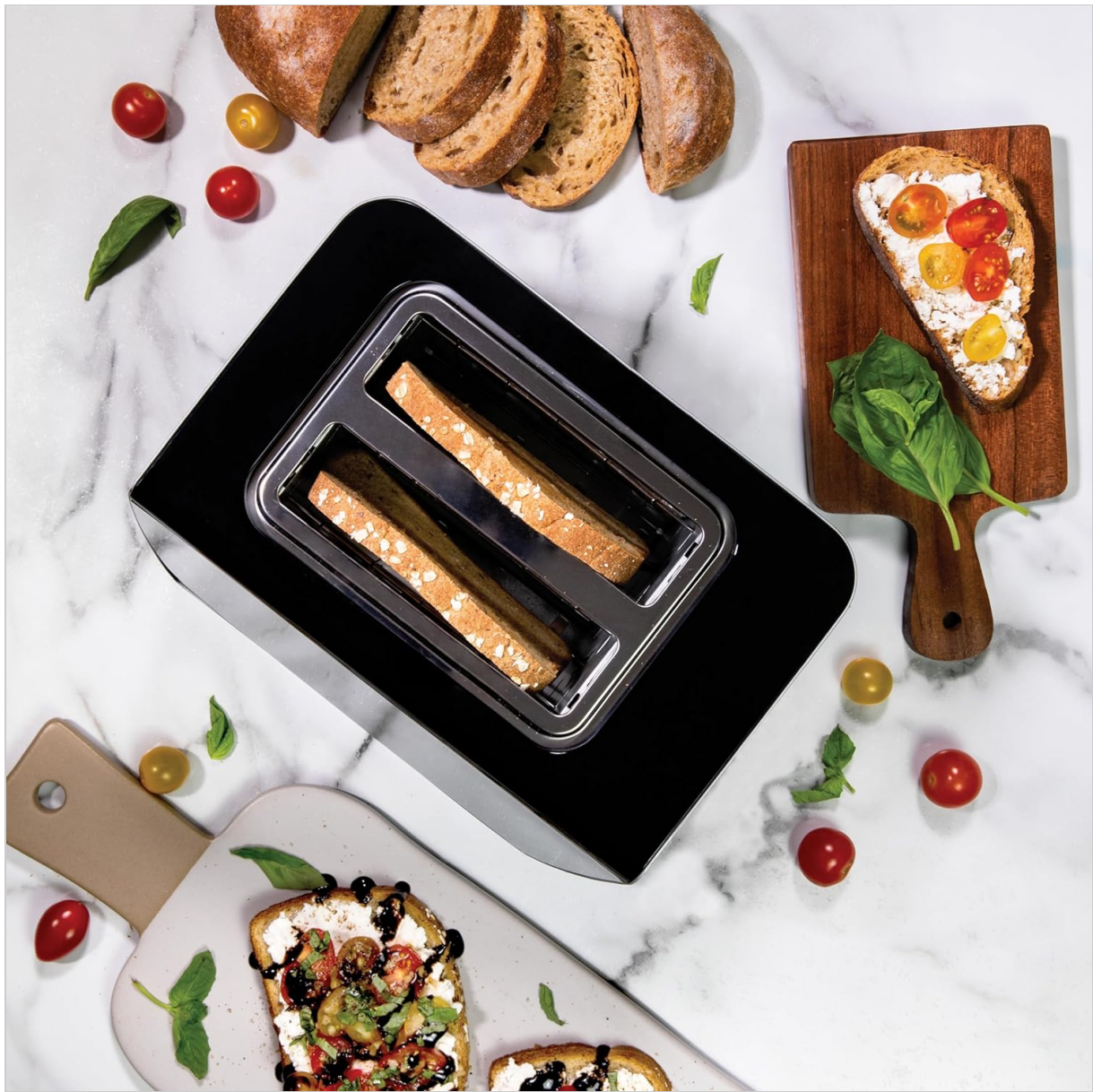
Image: A top-down view of two slices of toast in the toaster, demonstrating the even toasting.