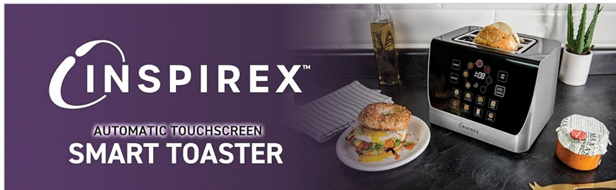
Image: The Inspirex Smart Toaster showcasing its touchscreen interface and automatic features.

The Inspirex Touch Screen Display Smart Toaster is designed to provide precise toasting for various bread types. It features a touchscreen interface for selecting settings, automatic bread lowering and raising, and multiple browning options. This manual provides instructions for safe operation, maintenance, and troubleshooting.