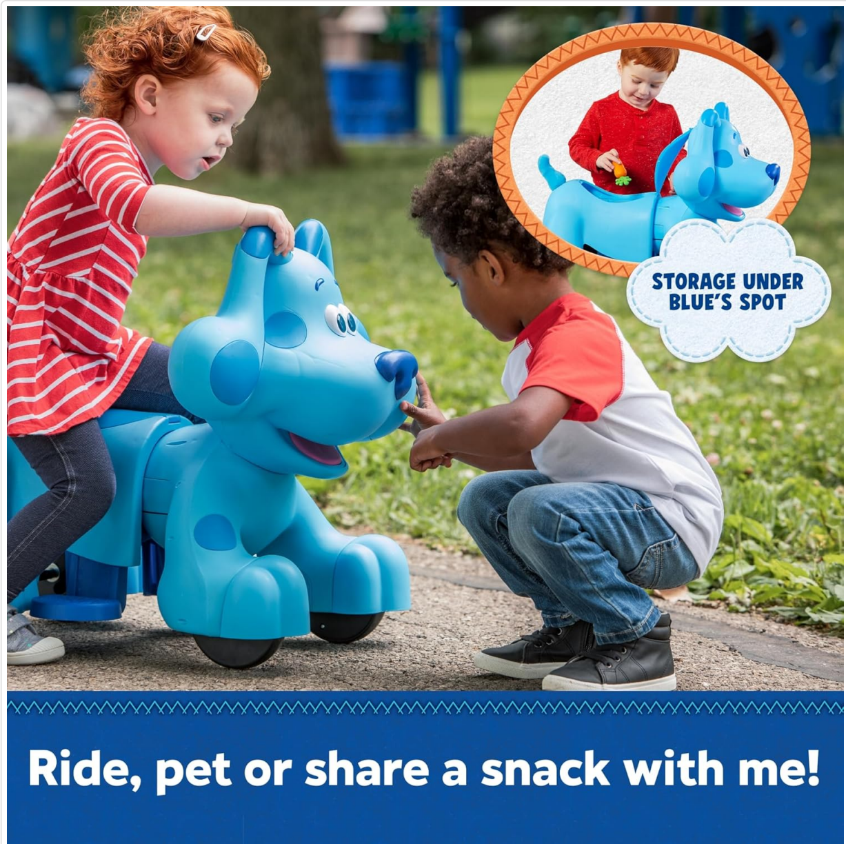
Image: Two children interacting with the Blue's Clues ride-on toy, one petting Blue and the other looking at the storage compartment under Blue's spot.