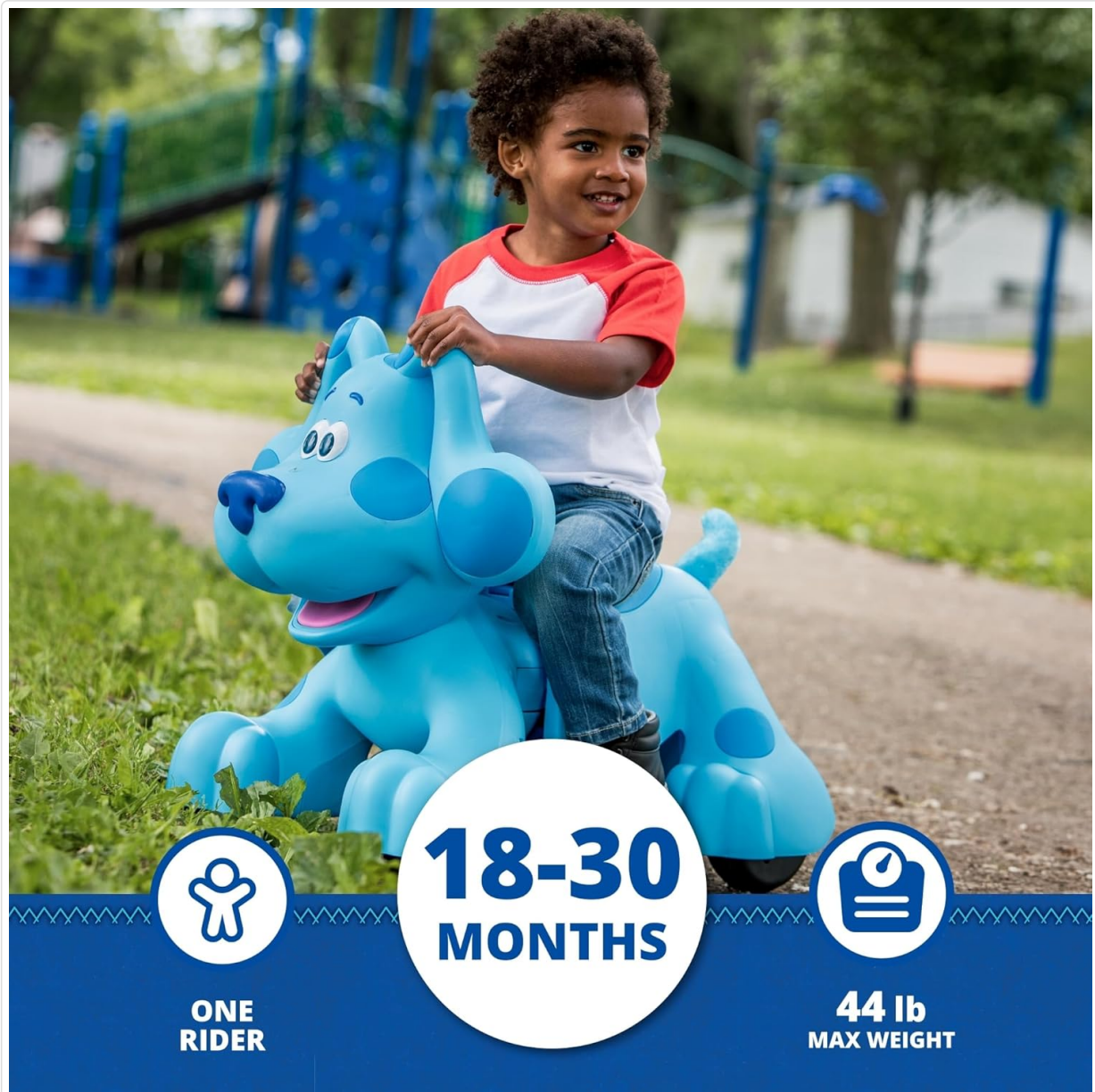
Image: A child riding the Blue's Clues ride-on toy outdoors, with an overlay indicating "One Rider", "18-30 Months", and "44 lb Max Weight".