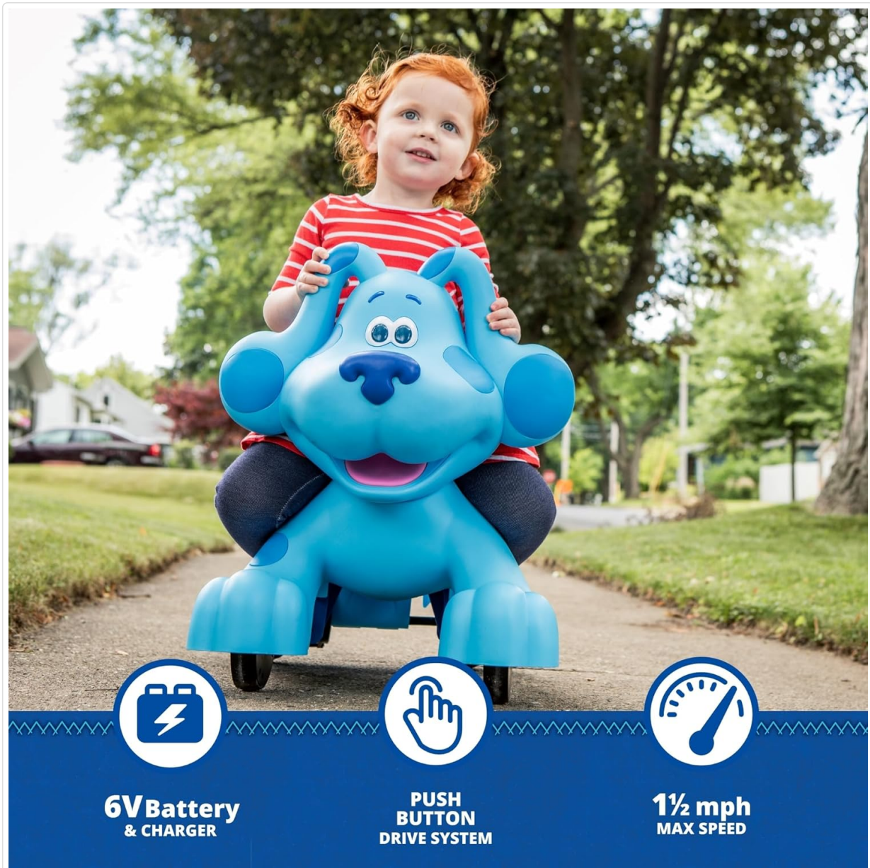
Image: A child riding the Blue's Clues toy, with icons indicating a 6V battery and charger, push-button drive system, and 1.5 mph max speed.