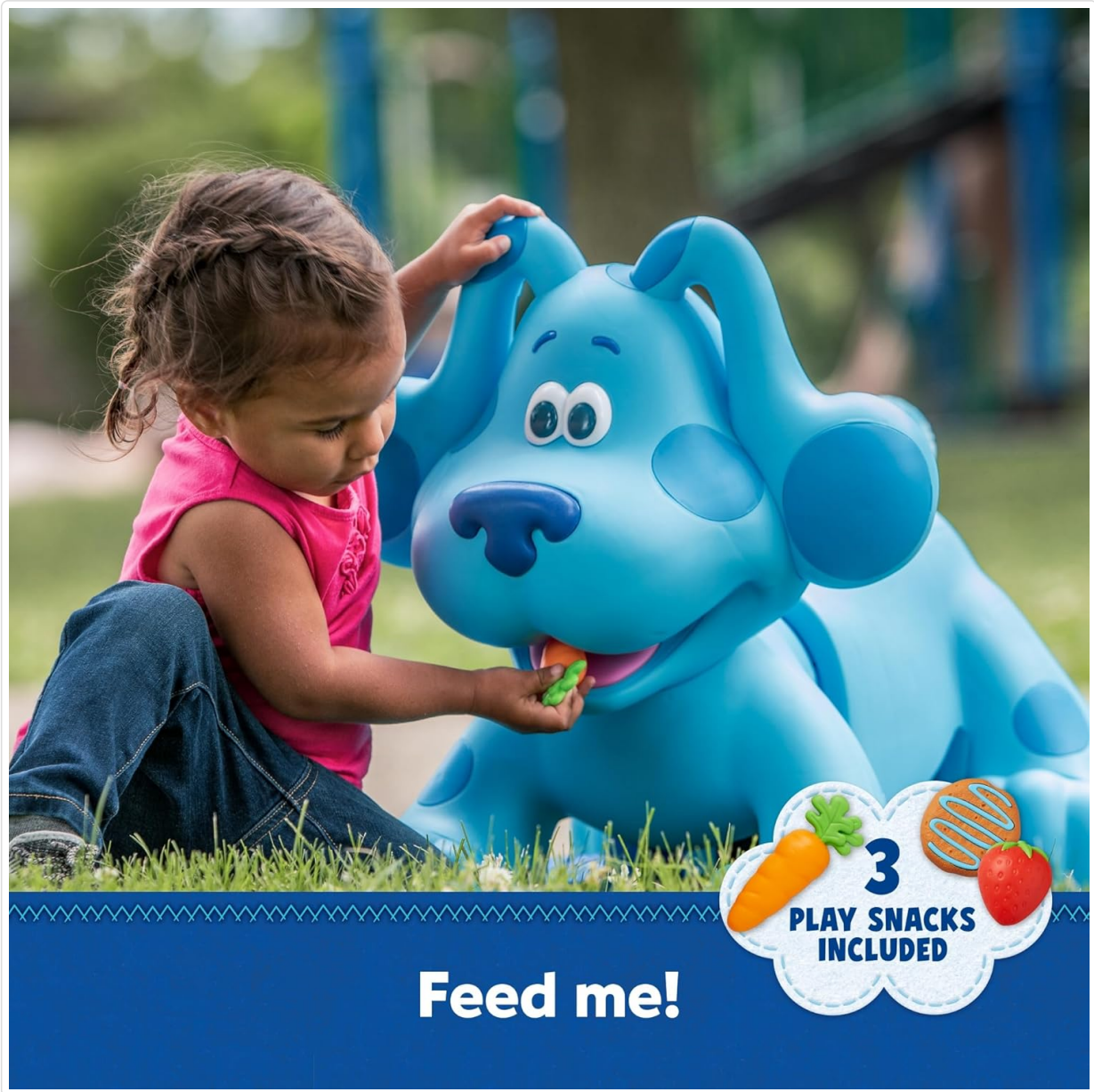
Image: A child feeding a toy carrot to the Blue's Clues ride-on toy, with an overlay showing the three included play snacks.