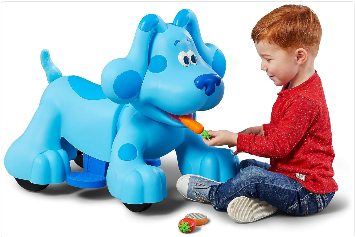
Image: The Kid Trax 6V Rideamals Blue's Clues Snack Time Interactive Ride-On Toy, featuring Blue, with a child interacting with it.