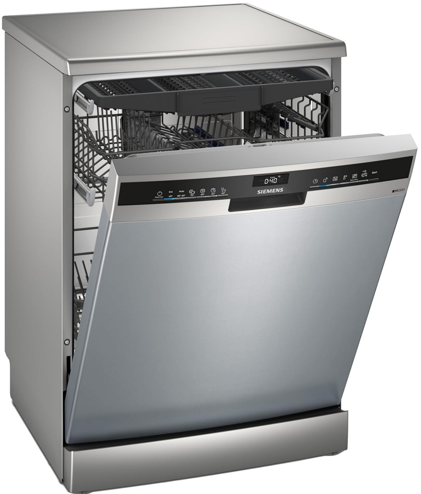
Figure 1: Siemens iQ300 Dishwasher with door open, revealing the spacious interior and user-friendly control panel.