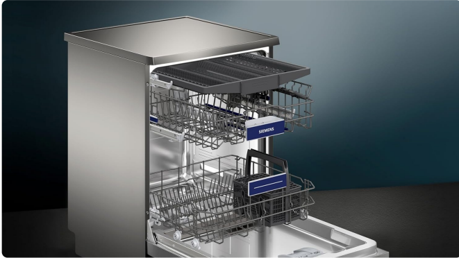
Figure 3: Interior view with adjustable racks for versatile loading.

Proper loading ensures optimal cleaning results and prevents damage to dishes. The Siemens iQ300 offers 14 place settings and flexible basket configurations.