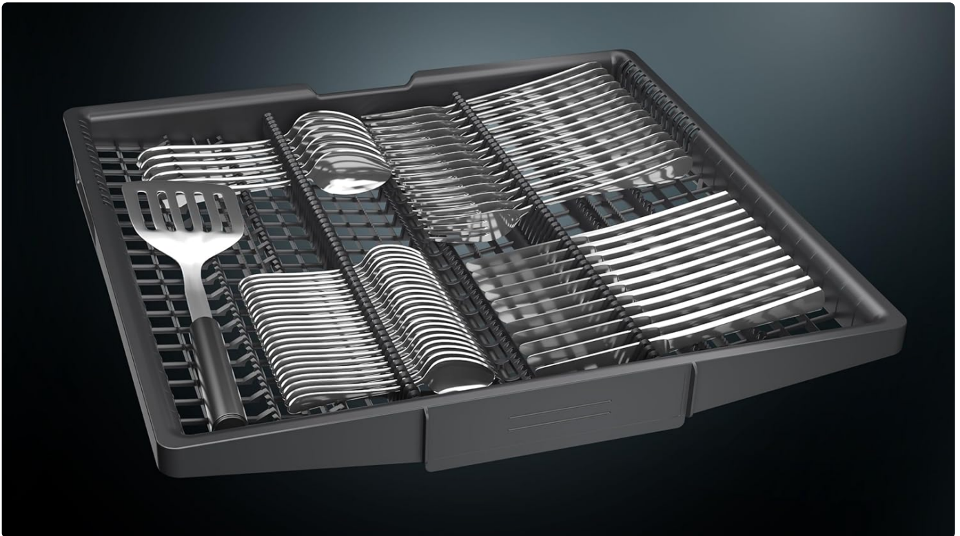
Figure 5: Dedicated third drawer for cutlery, ensuring thorough cleaning and organization.