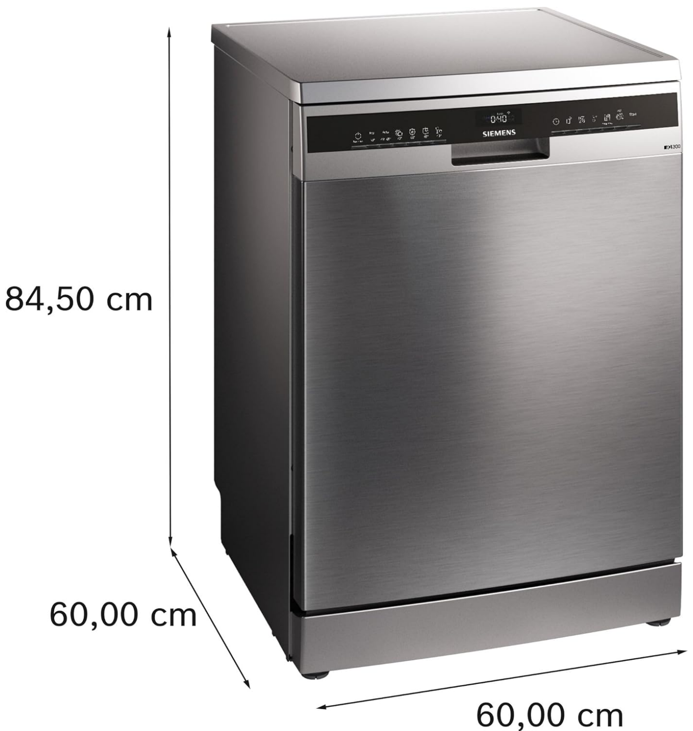
Figure 2: Product dimensions for installation. Height: 84.5 cm, Width: 60 cm, Depth: 60 cm.

Ensure the floor is level and capable of supporting the weight of the dishwasher when fully loaded with water.