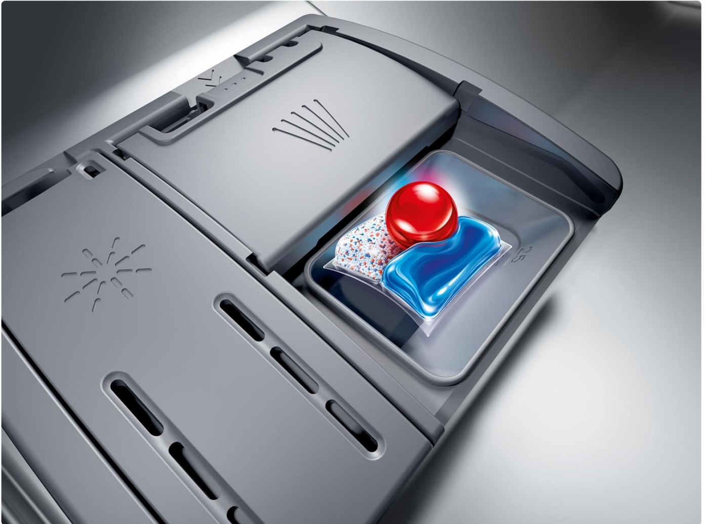
Figure 6: Detergent dispenser, designed for easy loading of tablets or powder.

Open the detergent dispenser and add the appropriate amount of dishwasher detergent (powder, gel, or tablet). Close the dispenser lid firmly.