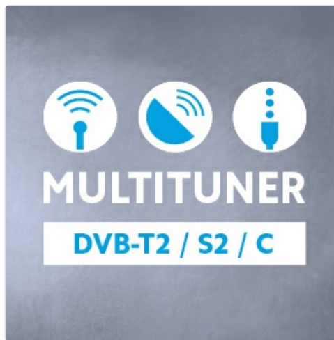
Image 4.1: The television features a multi-tuner for DVB-T2, DVB-S2, and DVB-C reception.