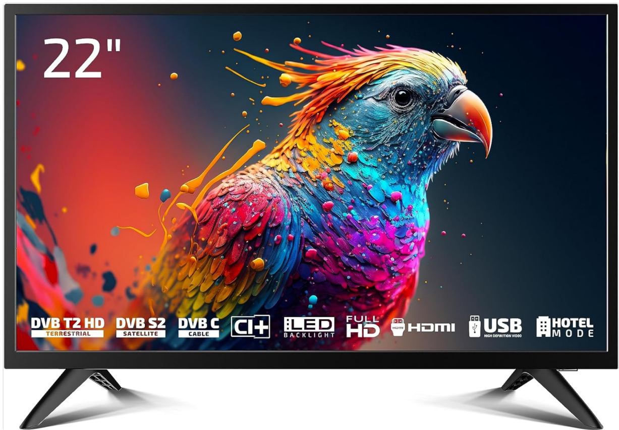
Image 1.1: Front view of the DYON Enter 22 Pro X2 Full HD Television.