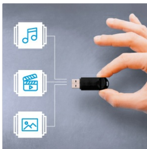
Image 4.3: The USB media player supports various file types from USB storage.

The integrated USB media player allows you to play videos, music, and view photos directly from a connected USB flash drive or external hard drive.