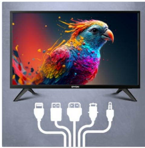
Image 3.1: Illustration of available connectivity options including HDMI and USB.